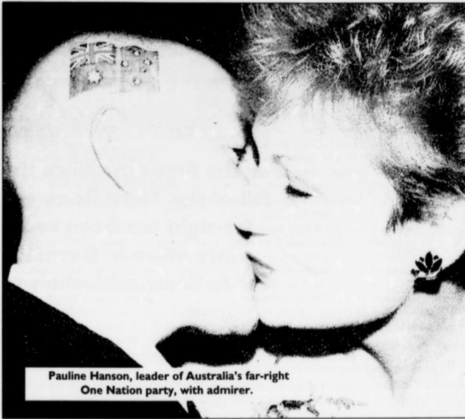
Pauline Hanson, leader of Australia's far-right One Nation party, with admirer.

democracy and human rights was responsible for the policy review on the race issue. American President Truman set up a Committee on Civil Rights which reported in 1947. 'Throughout the Pacific, Latin America Africa the Near, Middle and Far East the treatment which our Negroes receive is taken as a reflection of our attitude to all dark skinned peoples and played into the hands of Communist propagandists'.