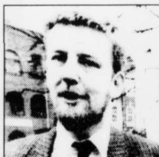
Ex-Labour MP Dave Nellist, recently elected Socialist Party councillor in Coventry