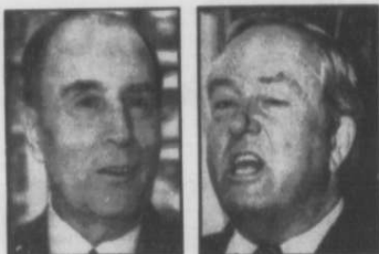
Players in a dangerous game: Mitterrand (left) and Le Pen

The group includes a former Chief of Defence Staff, former heads of individual armed services and a former Chief of Military Staff at the Presidential Palace. A very British Coup with French subtitles?