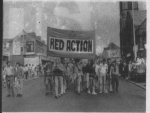
THE RED ACTION DELEGATION TO BELFAST 1984.

RED ACTION TRIP TO BELFAST AUGUST 1988. RED ACTION will be sending its annual delegation to Belfast in early August to participate in the commemoration of the introduction of internment. For new and supporting members it would be an invaluable experience. There will debates and discussions with our hosts the IRSP. Any persons interested should contact Red Action by PO Box No as soon as possible.