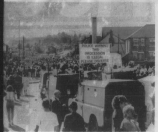
AN ILLEGAL MARCH. BELFAST 1984

Only Our Rivers Run Free is a book that should be read by all. The writers give the women they interviewed plenty of space for their description of their lives and their opinions. What it showed for me was that against all odds women in Ireland are moving forward in their political consciousness and that is encouraging.