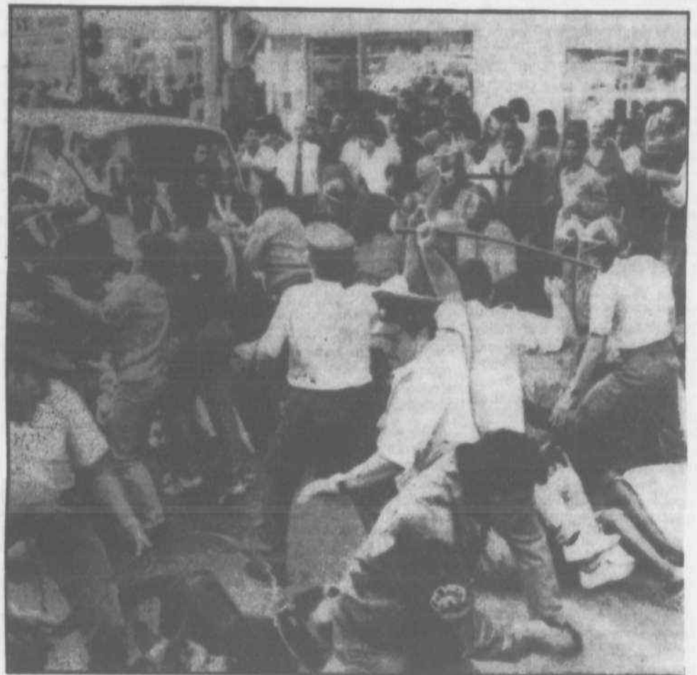
SCENES SUCH AS THIS, HAVE QUITE RIGHTLY BROUGHT CONDEMNATION UPON THE THE SOUTH AFRICAN GOVERNMENT FROM ALL OVER THE WORLD FROM ALL SECTIONS OF SOCIETY.

The black South Africans themselves understand this well enough, which is why they refused to meet Geoffrey Howe on his recent trip. They know that the only true friends of oppressed people, are others themselves oppressed. Victory to the ANC. Victory to armed Republican Movement, and all revolutionary freedom fighters