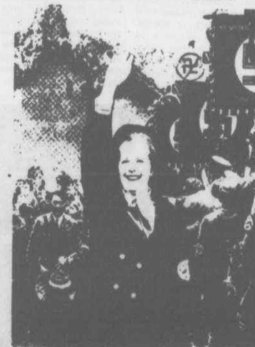
DURING THE LAST GREAT CRISIS OF CAPITALISM CONSERVATIVES EVERYWHERE BACKED HITLER'S RISE TO POWER