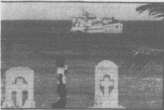
A VERY APT SCENE FROM ONE OF THE MARSHALL ISLANDS

In 1959, U.S. propaganda films had described the Islanders as "just savages". You can make your own mind up as to who the real savages are.