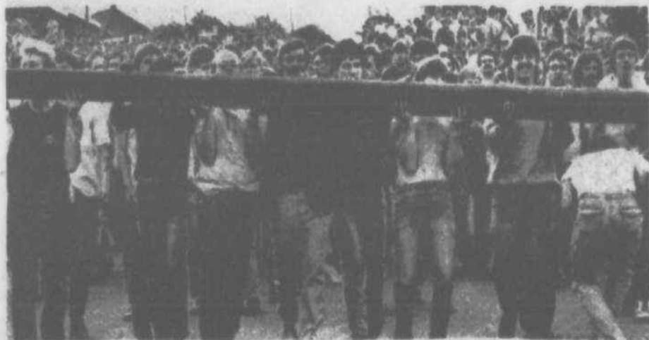
MASS ACTION ? SQUADISM ? OR BOTH ?

Leon Trotsky, was one of the leading figures in the Russian revolution of 1917 which overthrew the regime of the Tsar, and attempted to establish a socialist state. During the 1920s, as the new regime moved further and further away from the original aims of the revolution, and under the leadership of J. Stalin became more and more repressive Trotsky led an opposition movement which attempted to bring the regime back onto a less repressive path. Defeated in the political battle, he was eventually exiled from Russia in 1929. After much wandering around Europe, being expelled from several countries, he was eventually allowed to settle in Mexico where in 1940, he was murdered by one of Stalin's agents.