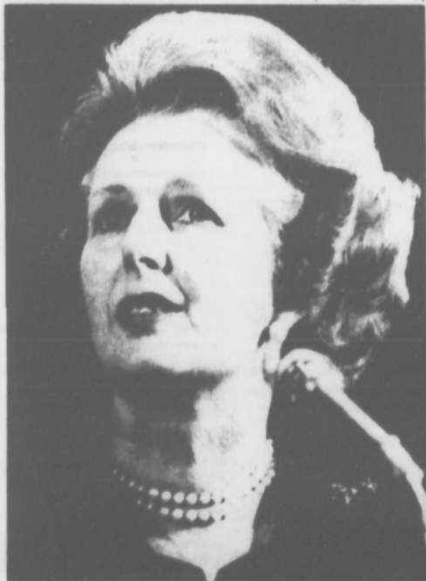
BY REFUSING TO IMPOSE SANCTIONS THATCHER'S GOVERNMENT HELPS TO PROP UP THE APARTHEID REGIME

VICTORY TO THE ANC AND THE BLACK SOUTH AFRICAN PEOPLE.