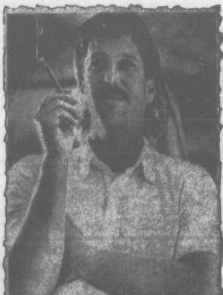
Happiness is a cigar called Hamlet.

Let's just hope that they're not going to use it as an excuse to start a war.