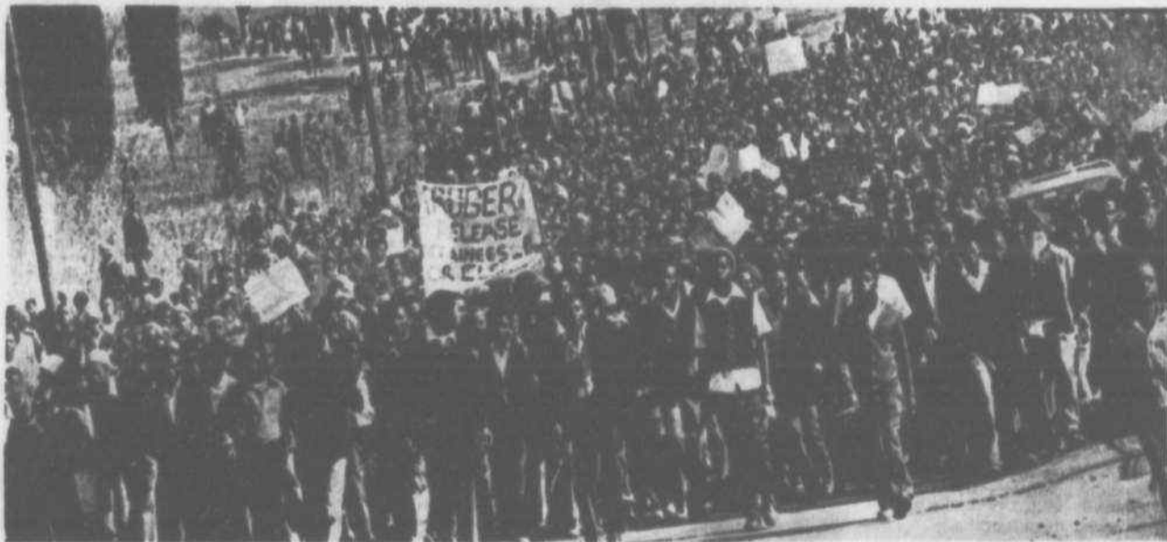
BLACK SOUTH AFRICAN PEOPLE ON THE MARCH TO FREEDOM

The fare is not cheap, being in the region of 50 pounds. However if you let us know that you are going soon enough, there is a good chance that we may be able to arrange it considerably cheaper. So don't delay write today to PO BOX 158, Hatfield, Herts