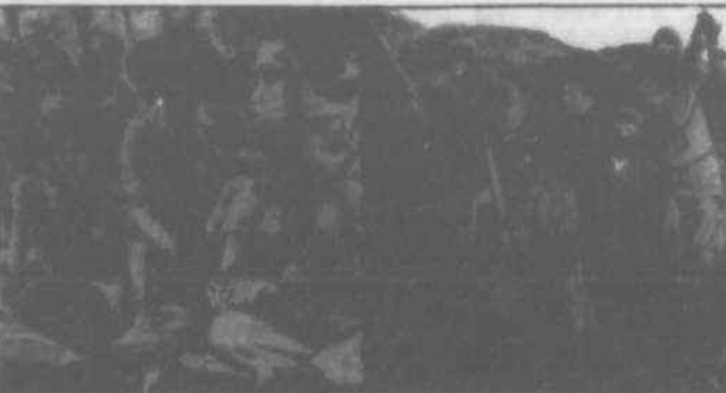
SANDANISTA AND IRA SOLDIERS BOTH REVOLUTIONARY FREEDOM FIGHTERS IN THE SAME TRADITION

This is not so in the case of Ireland. Even to do no more than just proclaim your support for the IRA/INLA in this country will earn you the hostility of neighbours and workmates etc. It may well lead to more drastic consequences such as police harassment and possible arrest.