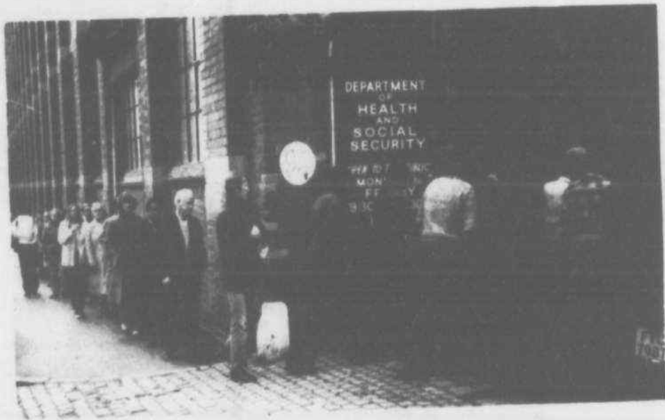
THE SQUABBLING INSIDE PARLIAMENT WILL HAVE LITTLE EFFECT ON THE LIVES OF THESE PEOPLE

But a government minister leaks a letter, the contents of which mean the square root of fuck-all to ninety nine percent of the population and suddenly it's nothing but crisis and the possible fall of the government.