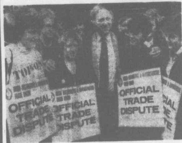
ARTHUR SCARGILL EXPRESSING THE SOLIDARITY OF THE NUM WITH THE DUNNES STRIKERS

Why we wonder does the British media ignore them. Because they are Irish or because they are women? Or is it both?