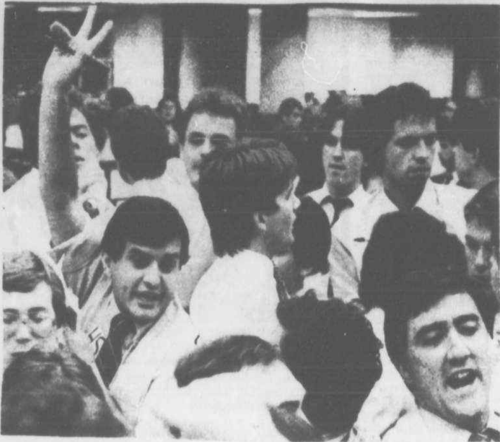
The money market, London