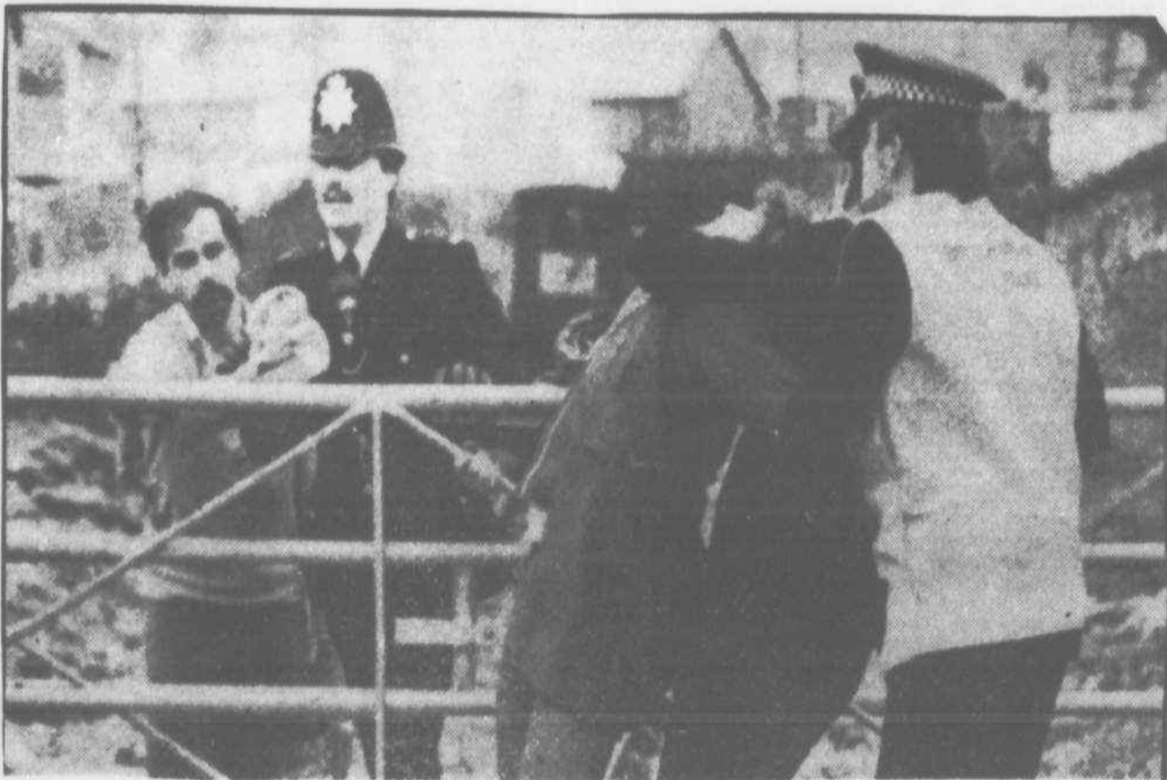
POLICE ARREST PICKETS (JUST FOR A CHANGE!)

Everybody knows that the miners are on strike. We are telling them nothing new when we talk about that. What a lot of people may not be quite so aware of however, is just how far reaching the consequences of the outcome of this strike could be. If the miners were to lose this battle it could well prove to be the signal for major and radical changes in the of our society. What do we mean when we say this?