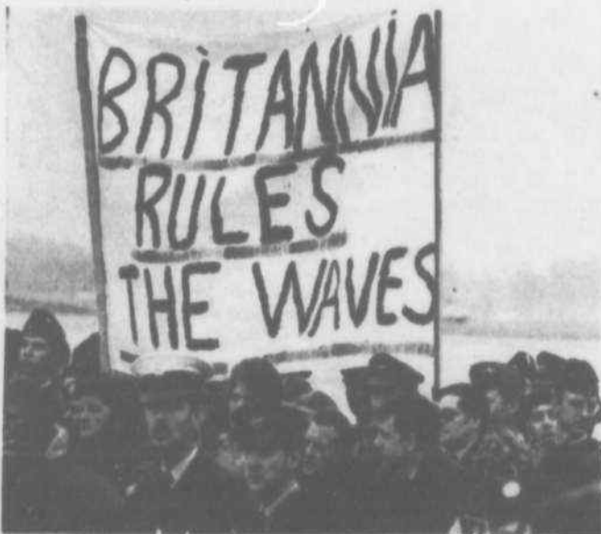
BRITISH BULLDOG OR BULLSHIT?