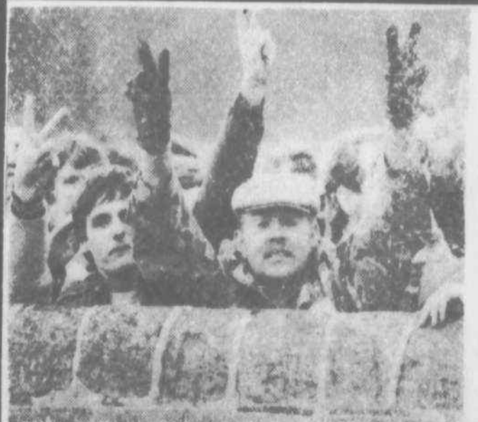
V FOR VICTORY

If you can't do that, then what the hell are you doing, reading this paper anyway?