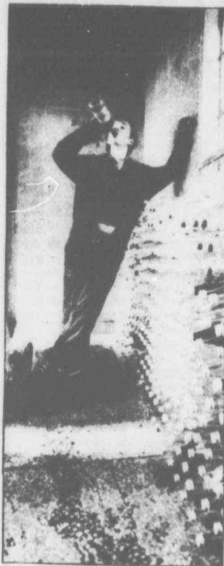
FREEDOM OF CHOICE

But as long as any individual may wish to gamble away every penny, to fill his or her body, with any drink or drug, or to sell their body for however much they want, they must have that freedom. Ultimately the absence of individual choice, is a far greater blight upon any society, than any amount of these things.