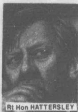
Rt Hon HATTERSLEY