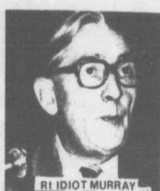
Rt IDIOT MURRAY