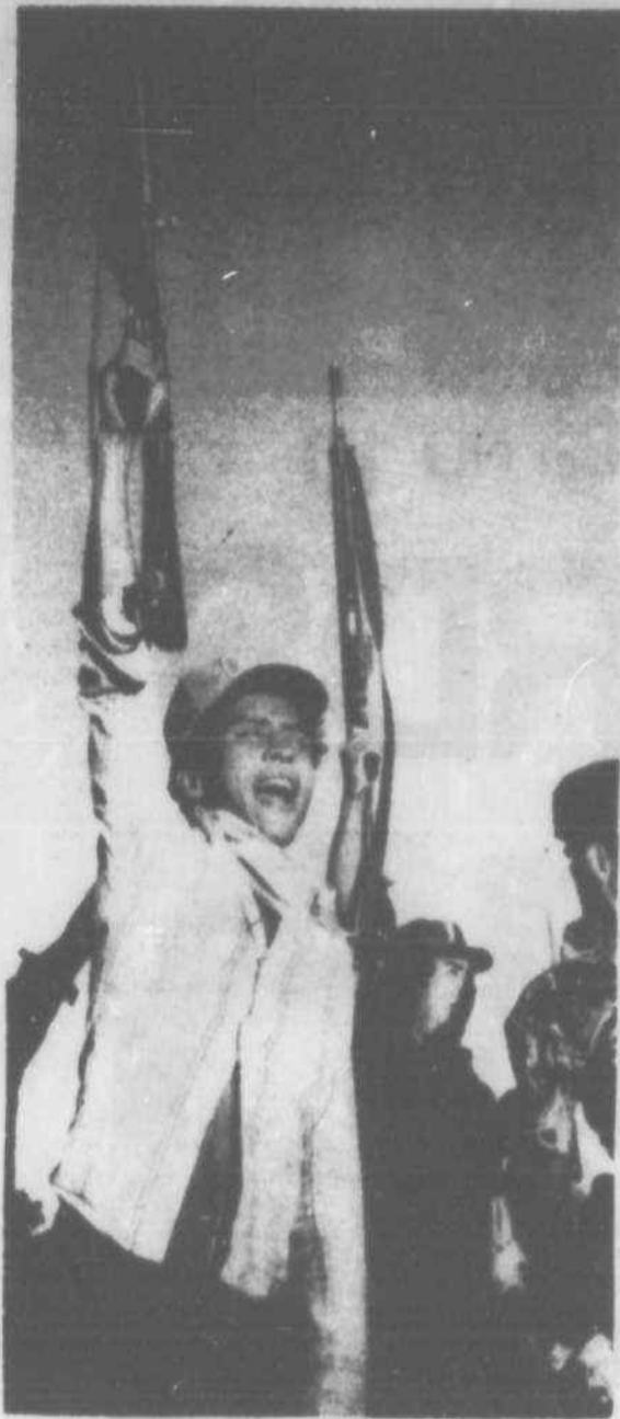
MAKING A STAND

The freedom fighters of the INLA, SANDINISTAS, IRA, SWAPO etc: carry on the legacy left by Spartacus. They are the gladiators of today. WHERE DO YOU STAND?