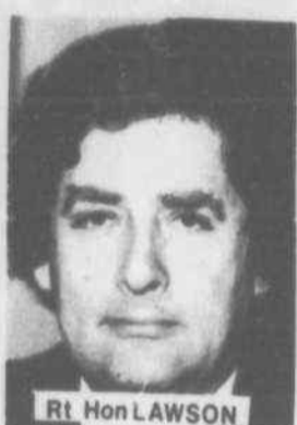
Rt Hon LAWSON