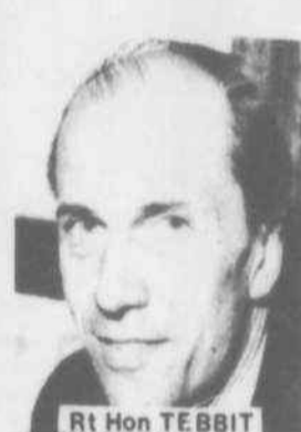
Rt Hon TEBBIT