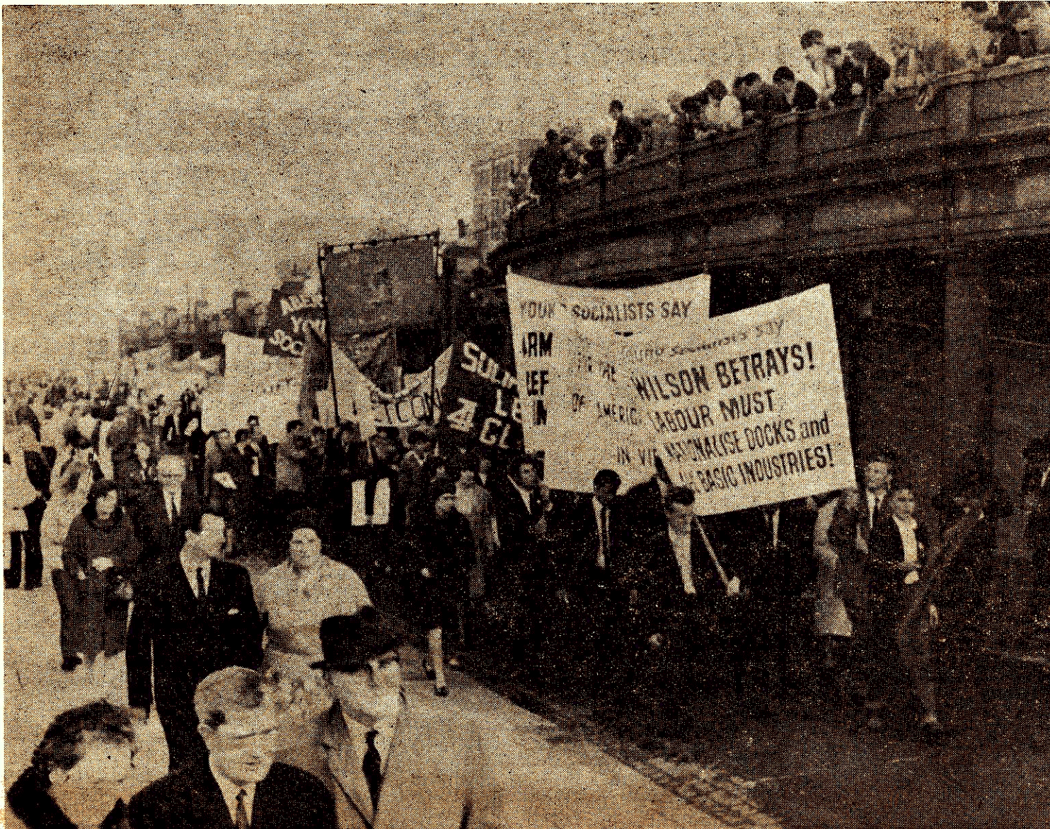
Crowds of holidaymakers watch as the demonstration begins on the Promenade, Blackpool.