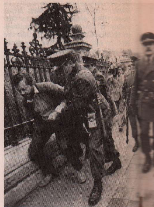
September 5, 1983. A student is arrested.

With the exception of the copper mining sector which is dominated by the powerful Confederation of Copper-workers (CTC), the trade union movement is dogged by this structural weakness. Nevertheless despite the current limitations trade unions and in particular those grouped around action like the CMT or in the framework of joint plenary assemblies of trade unionists such as the one which called the October 30 general strike last year, have played a key role in the lead up to protestas and in partial or general strikes. It has been initiatives from the trade unions that have sparked off the main days