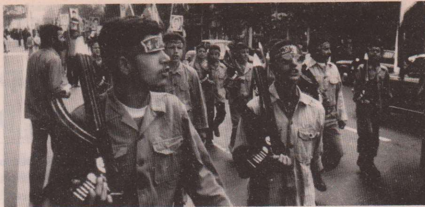
Parade of Basidjis (volunteers) in the Army of Knowledge

The minister of Labour has said that "when workers feel they own the factory, there would be no sense