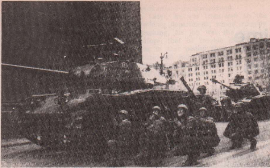
A tank in front of the presidential palace in Santiago — September 11 1973 (DR)

The economic and social crisis runs very deep but it is the element of political decomposition now affecting the regime which is the really destabilising factor in the situation. Since 1982-1983 the rule of the dictatorship has become extremely unstable. It was at this time that the mass movement erupted onto the political scene. (4) Pinochet reacted to this in August 1983 by appointing Onofre Jarpa to head the government and the Ministry of the Interior. Jarpa was the ex-president of the extreme right organisation, the National Party, which had supported the 1973 coup d'etat. The floodgates were opened and the regime appeared to be vacillating. But in reality by pretending to share power with Jarpa, and to be in dialogue with the bourgeois opposition, Pinochet was trying to win time. He was trying to paralyse the bourgeois parties in a pretence at negotiation and also wear out the masses through a series of mobilisations leading nowhere.