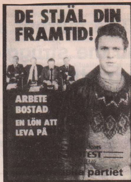
'A job, a place to live and a living wage'

"With the contacts we have made, we expect to be able to build branches in ten more cities. We are planning to go into neighborhoods where we got a high vote with paper sales, leaflets, and local initiatives. And in Stockholm, for example, we are aiming to strengthen our public presence through our bookstore and by holding open houses where people can come and meet representatives of the party.