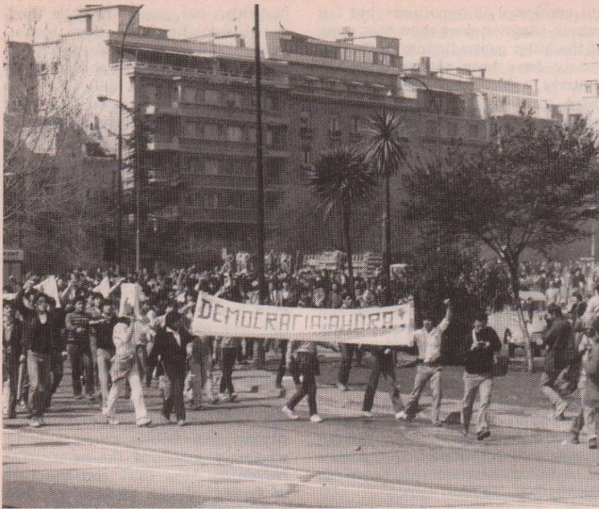
'Democracy now' — demonstrators take to the streets of Santiago.

to envisage continuing military repression of the type of September 1973, all sorts of other variants are possible. These could include the maintenance in power of Pinochet until 1989 combined with concessions to the bourgeois opposition; a 'coup d'etat within the coup d'etat' by a section of the military; a greater or lesser degree of 'opening up' of the regime; or lastly, an 'opening up' based on mass popular explosion. But rather than make predictions the most important thing is to indicate the main tactical and strategic tasks for the Chilean revolution.