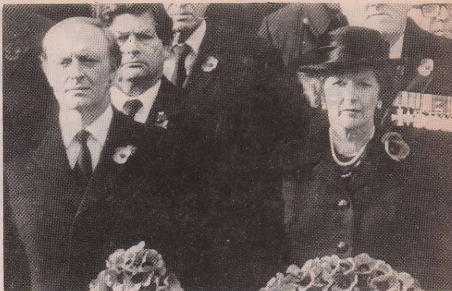
Neil Kinnock and Margaret Thatcher on Remembrance Day

This Kinnock left, in particular around Tribune and the LCC, is now the spearhead of his efforts to build up a base of support in the constituency parties and to undermine and coopt the campaigns around local government, CND, and women's representation within the party. This