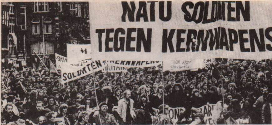
'NATO soldiers against nuclear weapons' (DR)

missile system in space. The Soviet Union is willing to permit research but not tests. Deployment is to be banned. To this end it proposes that half of the offensive nuclear arms on both sides should be destroyed. But there is no binding link between the two.