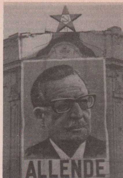
Poster outside PCC headquarters

Today, it is the Communist Party which has most successfully rebuilt itself. The PCC is dominant amongst the youth, in the communities and in certain trade unions. It is the party most able to mobilise people within the country and especially amongst the youth, even if it has not re-established organic links with the working class as strong as were achieved in the past. This can be explained as much by objective reasons, including the general weakening of the structures of the workers movement, as by subjective reasons rooted in the class collaborationism which, in the current political conditions in Chile, limits the structuring of the Party and its periphery organisations. This is shown clearly in the experience of the MDP (People's Democratic Movement): in order to provide a counter-weight to the Democratic Alliance, the PCC launched the MDP in 1983. It was made up of the PCC, the PS-Almeyda and the MIR (Movement of the Revolutionary Left). Despite the programmatic limitations and its platform and statements representing class collaborationist positions, the MDP quickly became a pole of attraction for the popular masses which first challenged and later took away from the Democratic Alliance the leadership of the most recent protestas and finally of the October 1984 general strike. However, the PCC deliberately chose not to set up rank and file committees of the MDP. This is a