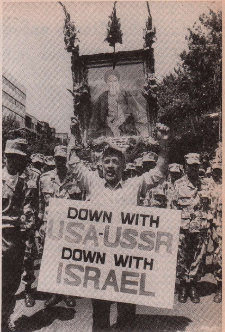
Demonstration in Tehran June 26, 1984 — the 'Day of God'

On the other hand, the law gives its blessing to those who "decide to enter into a mozareeh contract" (i.e., the crop-sharing system of the pre-land-reform era that was abolished under the shah). This points to the revival of the ancient exploitative practices, including forcing poor