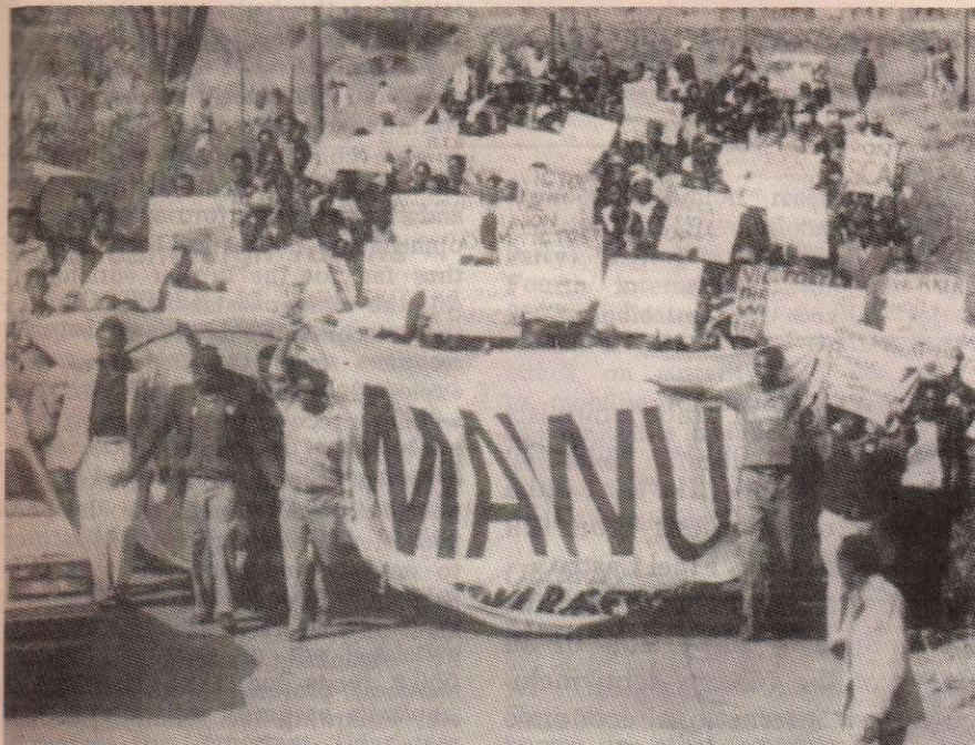
Demonstration by metalworkers union

Finally the leaderships of certain of the principal unions act independently in the mobilisations by following their own perspectives and appear as political forces in their own right in the present political diversity.