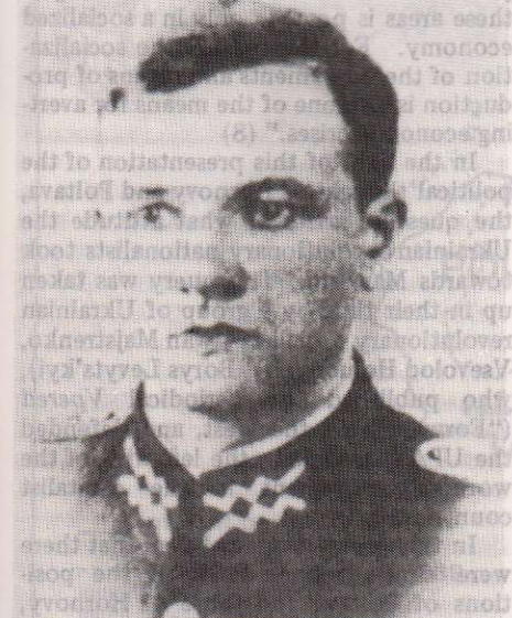
Vasyl Mizerny, commander of the 'Lemko' section of the UPA, killed in combat in the Soviet Ukraine (D.R.)

In the Kremlin as in Warsaw, the thought of what might happen if an alliance were to come about between the Polish and Ukrainian social movements stirs panic. So, trying to fan the flames of national hatred between Poles and Ukrainians, of which the chauvinistic anti-Ukrainian campaign in Poland is an aspect, is a typical preventive operation.