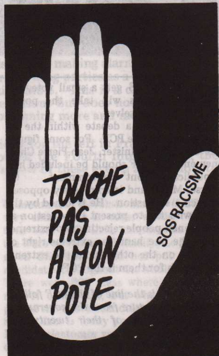
Hands off my mate

Q: Has the campaign in defence of the Kanaks in New Caledonia found an echo in this movement?