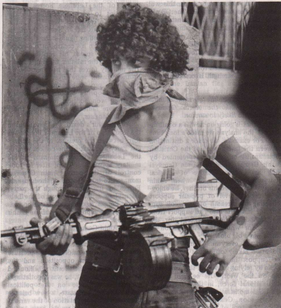
A young fighter of the Shiite militia

Since the CP are very much linked to the Syrians, Moscow's main ally in the region, after this compromise, the CP could not continue to appear to be the radical force. The continuing radicalisation tended to bypass both the CP and Amal. Nonetheless, it cannot be said that there has been a fundamental shift in the relationship of forces, in the sense that the Hezbollah is stronger now than the CP. It is not, but it is growing, and it has an advantage that the CP does not, that is its closeness to Amal. Both stand on the same Shiite ground. ■