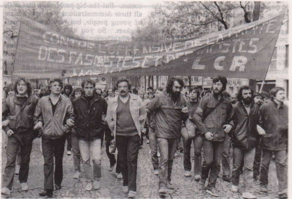
LCR Demonstration against the right

So far they have not succeeded with this campaign. But some significant bourgeois figures, ex-ministers like Olivier Stirn, have declared themselves ready to support such a project. But it won't happen before 1986 because the main leaders of the bourgeois parties want to pay back Mitterrand for his victory in 1981. They might respond after that on the condition that the PS gets a high score, say 30%. Under those conditions the PS would be useful for the bourgeoisie.