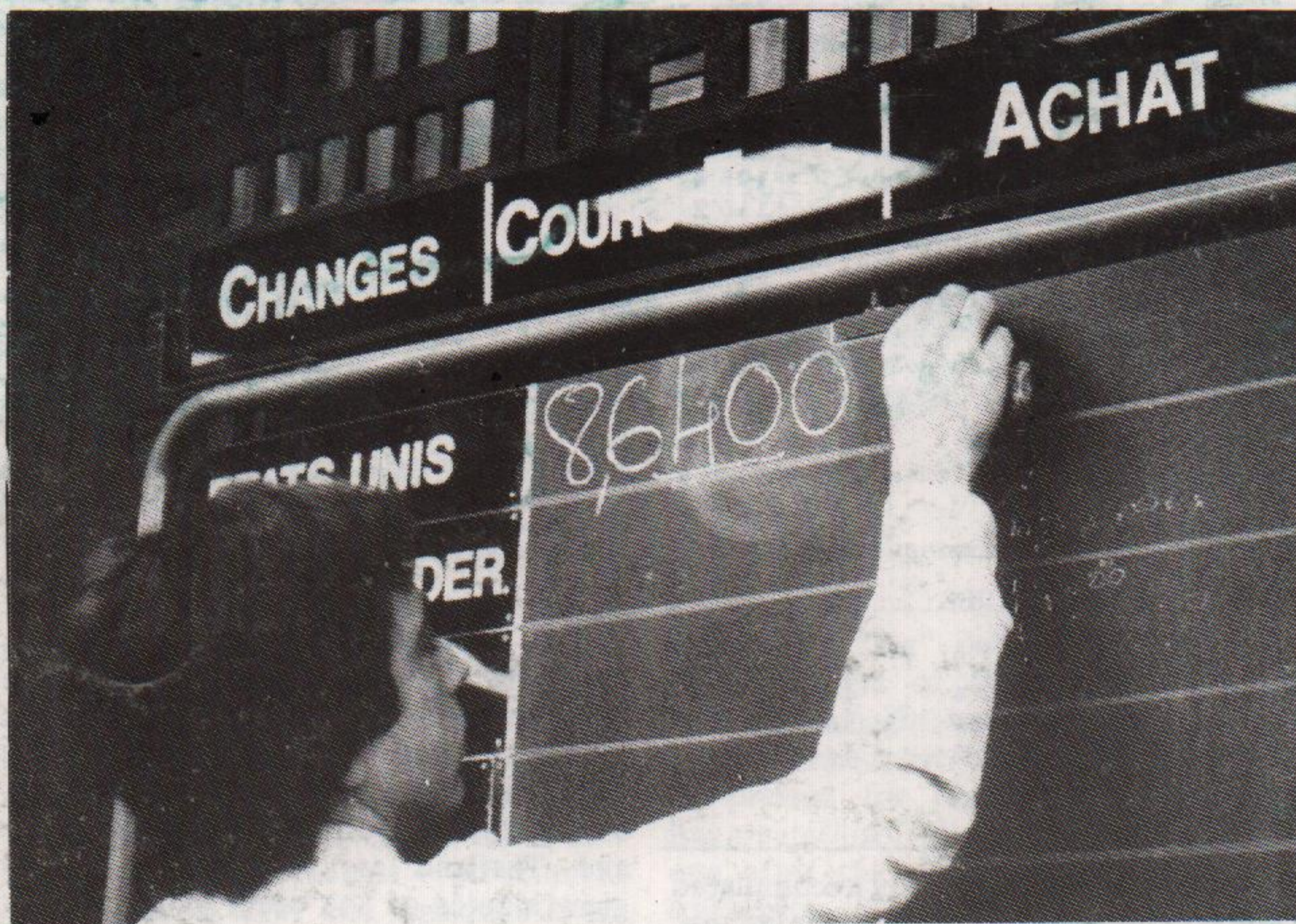
The dollar goes up more every day (DR)

duction going. It aims to produce 1.2 million vehicles in 1991, of which half are to be exported. But if the world market for automobiles continues to stagnate relatively, these 600,000 cars exported by South Korea will replace 600,000 cars previously sold by Japanese, American or West European firms. Moreover, the production of these 600,000 cars will generate only half as much "final" revenues [wages] as the 600,000 cars they will replace. This, therefore, means a shrinking and not an increase in overall world demand, even if the increased production and the relative expansion of the South Korean internal accompanying it actually take place, which is in fact quite problematic.