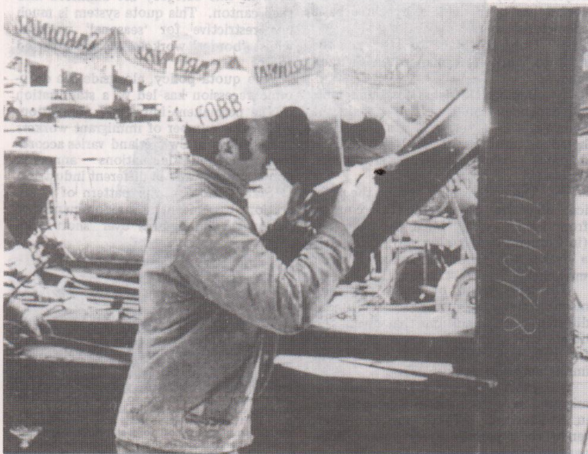
One of the 'foreigners' at work