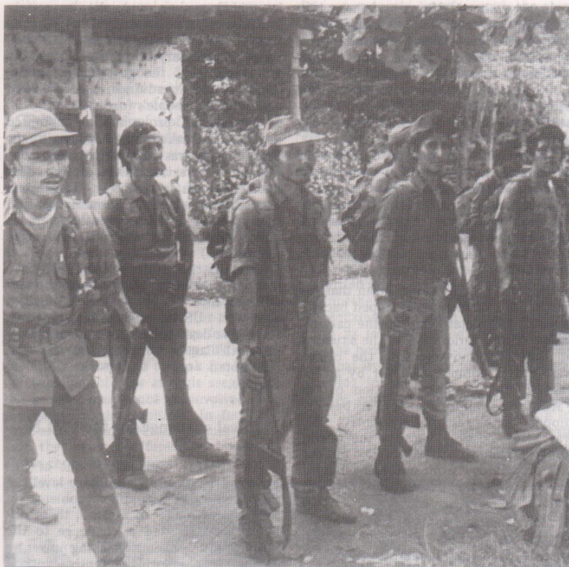
Salvadoran guerrillas occupying a village (DR)

tion of strength within the mass movement.