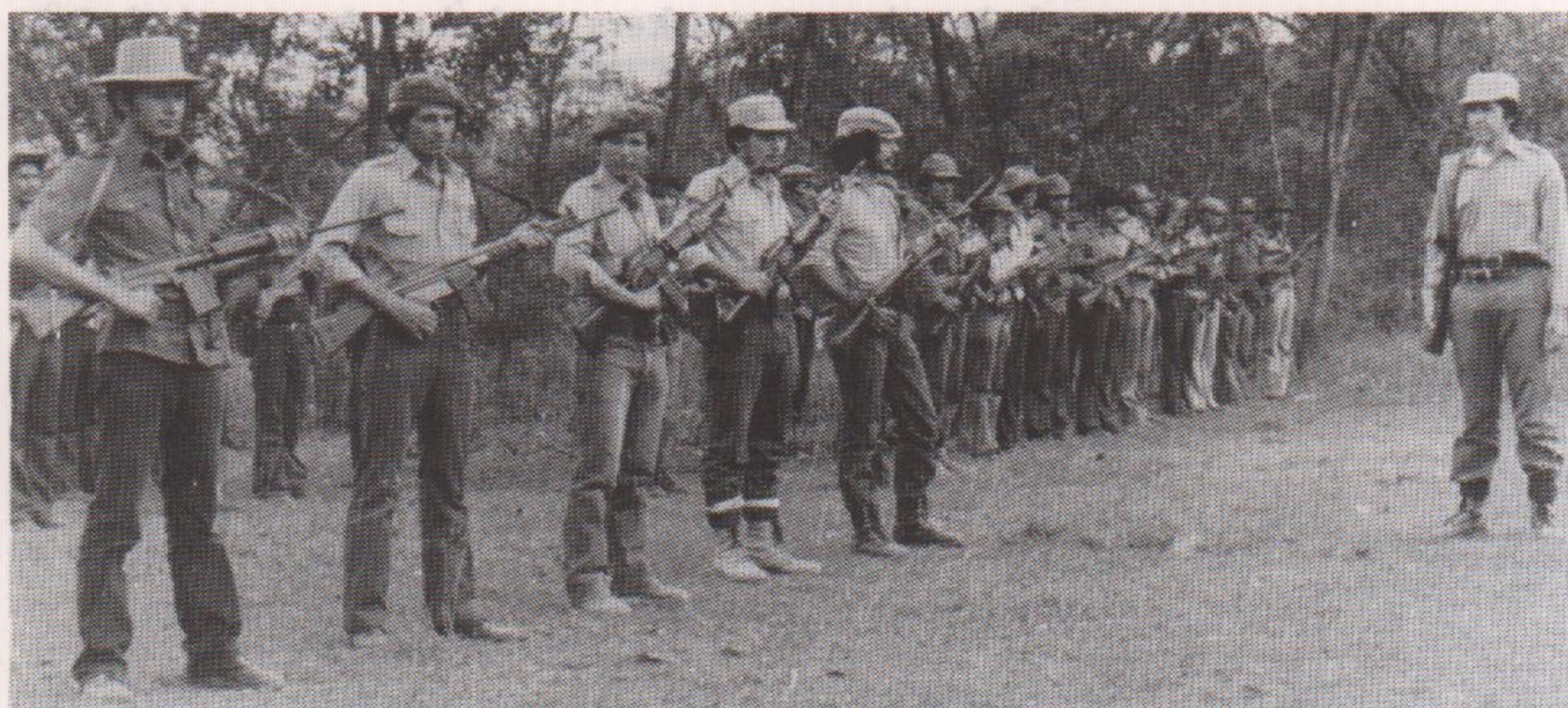
The military command of the FMLN eastern front (DR)

said in a document written early in 1984: "The tempo and phasing of the US intervention plan depend on domestic American political factors, strategic factors on the world scale, and the military advance itself that the FMLN is able to achieve. If the FMLN's military plans deepen the moral crisis in the army, the US schemes will be made vastly more difficult to carry out. Because this would remove the human agent necessary for putting them into practice. The US would thus have to either redefine its position toward the FMLN-FDR or intervene militarily with its own troops at a politically inopportune time." (18)