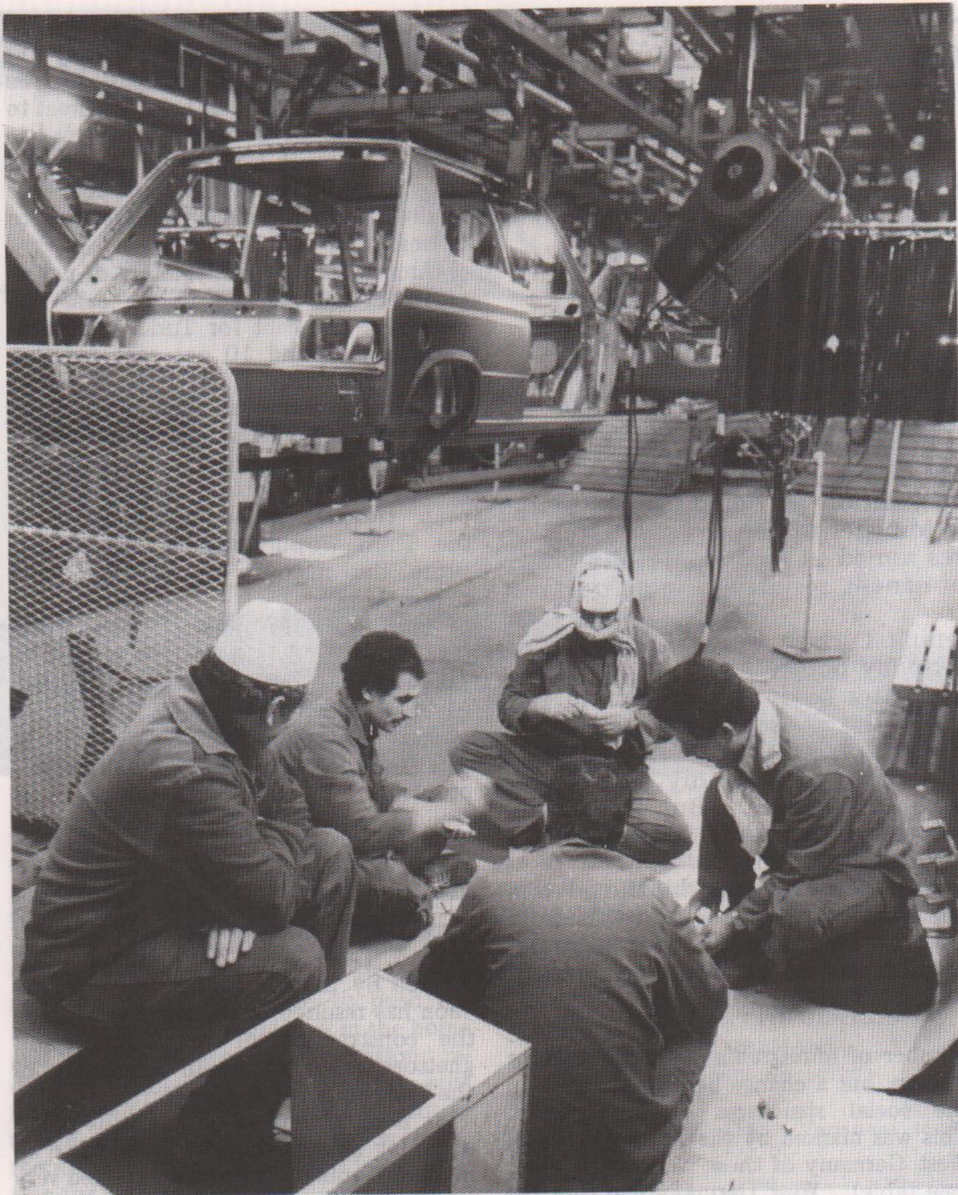
Immigrant workers on strike in the Talbot-Poissy factory

But the employers had not had their last word. In the atmosphere of racism that followed the municipal election campaign in March 1983, the redundancies projected in the car industry were specially designed to break down this new base of workers opposition. The example of Talbot, where the delegates from the CGT and the militants of the CFDT were top of the list of redundancies, is only one illustration of the employers objectives.