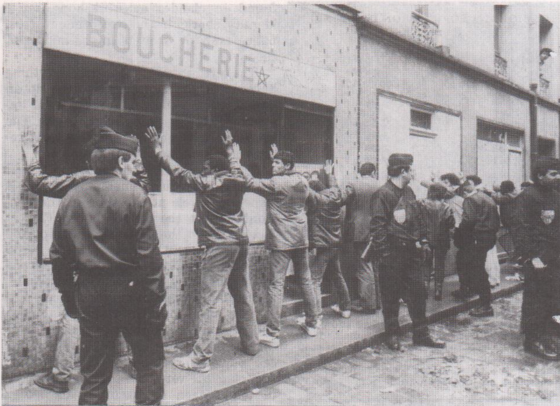
Mitterrand orders a police raid of an immigrant neighbourhood (DR)