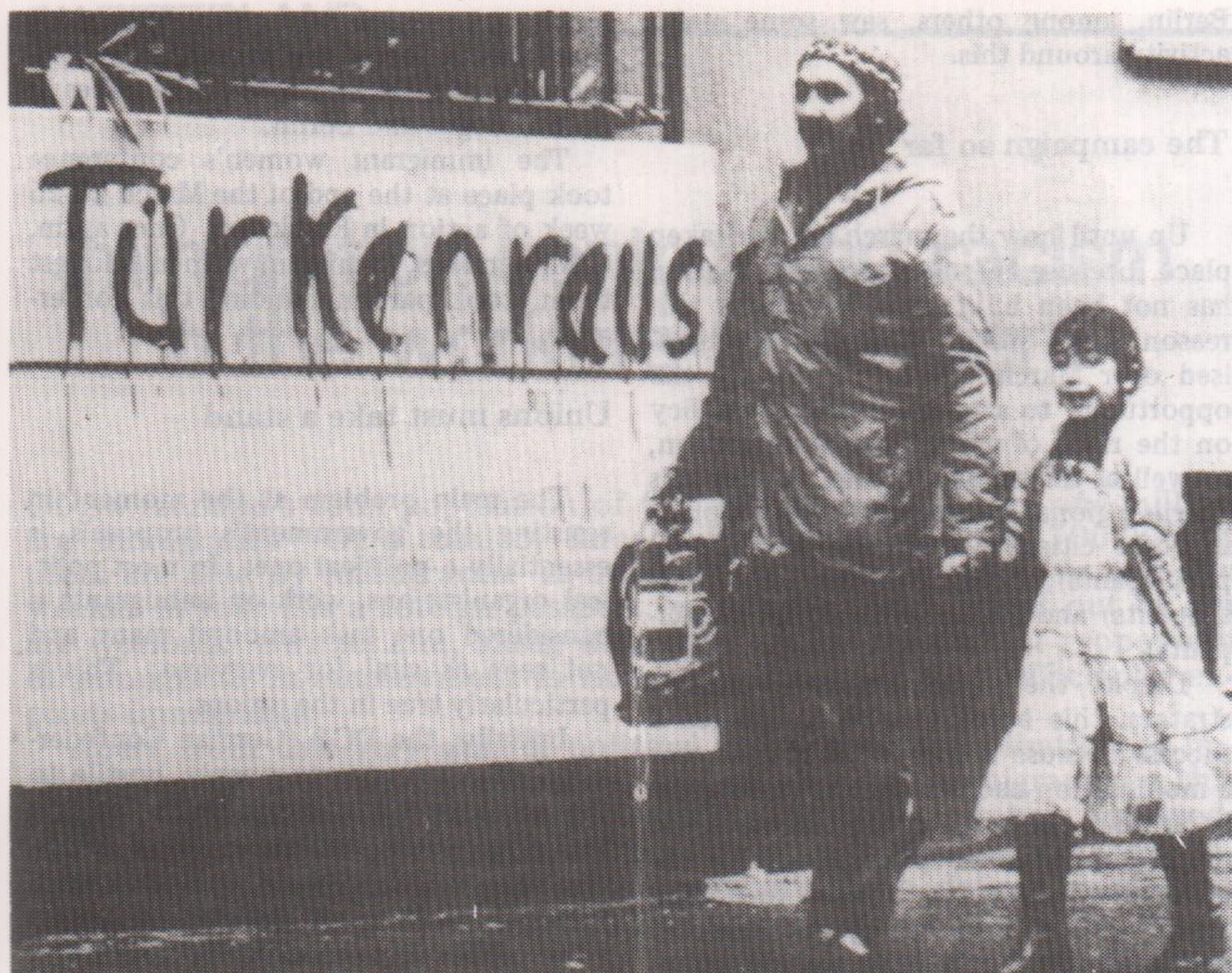
'Turks out!' Racist graffiti in West Germany

time being, unthinkable. Therefore, the bourgeois government intends to prepare for this confrontation by attacking the working class at its weak points. In fact, all the measures which they have taken go in this direction — attacks on abortion rights; campaigns to push the idea that women should stay in the home and to oppose women's liberation; reduction of unemployment benefits; cuts in the welfare sector; attacks on protective legislation covering young workers; reduction in pensions. All this in preparation for a direct confrontation.