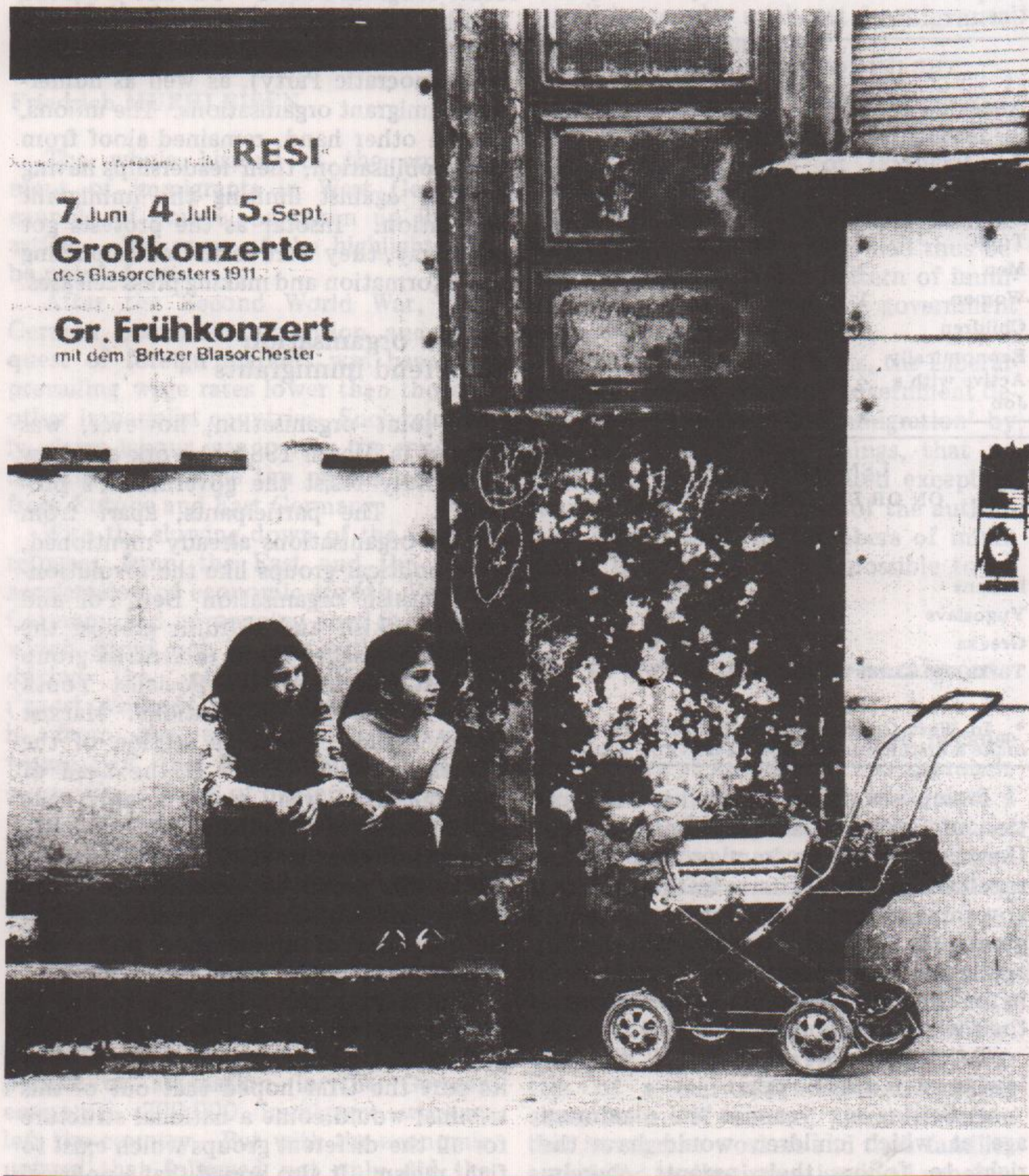
Young second generation immigrants (DR)

Today, the anti-immigrant proposals are gathering dust in the Ministry and the coalition government remain divided on the issue. To stop the bill it is essential to mount a campaign against racism in general and the unions have to be a driving force in it. ■