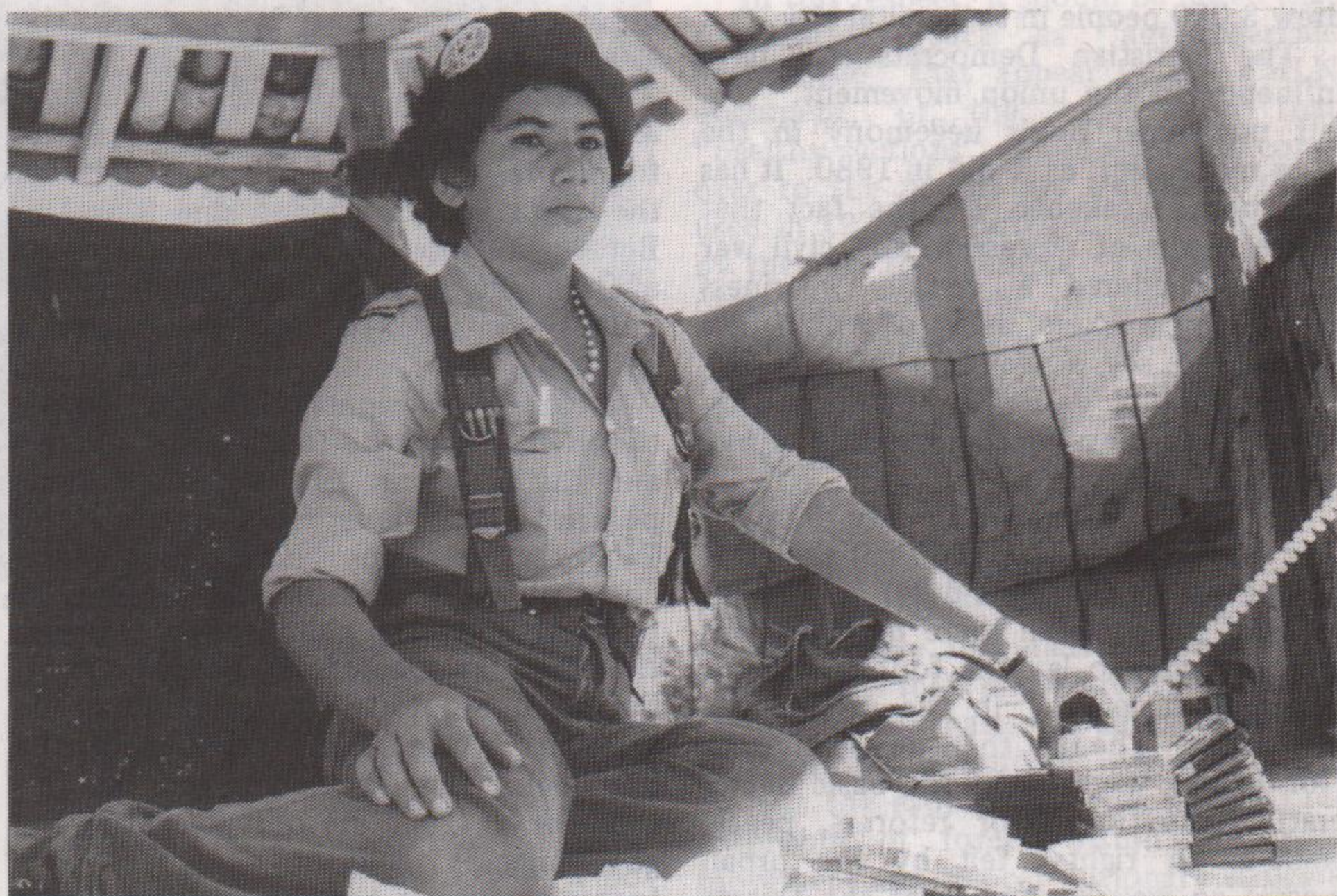
Even in the dictatorship's prisons the FMLN radio is heard

Moreover, a group called the "Clara Elisabeth Ramirez Front" has appeared,