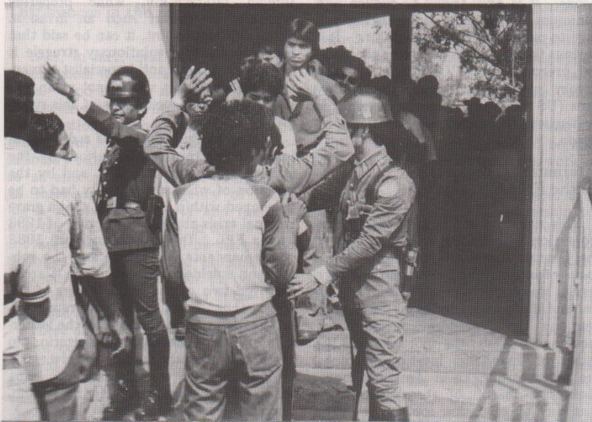
San Salvador, March 28, 1982: elections under military surveillance