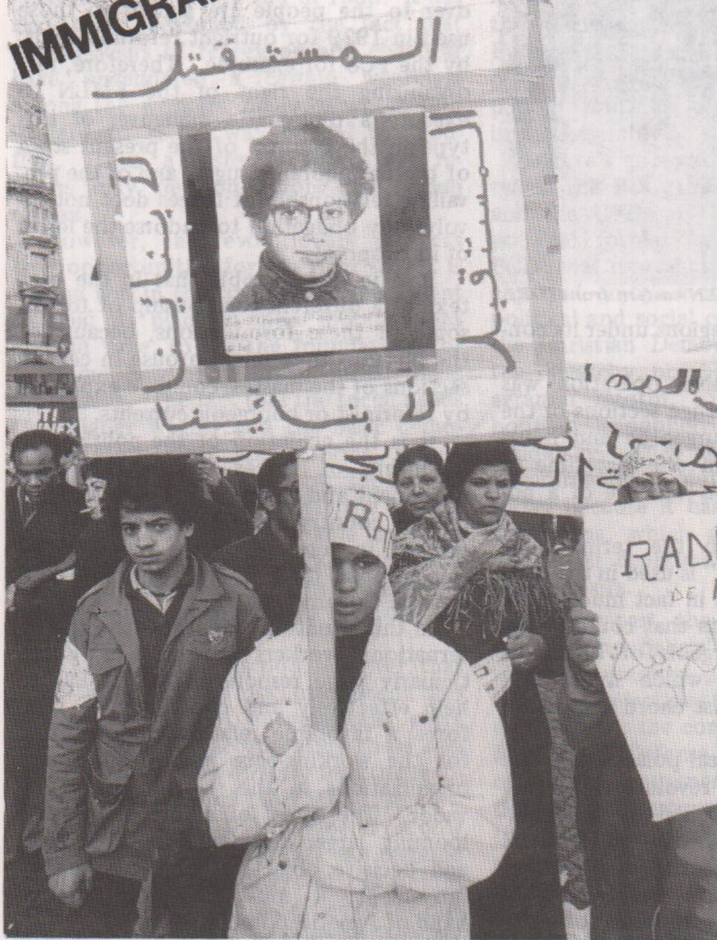
The young victim of a racist attack is remembered (DR)