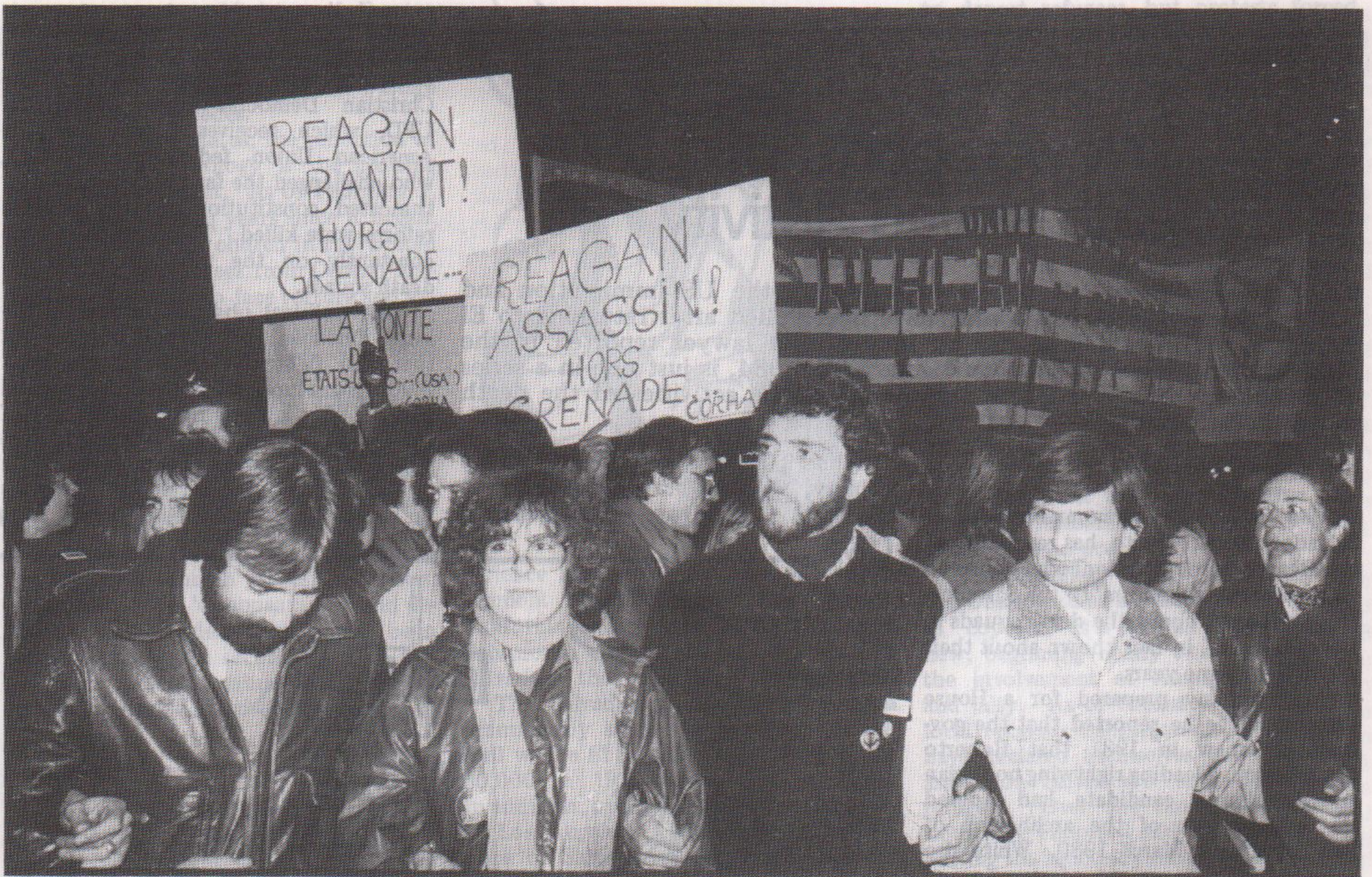
Paris protest against invasion of Grenada (DR)

is necessary. There have been no incidents of any sort over the last several months. The military forces are acting as occupation forces. They are totally unnecessary for internal security or anything like that. The function is simply to intimidate.