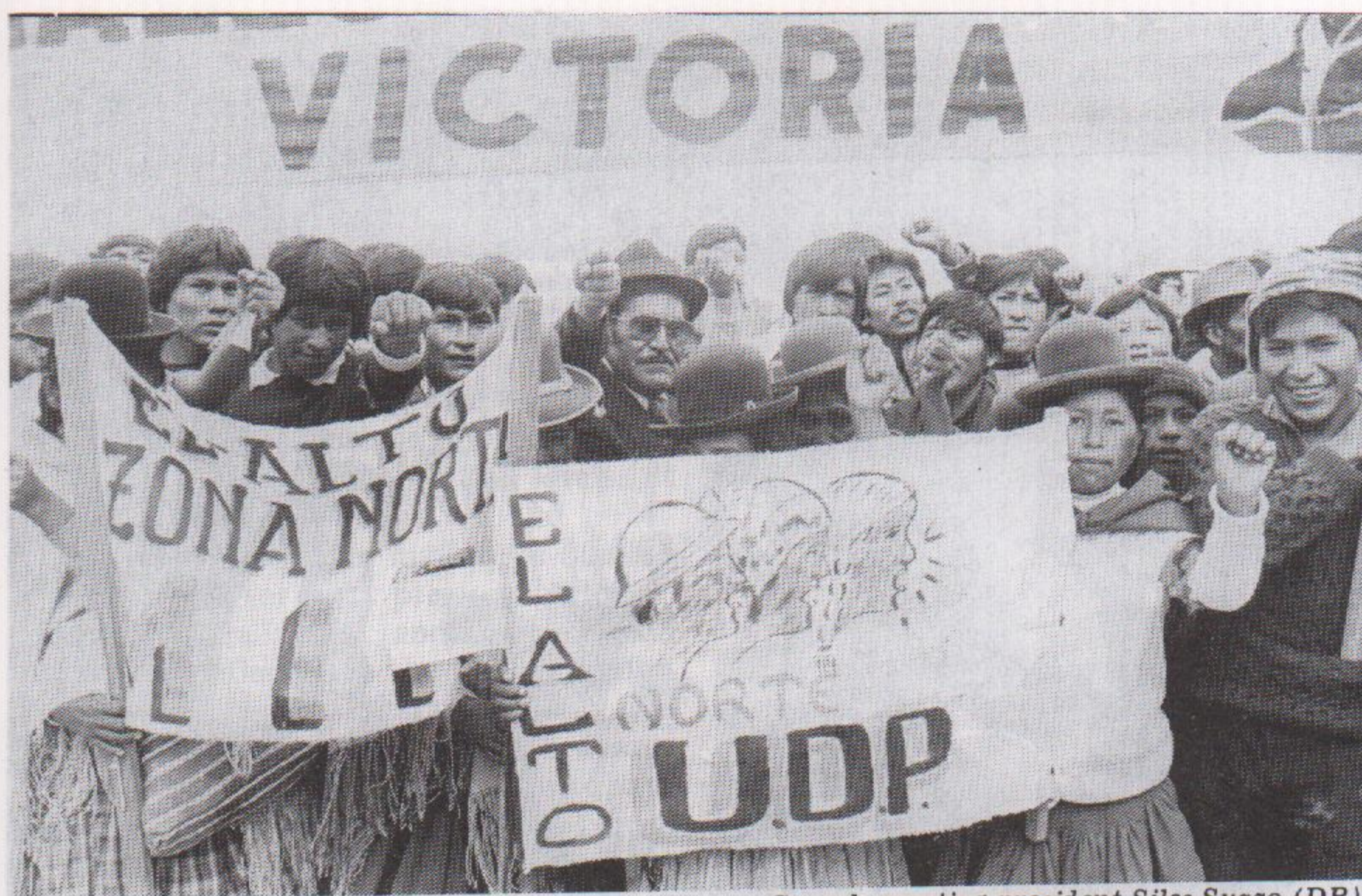
Crowds greeting president Siles Suazo (DR)

All these factors tend to break down the fabric of the economy. And this has repercussions not only on the standard of living of the masses but at the same time produces wrenching conflicts within the ruling classes. For example, clashes are multiplying between the private sector and the state sector, between the representatives of industry and agribusiness, between some entrepreneurs and the banks, and even within these various sectors.