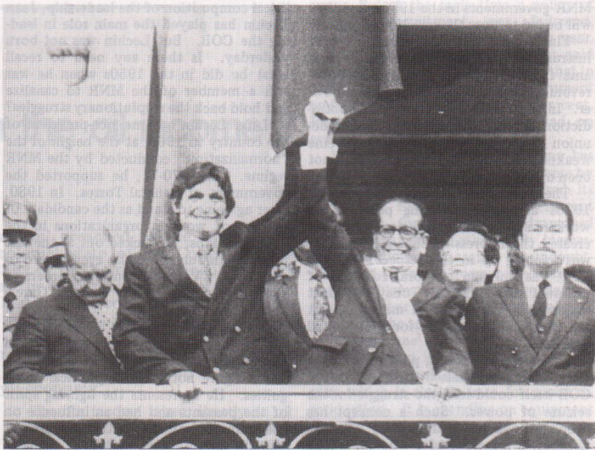
Announcing the 1982 election results to the people

The second wrong conception is far more dangerous, inasmuch as those who