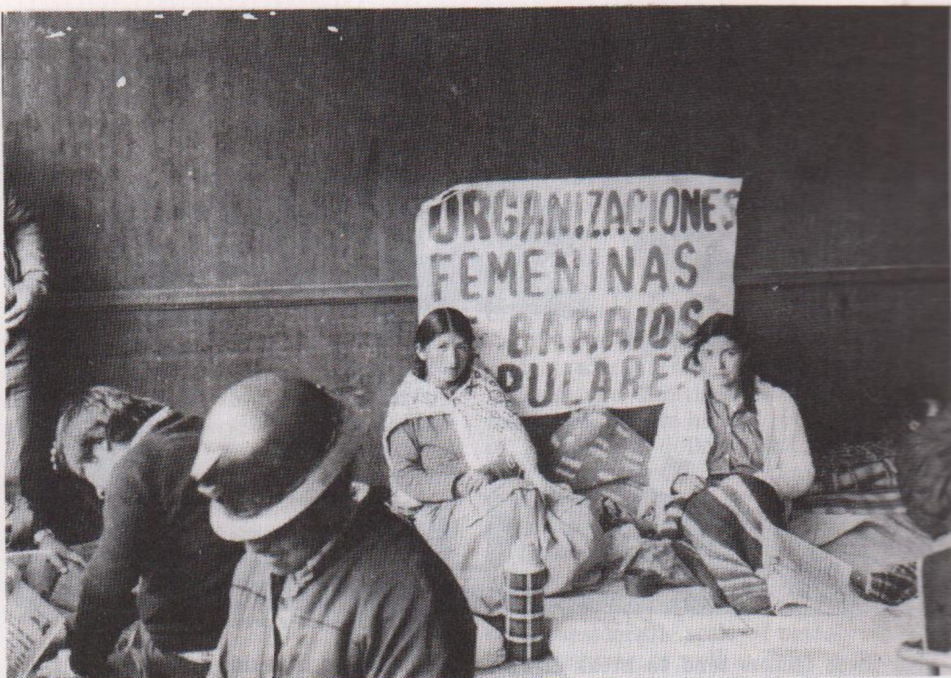
Women's organisations joined the hunger strike

In August, the COB leadership presented a program of economic measures. They included the following: a decisive voice for the workers in the government through their union confederation; workers-majority comanagement in state and