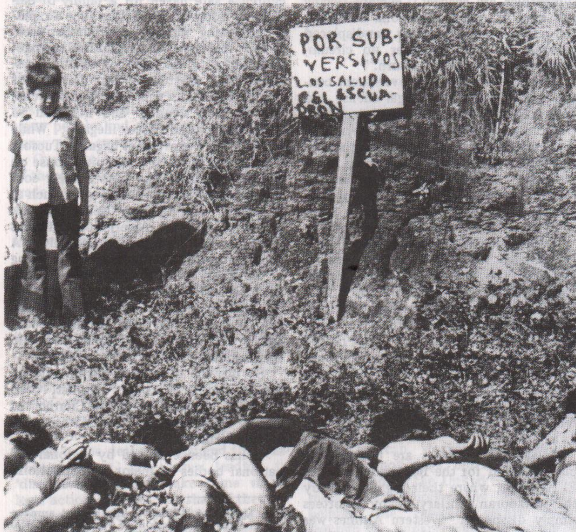
Victims of the death squads

This pales next to the massive June 12 demonstration. While all polls show an overwhelming majority of Americans oppose US military intervention in Central America, the polls have not been translated into numbers in the streets. The million people that came out June 12 have not been organized to join the anti-intervention movement. ■