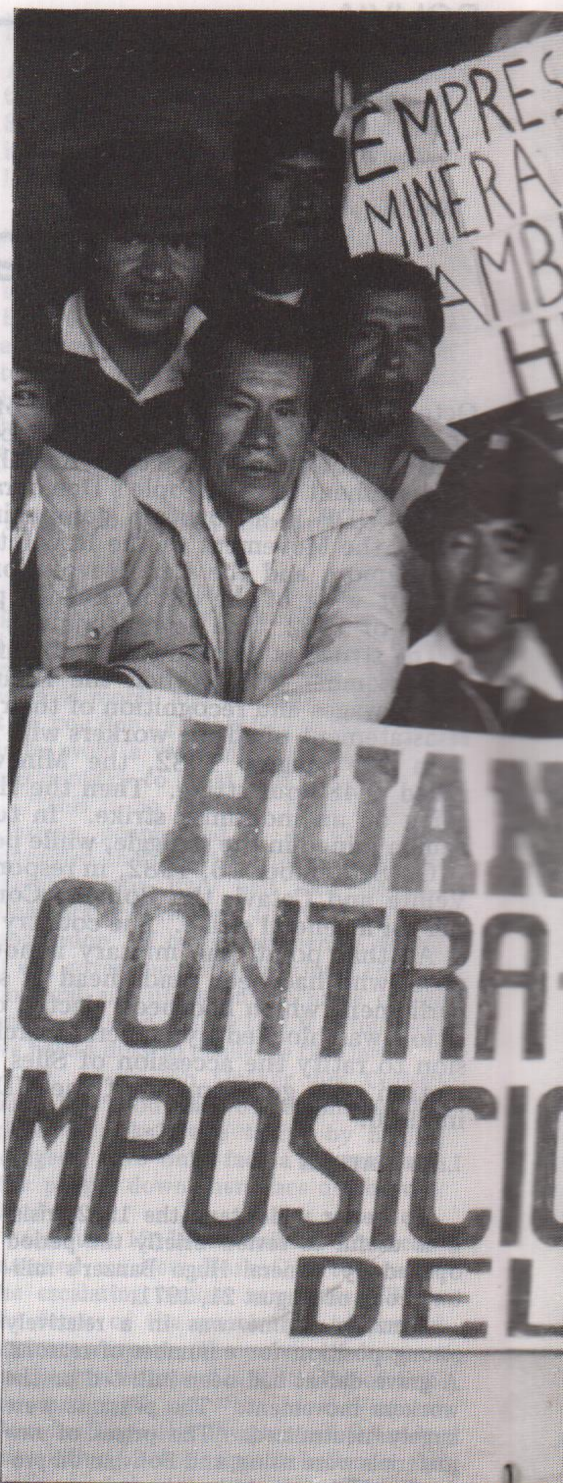
Huanuni miners — in the vanguard of Bolivian working class

This was the opening gun of a new process of radicalization that spread in the following months. Its most significant expressions were the following: A wave of struggles developed, involving almost all categories of workers, marked by