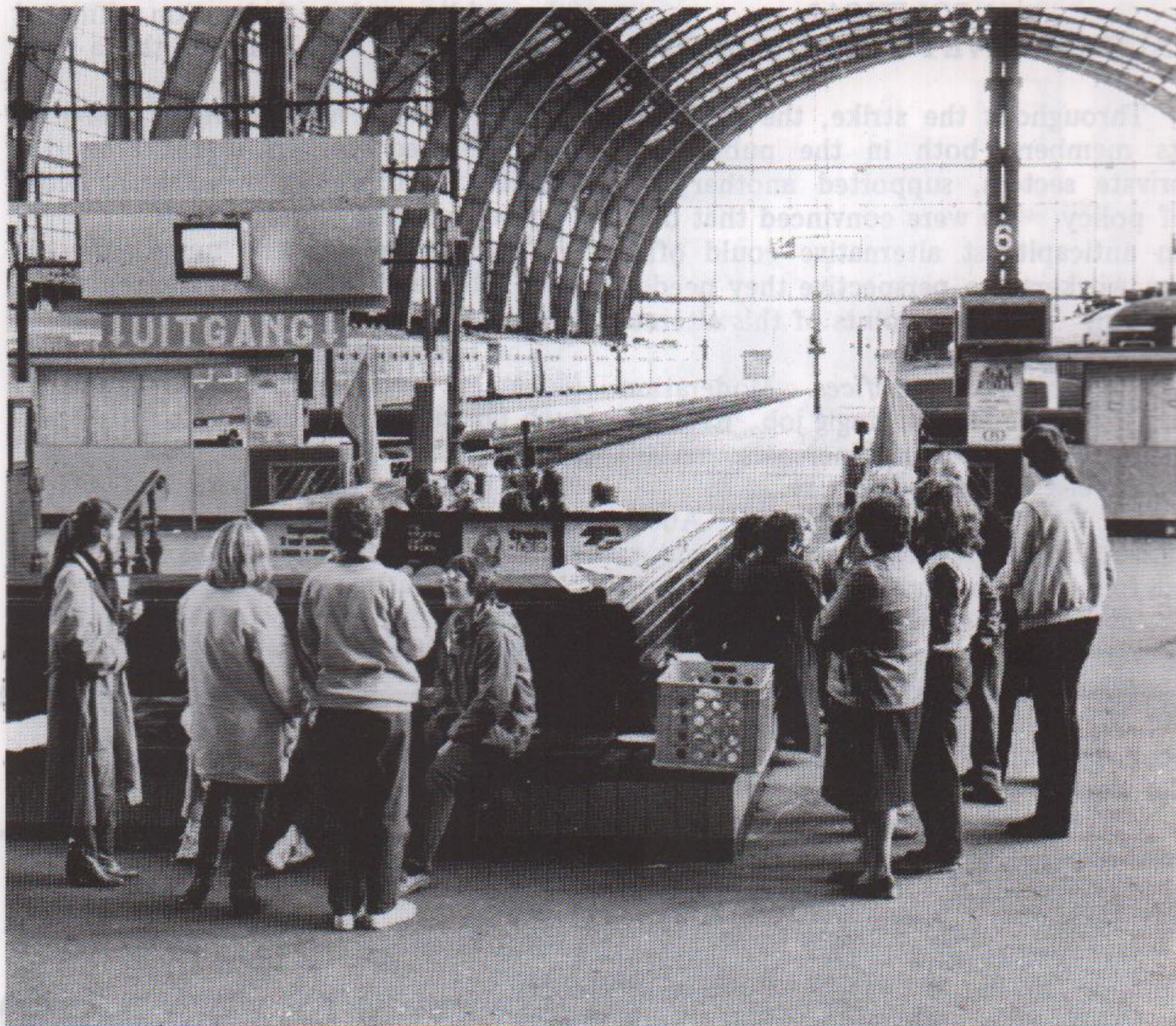
Picket line at a Belgian railway station (DR)

Even if such a mobilization makes the government and the bosses a bit more cautious, they are not likely to depart