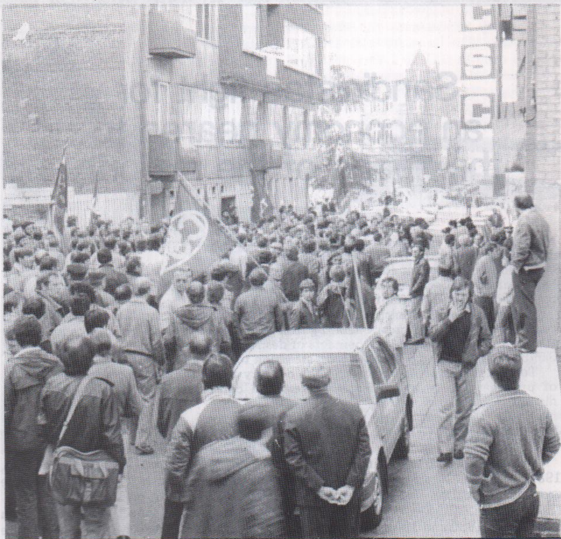
Unionists gather outside Catholic union headquarters, calling on them to join strike

Such demands made it possible to give a concrete form to our perspective of unity in struggle of the working class, between the private and public sectors, between Flemish and Walloon, between FGTB and CSC.