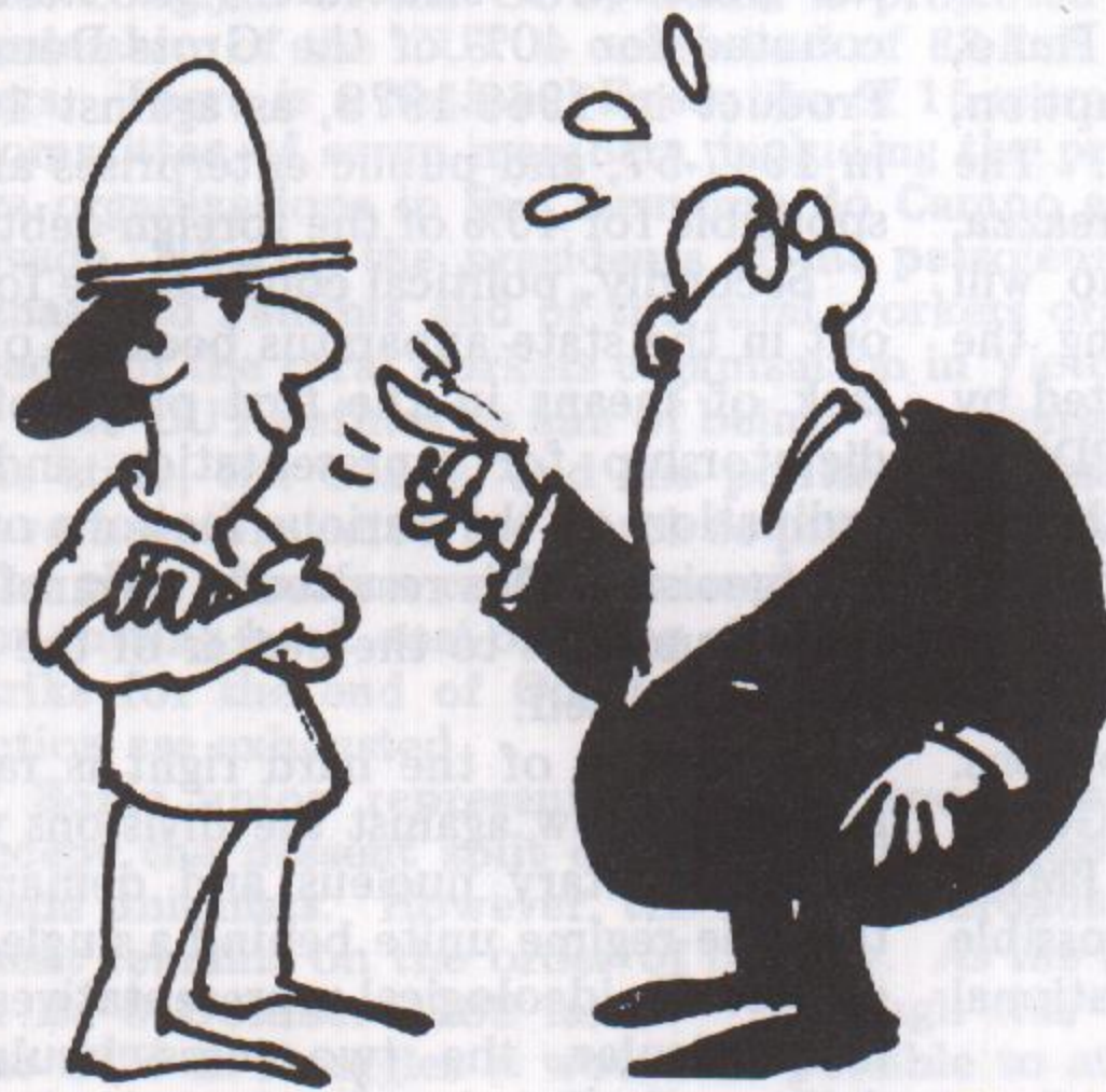
'Now we have a United Confederation of Workers (CUT)'