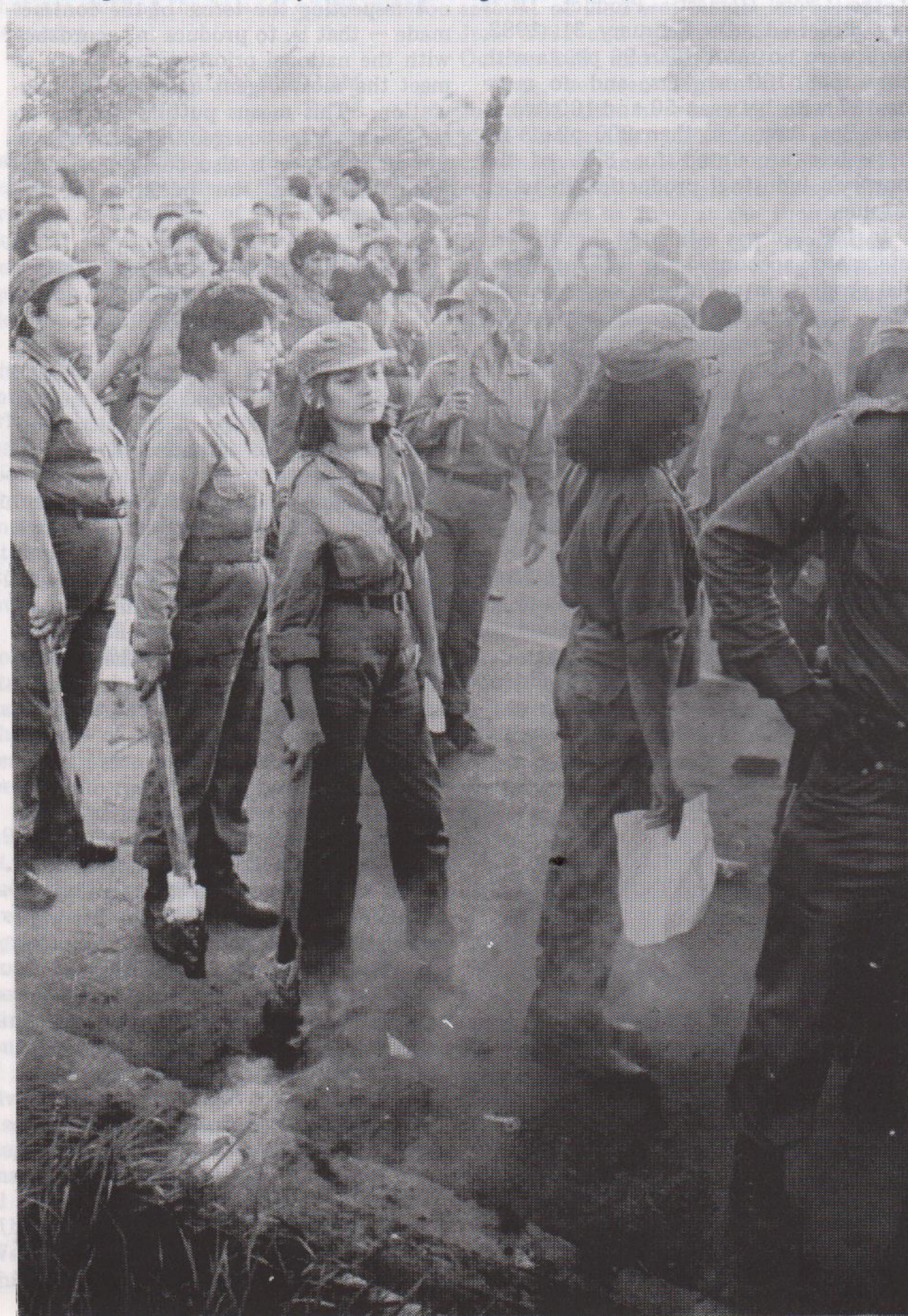
Celebrating the sixth anniversary of the women's organisations (DR)

The example of steadfastness that the Nicaraguan revolution gives every day cannot help but inspire the international movement in defense of the Sandinista revolution to show a similar determination. ■