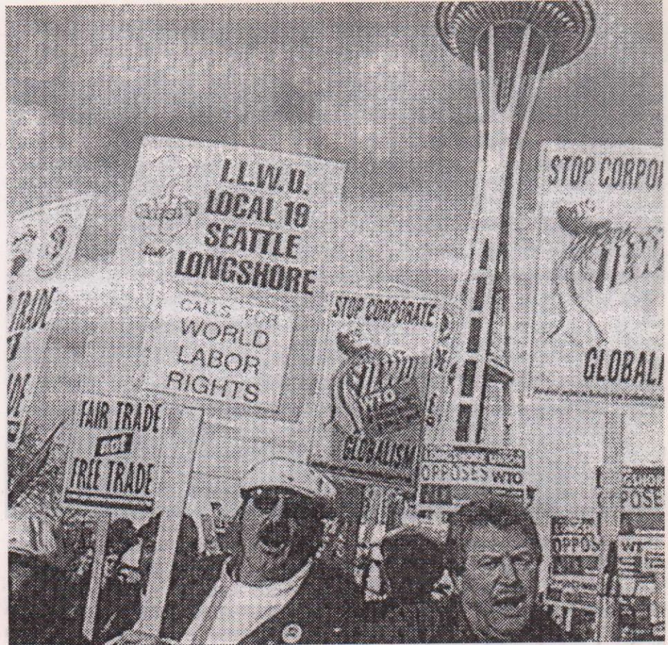
The A16 mobilization in Washington continued the tradition of last year’s demonstrations in Seattle

Aside from the fact that no one relishes going into captivity, U.S. social conditions, relative to Europe, create a special barrier (to give some examples: no legal right to employment security; denial of unemployment insurance — in many states — if discharged due to arrest; no public or affordable childcare; little or no public trans-