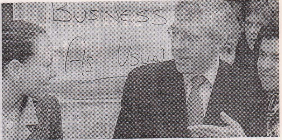
British Home Secretary Jack Straw

To the relief of international human rights lawyers and activists, a majority in the House of Lords rejected this view and instead took a legal-reformist or liberal stance. Lord Steyn noted that: "The development of international law since the