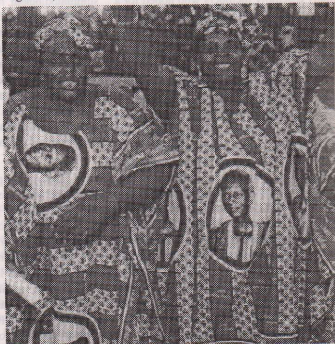
Supporters of defeated President Diouf

Why did the left not present an independent candidature? For the parties of the Senegalese left, what was at stake in these elections was putting an end to 40 years of the PS party-state and unfreezing the existing system to throw up the bases of a gen-