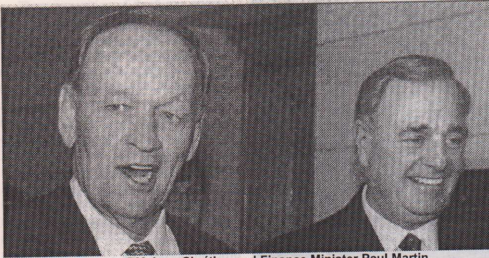
Canadian PM Jean Chrétien and Finance Minister Paul Martin

political community generally (the Meech Lake and Charlottetown Accords) failed to right the wrongs of the 1982 unilateral repatriation, the Quebec Tory MPs broke away to form the Bloc Québécois. Coupled with the rise of Reform in the West, this defection in Quebec led the federal Tories to their worst defeat ever — in the 1993 elections, which brought the current batch of Chrétien-Martin Liberals to power.