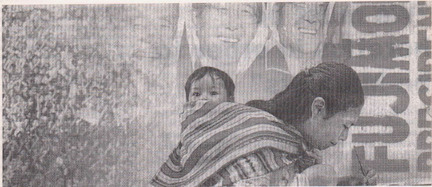
Voting in Peru

1970, but Allende held back the advance of the process and this is why the coup succeeded in 1973. If the process does not advance, it goes backwards.