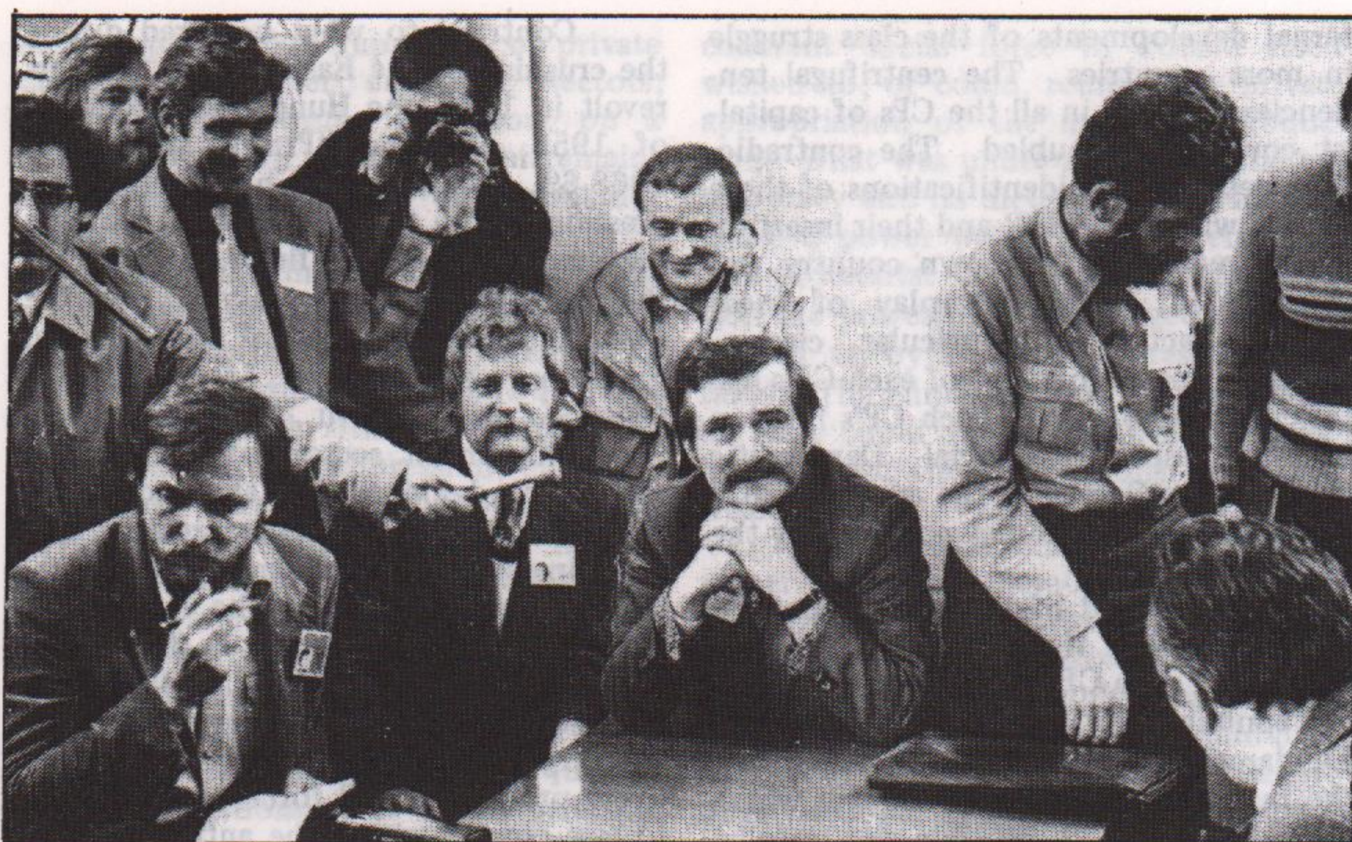
Solidarnosc leaders in press conference

by the workers leading to mass strikes and workers self-organization, could be repeated in their own country. This even applies to the People's Republic of China. There the leading faction of the bureaucracy did first extend discreet support to Solidarnosc in the belief the Soviets might intervene and a "national liberation struggle" against this superpower would ensue. But later, under the pressure of discontent and strikes in China itself, it decided to redirect its fire, accepting de facto Jaruzelski's coup.