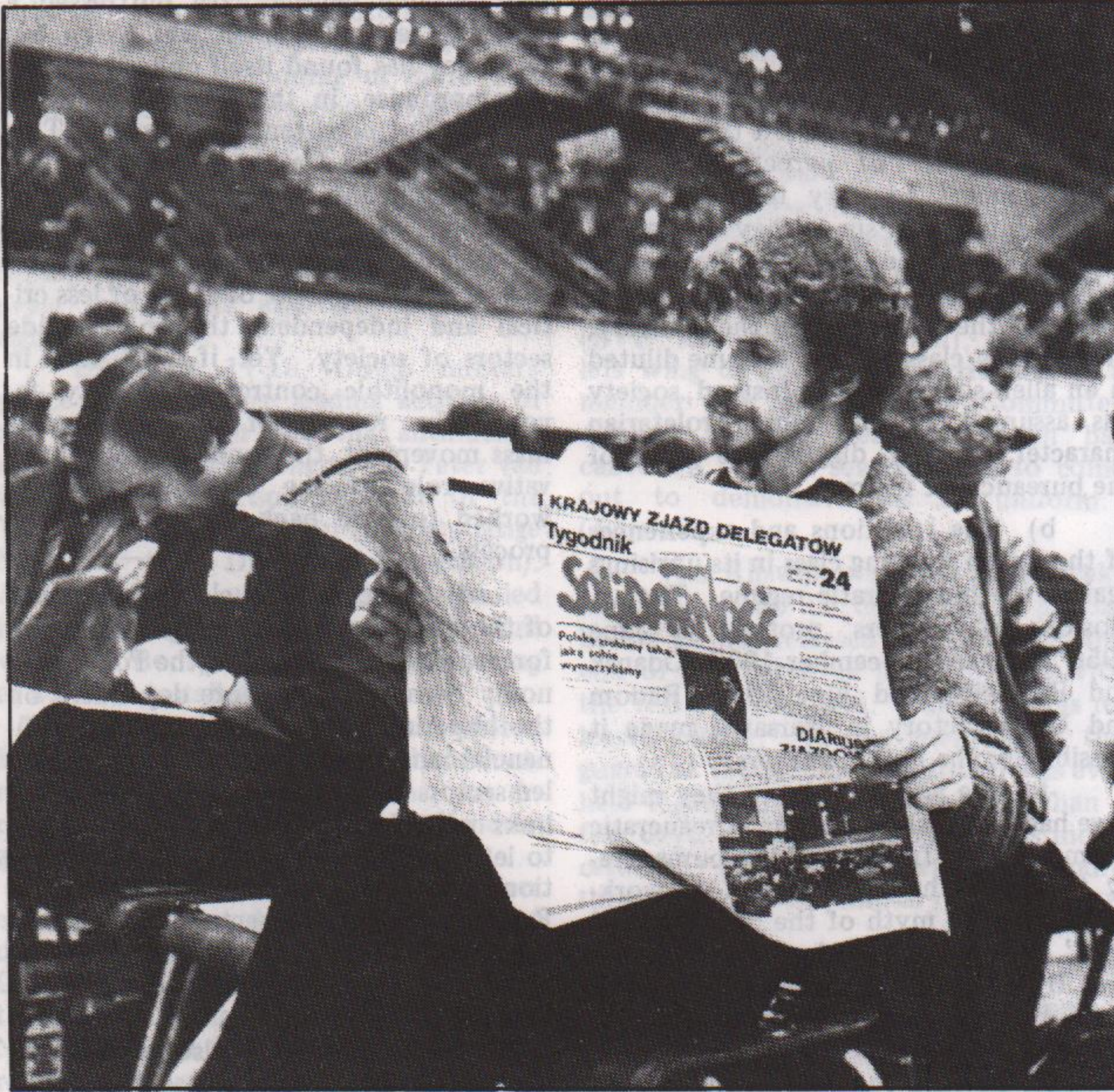
First national congress of Solidarnosc (DR)

3. In the course of the revolutionary rise, various forms of struggle and organization emerged that brought the workers closer to the conquest of power. The first was the movement of workers self-management that was concretized in the formation of workers councils in the factories; these tended to become centralized, first on a regional level, and then on a national level. Solidarnosc's experiment with supervising distribution and the system of rationing of essential products significantly contributed to developing workers control over the economy, even though it was limited to only one region. The challenge to bureaucratic power was sharpened by the emerging forms of citizens' self-management on a territorial basis which corresponded to the mass