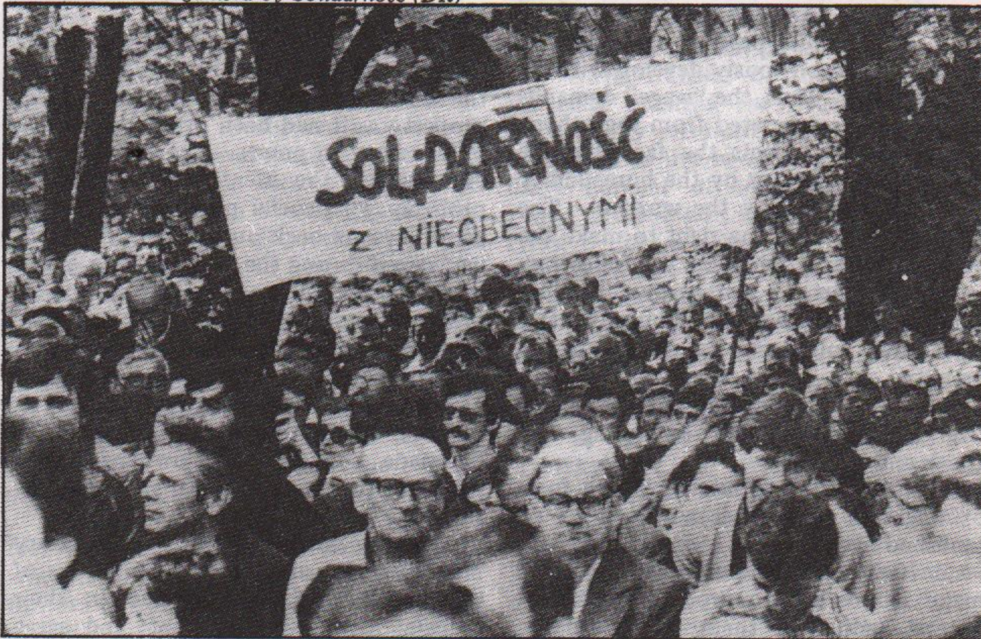
Demonstration organised by Solidarnosc

tion, of soldiers councils in the Russian, German, and Spanish revolutions.