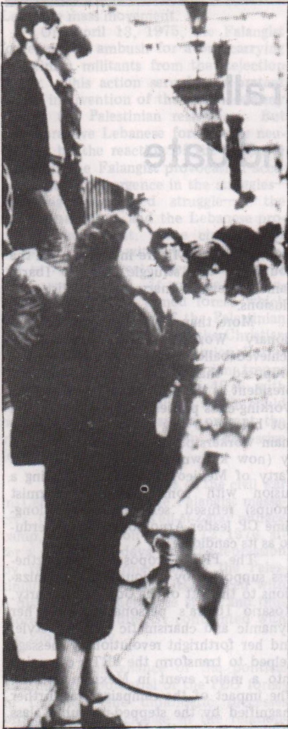
Rosario Ibarra de Piedra