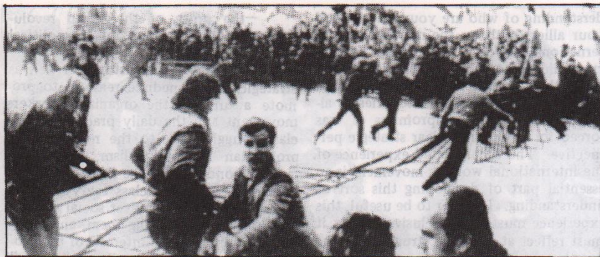
Youth in Warsaw streets May 3, 1982

creating divisions by granting preferential treatment to many of the imprisoned union leaders and experts.