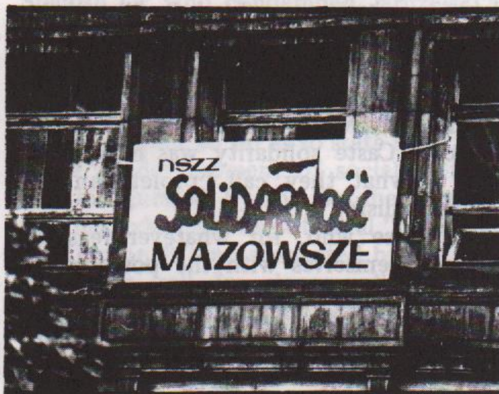
Warsaw region Solidarnosc offices (DR)

Something very similar takes place under the rule of the bureaucracy. A strike involving occupations poses in practice the question of who should control the factories and their product—the working class or the bureaucracy? The form of the strike movements in Poland demonstrated that the workers were capable of putting the factories they occupied, as well as all the means of production concentrated in them, to work for society as a whole and in the interest of all. Trotsky also noted that the emergence of factory committees as a result of strikes involving occupation created a situation of dual power in the factory. The enterprise committees, the regional leaderships, and the national leadership of Solidarnosc de facto have created dual power at all these levels, not only because they developed out of this type of strike, but because they also have taken the lead in carrying out new occupation strikes.