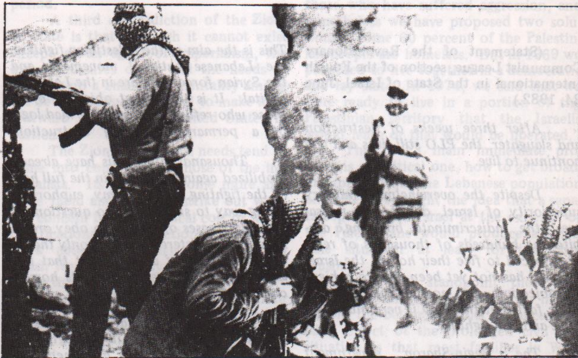
Palestinian guerrillas

On the political level, if the present Palestinian leadership comes out of this confrontation humiliated and totally de-