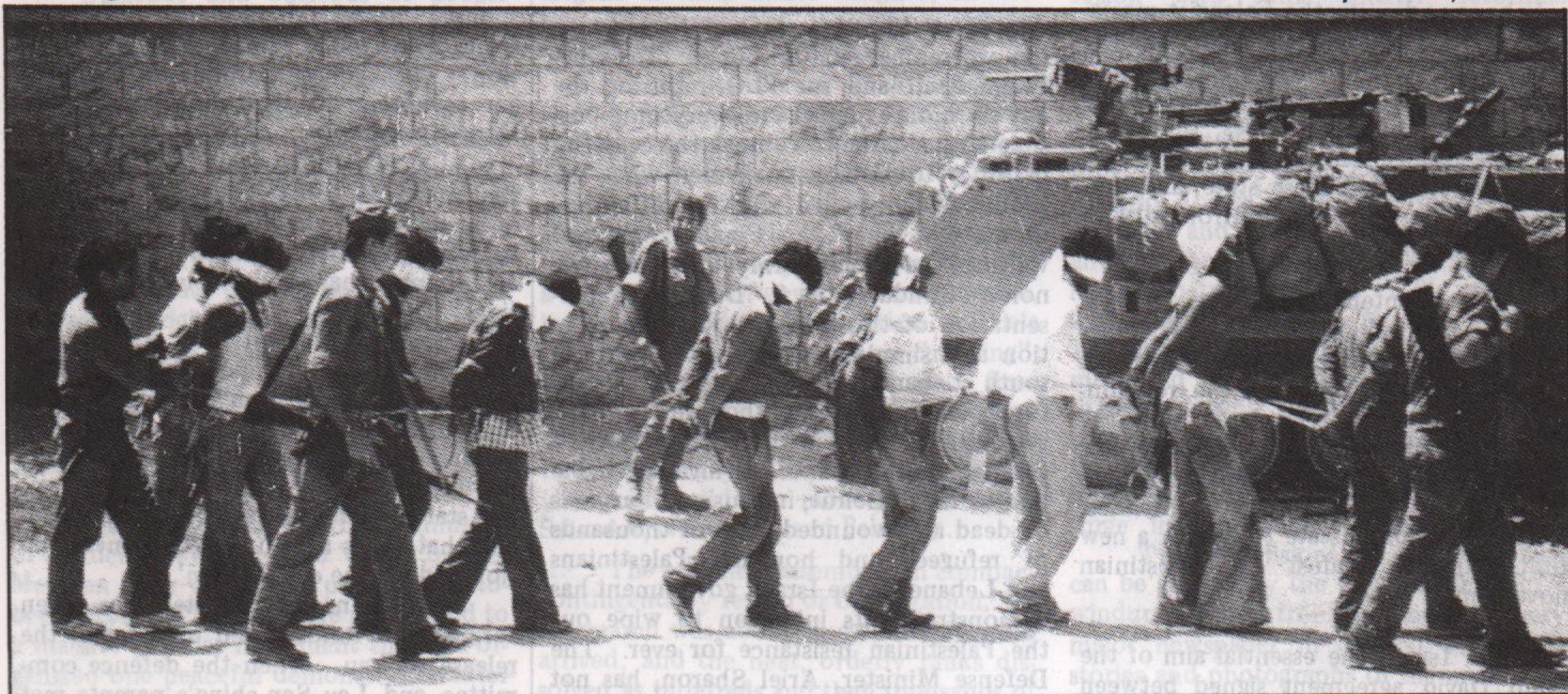
Palestinian prisoners of the Zionist army

1969 between the President of the PLO and the Commander in Chief of the Lebanese army, under the auspices of the representatives of the United Arab Republic, established the legitimacy of the armed Palestinian presence in Lebanon, 'posts of the armed Palestinian struggle within the camps', and delimited the zones where the Palestinian guerrillas could act as the 'Fatahland'.