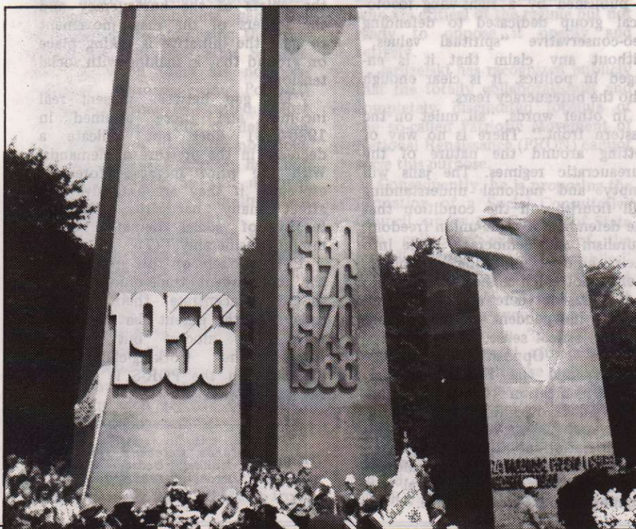
Monument to Hungarian uprising at Poznan, Poland