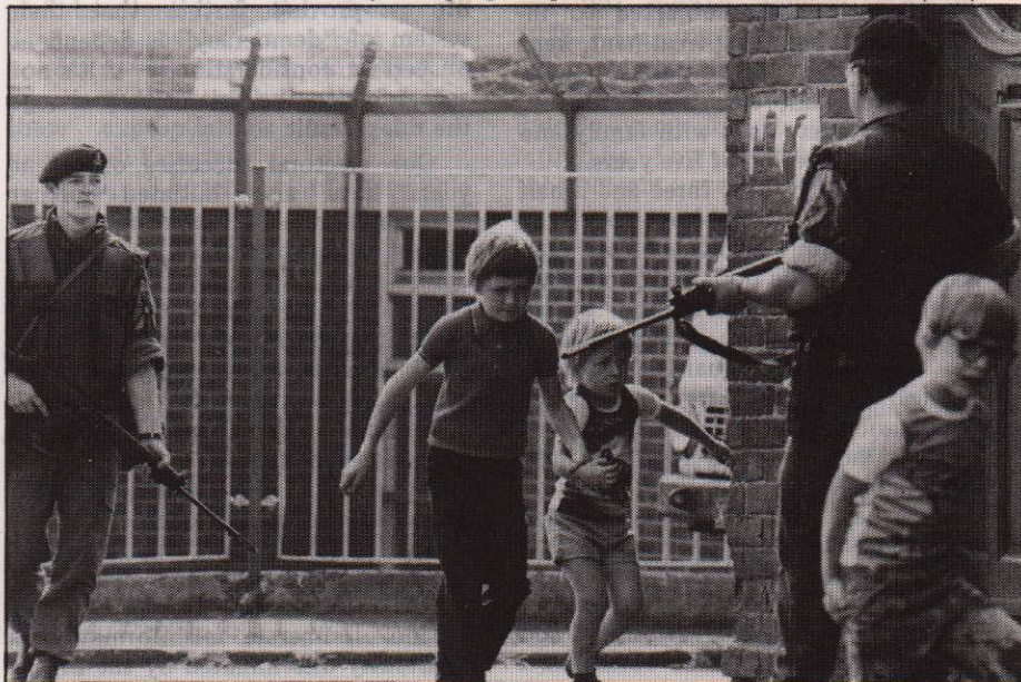
The British army "keeping the peace" in the North of Ireland