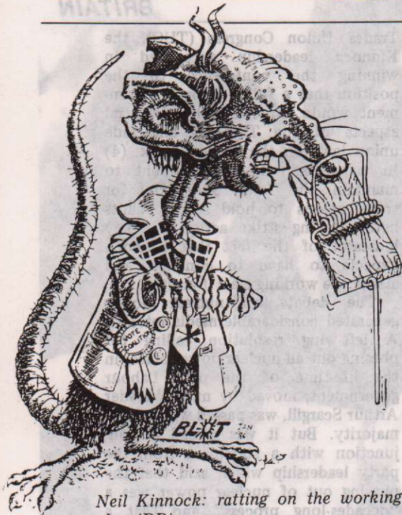
Neil Kinnock: ratting on the working class

that a Labour government would change its position on nuclear weapons. A Gonzales-type volte face on the question of nuclear weapons is clearly posed.