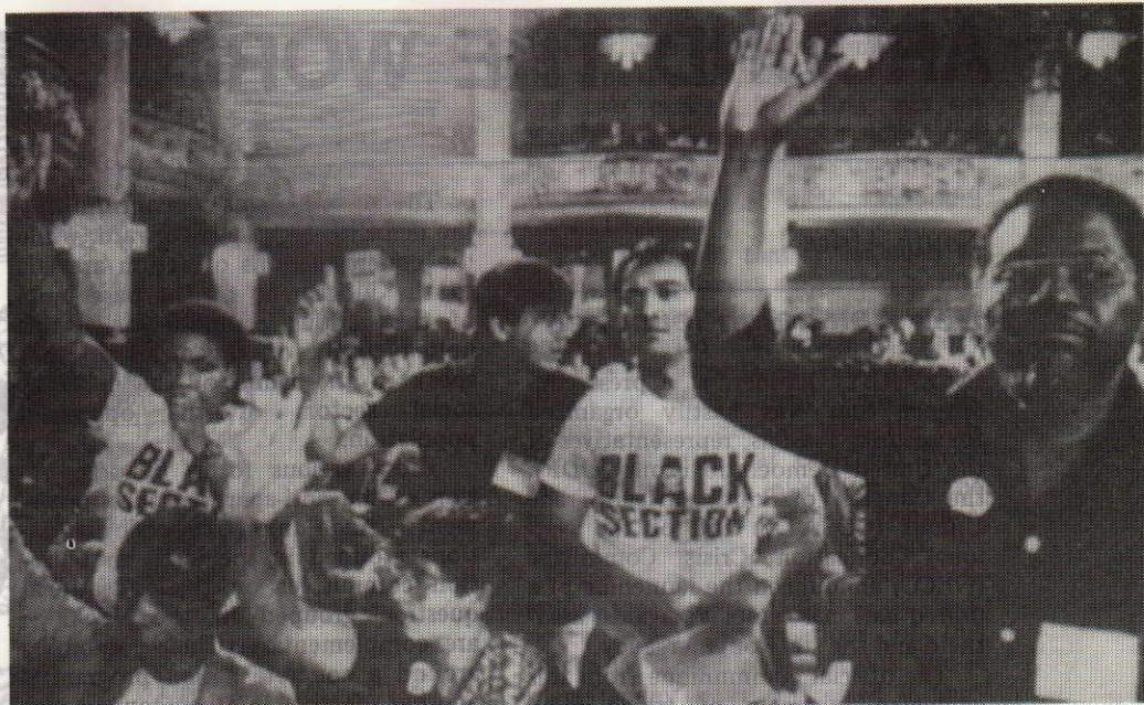
Black activists are fighting for the right of self-organization in the Labour Party (DR)

A week before the conference the left-wing Campaign Group of Labour Members of Parliament (in which Benn is involved) called a national meeting of left campaigns and groups to discuss organizing the left and combating the drift to the right. A decision was made to launch the "Campaign Forum"