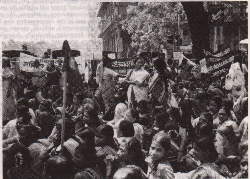
Women's demonstration in Maharashtra, March 1986