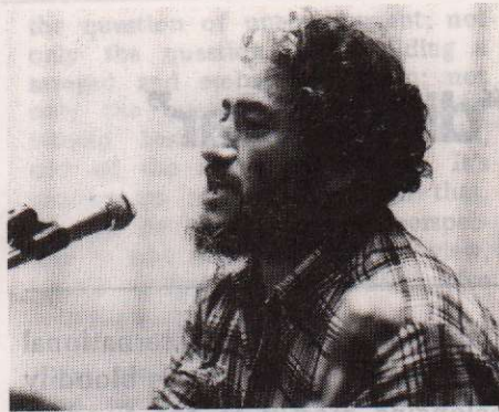
Hugo Blanco

Our goal is to raise the consciousness of the whole Peruvian people about all the atrocities that are being committed in the zones of repression, because these facts are unfolding today in Peru, but not outside. We want to demonstrate to the people that this is a threat against everyone,