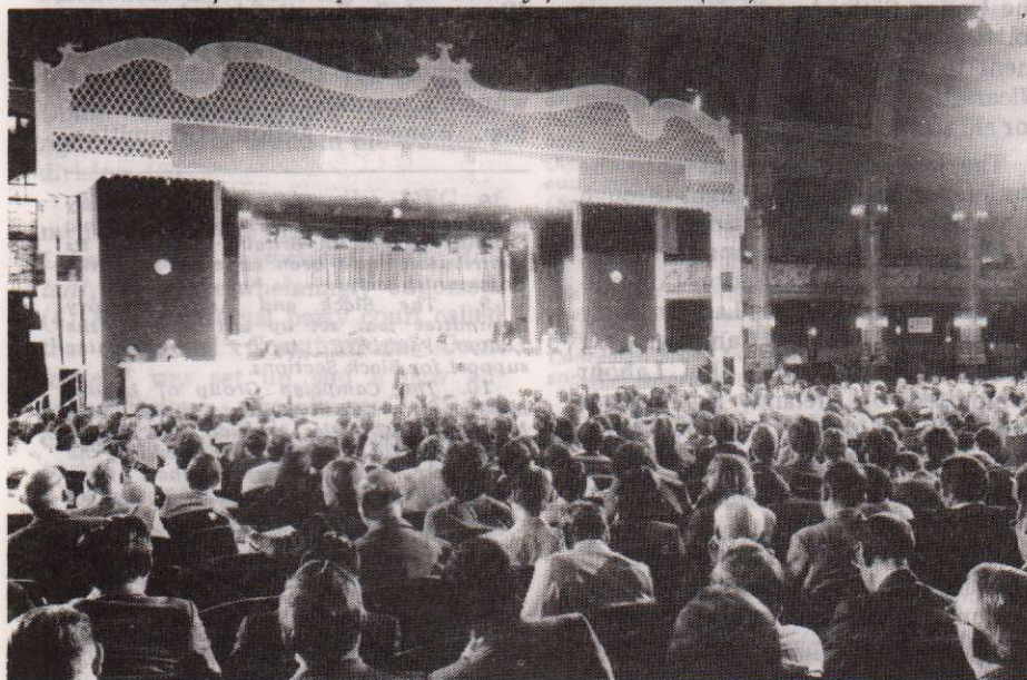
Labour’s conference: a pre-election rally for Kinnock (DR)

The left which is emerging is the most coherent and strategic one to have been created in the party since the 1920s. Internationalism, support for the demands of the