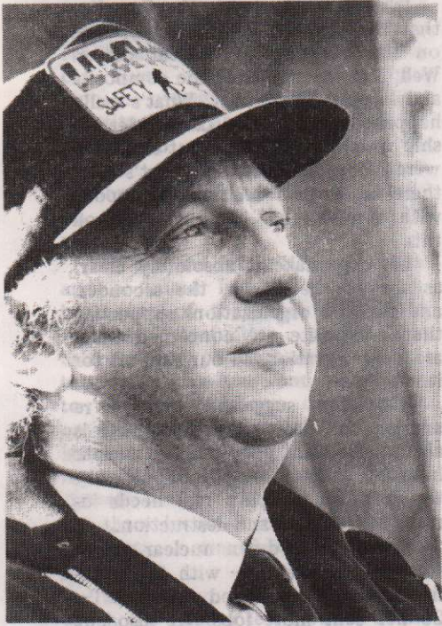
Miners' leader Arthur Scargill

And if they did give the official figures I wouldn't believe them! But I do know about the hundreds and hundreds of people who have died and are dying today in uranium mines in Namibia. And I do know about the 300,000 who will die as the result of Chernobyl."