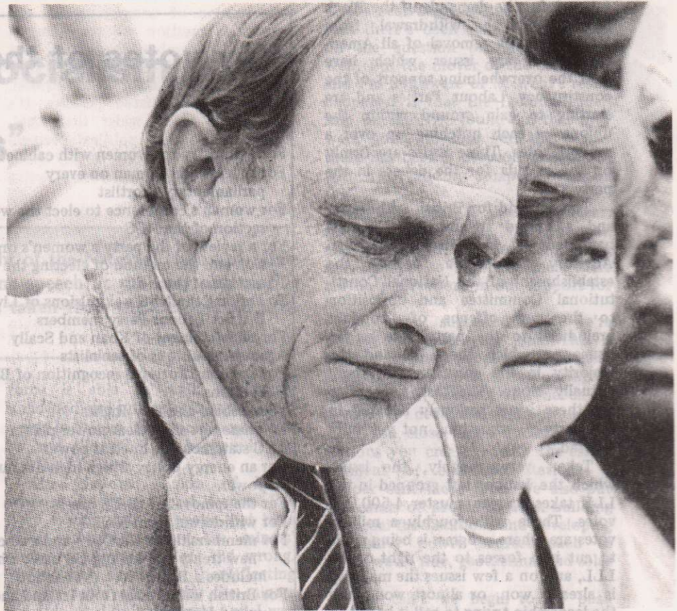
Labour leader Neil Kinnock (DR)

On South Africa, a resolution calling for a Labour government to