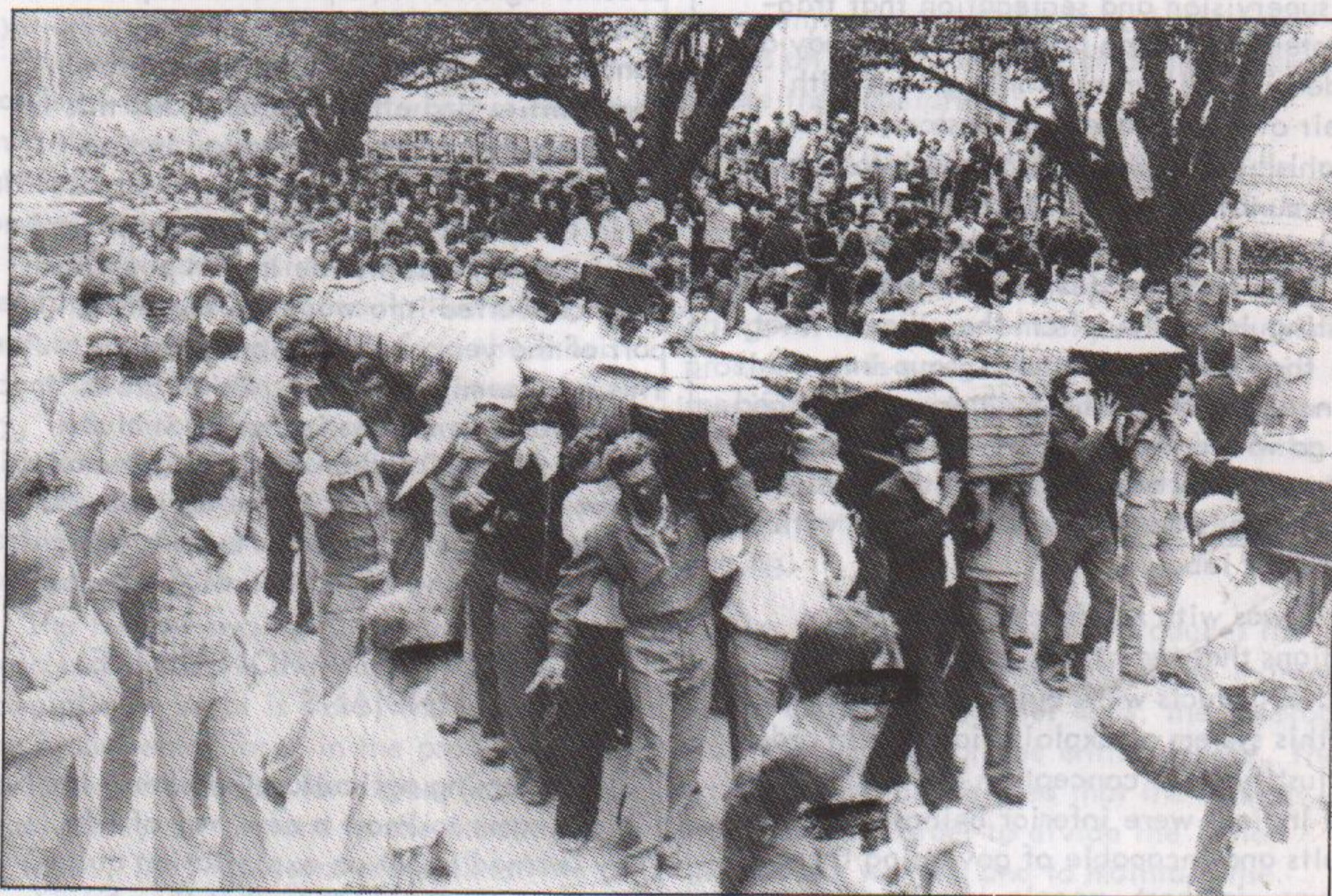
Mass Burial in Guatemala.

What has transformed the taciturn sowers of maize in the provinces of Quiche and San Marcos into determined guerrilla fighters? What has turned the hands of quiet Ixil, Mam, or Kanjobal women weavers from their looms and made them take up guns to fight against the oppressors of their peoples?