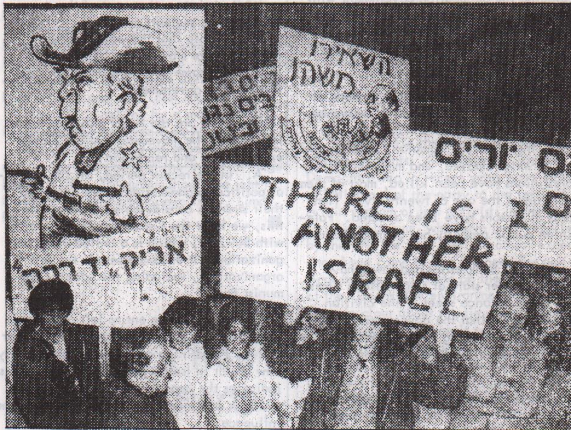
March 27 Demonstration in Tel Aviv. (DR)

While it is true that we have entered a period of worldwide capitalist crisis in general, in Israel this crisis assumes particularly acute forms, because 60% of the national budget goes for the military. That is, the political needs of Israeli capitalism make it impossible to achieve lasting economic stability.