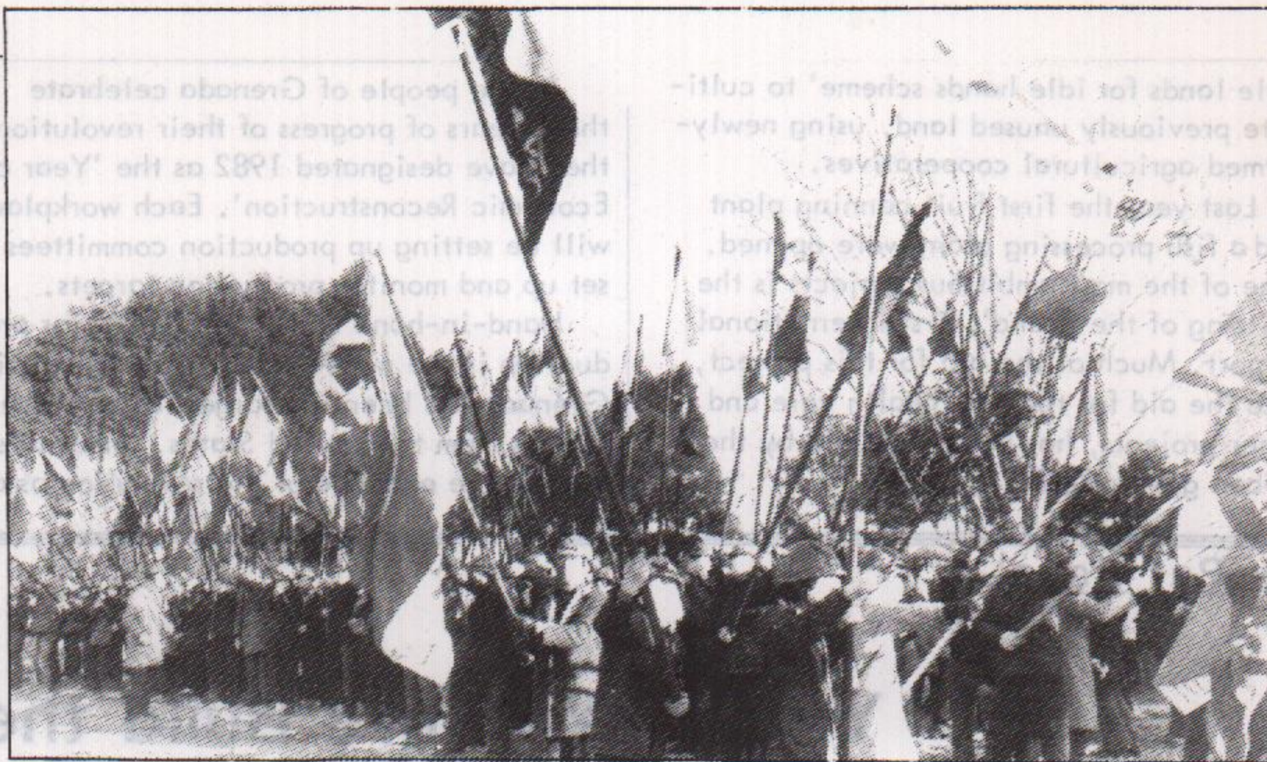
United-Front Demonstration Against Narita Opening.

Immediate measures have been taken to raise the living standards of the people. The cost of basic food items has been kept down. Cheap fertilisers have been provided for farmers. Housing materials are provided either free or at low interest rates to