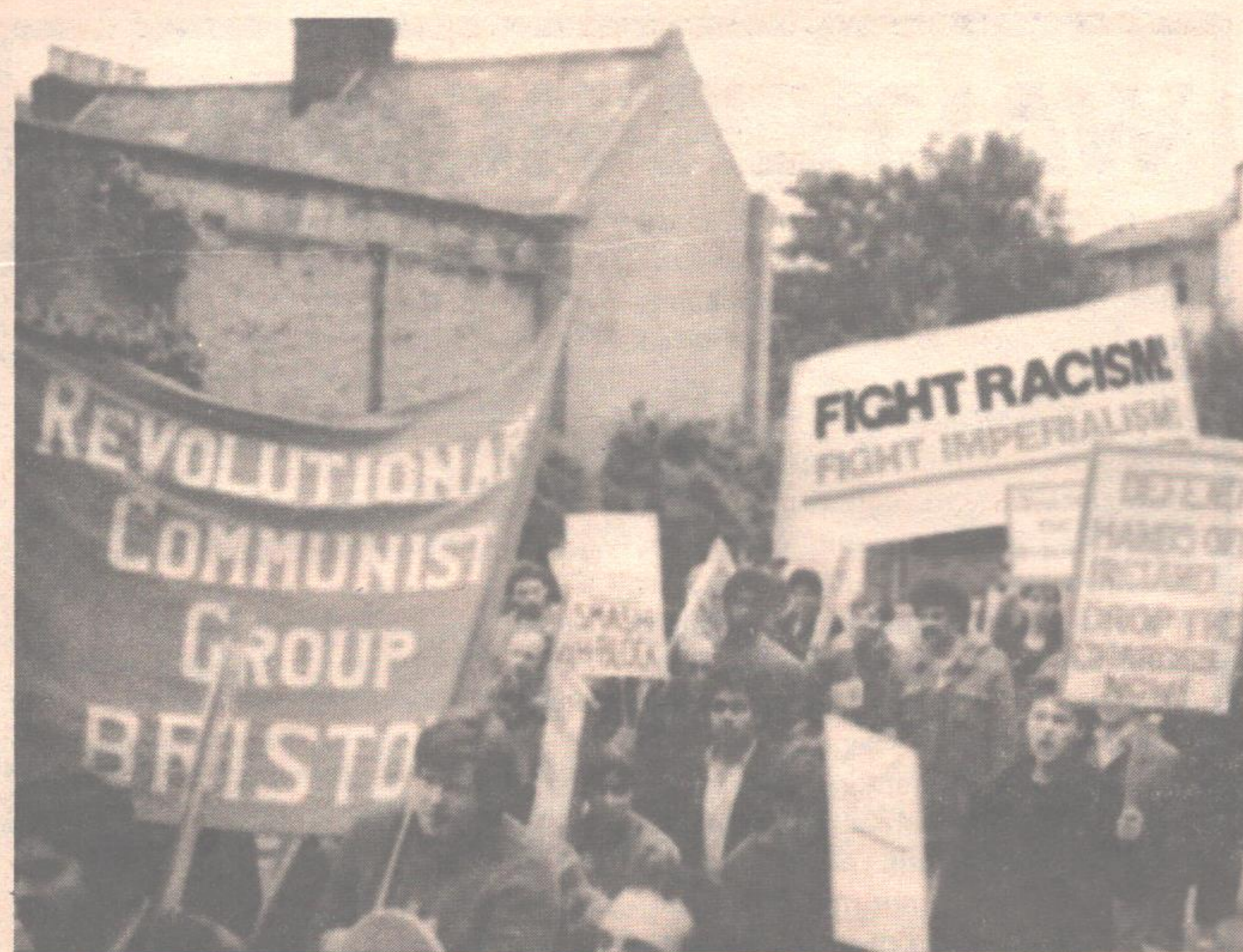
Hands Off Ireland demonstration, Luton