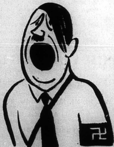
GERMAN WORKERS WILL SHUT HIM UP

The desire of the Polish government (Continued on page 3)