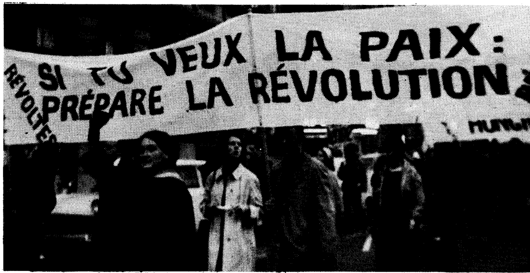
FRENCH YOUTH DEMAND PEACE THROUGH REVOLUTION AT LIEGE RALLY.

This "independent caucus" was united in an effort to end the organizational hegemony of YSA over the committee. It represented not only individuals independent of formal political associations but also members of S.D.S., DuBois Club and A.C.F.I. The formation of this caucus was in reaction