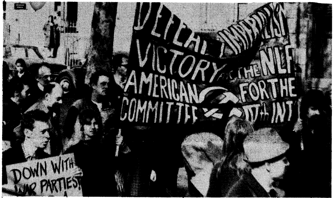
BULLETIN SUPPORTERS UNFURL REVOLUTIONARY BANNER AT NYC PEACE RALLY but can the jobless?

Now is the time to redouble our efforts despite this defeat. The Civilian Review Board had virtually no power anyway. The black people of Harlem and Bedford-Stuyvesant and the Puerto Ricans of the city could do well to follow the example of their brothers and sisters in Watts and Detroit. In both areas, blacks have organized their own patrols to keep a watch on the activities of the police. Now that the police have been emboldened by this "vote of confidence" engineered by the reactionaries, such a patrol is a vital necessity for the minority peoples of New York City.