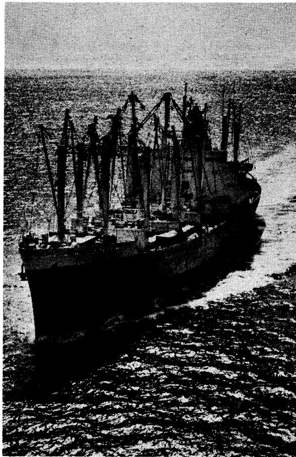
ONE OF SHRINKING AMERICAN FLAG FLEET.

The truth of the matter is that NMU members who supported the Trotskyist position fought consistently for the interests of the rank and file and the union from the late 1930s until they were witch-hunted out of the industry by Curran and the Government in the late 1940s. Curran hides their true program--a struggle for union not government jurisdiction over hiring, for better condi-