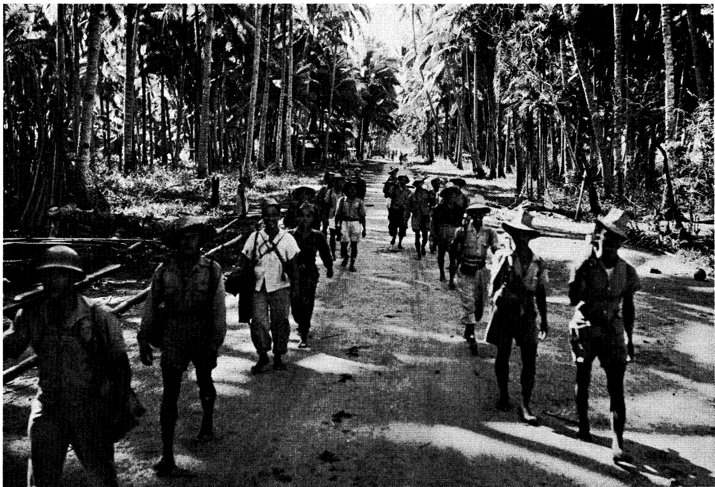
Philippine guerrillas move against the Japanese on Leyte in 1944.

I N the next decade the traditional imperialist system had sunk its claws into the Philippine body, converted its people into raw-material suppliers of American economy, while the islands were made into a dumping ground for American manufactures. The dry statistics tell their story: For the decade 1920-30, sugar exports to the United States rose by 450 percent, coconut oil by 223 percent, cordage by over 500 percent. The Philippines, situated some 6,000 miles from the American mainland, with natural markets in the Far East, which exported during the Spanish period about 20 percent of its total to the United States, had its whole economic direction turned around to where three-quarters of its produce was going to this country. According to the Jenkins study: "The nature and extent of pre-war Philippine foreign trade illustrate, with some variations, the pattern of colonial development familiar throughout Southeast Asia. To the United States came agricultural raw materials and products needed for manufacture in this country, and from this nation went industrial goods and commodities vital to an underdeveloped economy. American exports also included foodstuffs such as wheat and flour, for owing to excessive specialization on export products the Philippines, though an agricultural nation, was unable to feed itself."