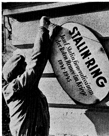
SIGN OF THE (OLD) TIMES

Let no one imagine that this argument disposes of the matter and instructs us precisely what is the correct proportion of capital to be invested in heavy and light industries under socialist planning. From the same Russian victory over the Nazis, people used to glibly explain how Stalin was vindicated in doing away with most of his General Staff. Now, it is acknowledged that instead of aiding this vic-