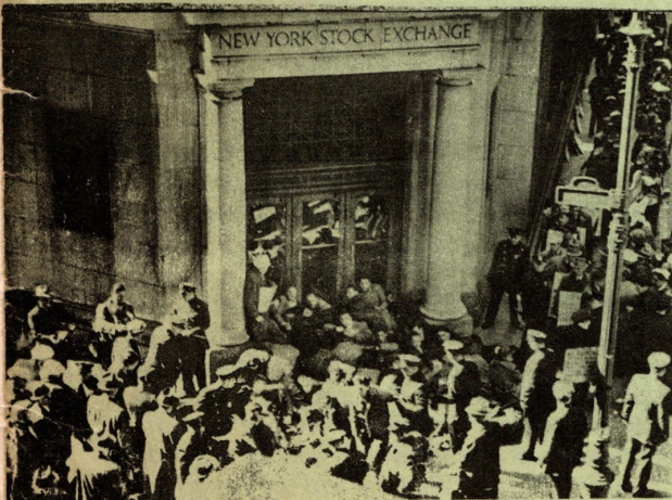
Financial office workers hurled selves at "New York's finest" and seized doorway of Stock Exchange during March 1948 strike