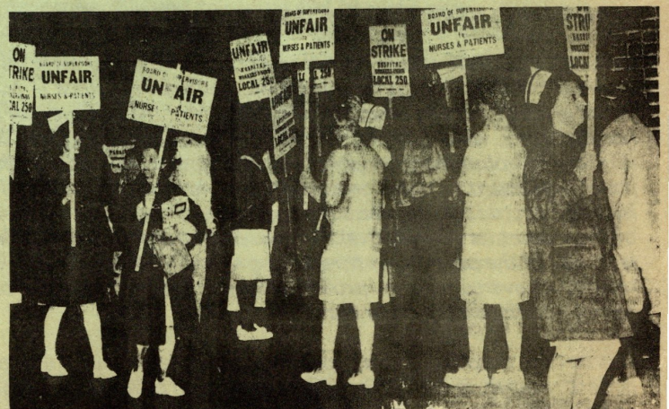
At the gates of San Francisco General Hospital, nurses call Board of Supervisors "unfair to Nurses and Patients."