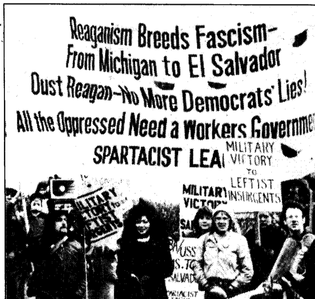
Anti-imperialism abroad means class struggle at home.

So the stage was set. On the morning of March 27, there was a CISPEs goon squad of 30-40 deployed at our designated entrance to Malcolm X Park by 7 am. It was composed mainly of Marcyites who under their cover as Coalition "marshals" were pursuing their vendetta against the Spartacists. When spokesmen for the Anti-Imperialist Contingent approached the gate at 8.00 am we were met by a police official who said we could not enter because "the Coalition" did not want us there. He mentioned that the cops standing around were not ordinary police but the SWAT squad. A block away they had two busloads of riot cops together with vans for their arsenal. Shortly after, 25 motorcycle cops with riot clubs drove up, blocking us off with a line of cycles; some time later a dozen mounted police arrived. The Marcyite goons blocked the entrance with tables.