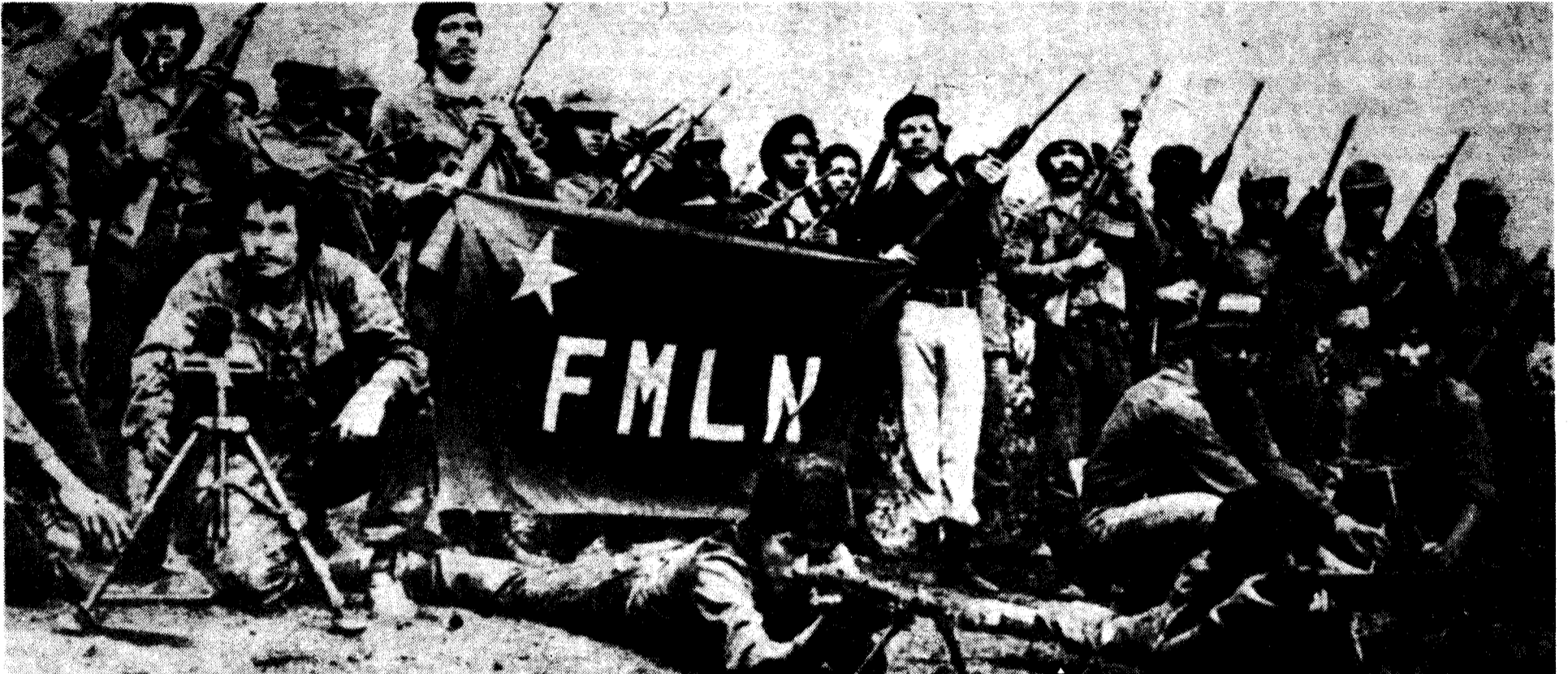
Salvadoran guerrillas are not fighting to give up military victory for a "political solution" with the junta.