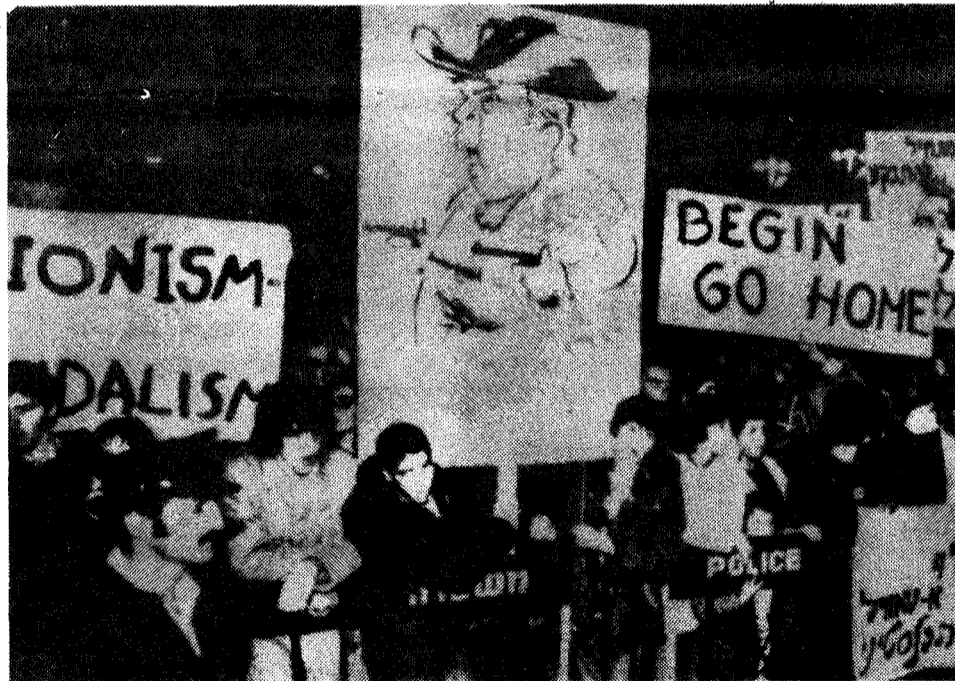
Hebrew-speaking people and Palestinians protest Begin's terror on West Bank. "Peace Now" demonstration in Tel Aviv, March 27 draws 50,000.

— reprinted from Workers Vanguard no 303, 16 April 1982