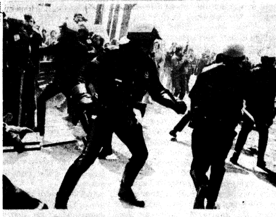
Cops move in to seal off Anti-Imperialist Contingent as Coalition goons are dispersed.

Shortly after 1 pm, as previously arranged, 400 supporters of the Anti-Imperialist Contingent filed out of the assembly site five abreast and proceeded