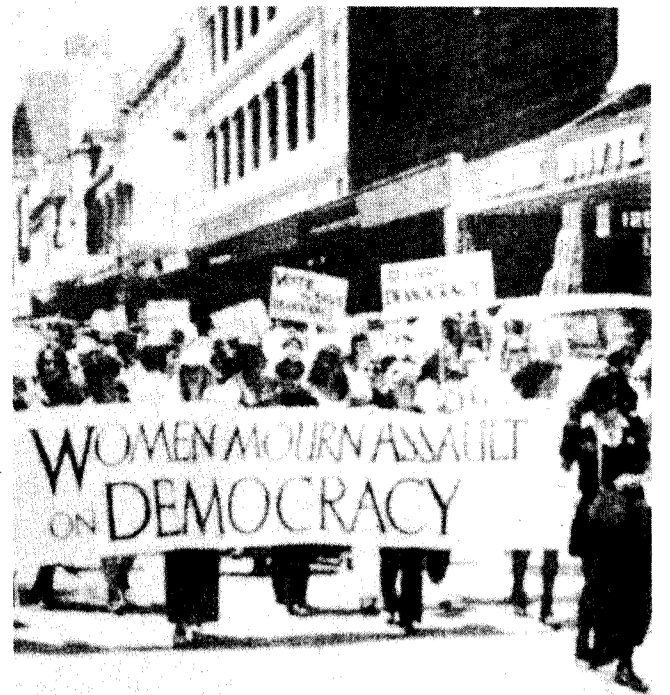
"Women's role": Feminists push democratic illusions in Perth.

The logic of the feminists' striving for an autonomous women's movement is inherently petty-bourgeois -- attempting to balance between, but remaining aloof from, both the capitalist class and the proletariat. It is thus no accident that the social basis of the feminist-dominated women's movement is primarily from among petty-bourgeois women. And its active demands reflect the concerns of this layer, rather than focusing on the needs of working-class women, for example the restriction of the Women's Abortion Action Campaign (sponsored by the Socialist Workers League -- SWL) to "repeal all abortion laws" as against a campaign for free abortion on demand and free quality health care; the Women's Electoral Lobby's emphasis on increasing the number of women bureaucrats in the media, the ALP, government, and more recently even the trade unions; the social-work projects of the women's movement which because they are totally dependent