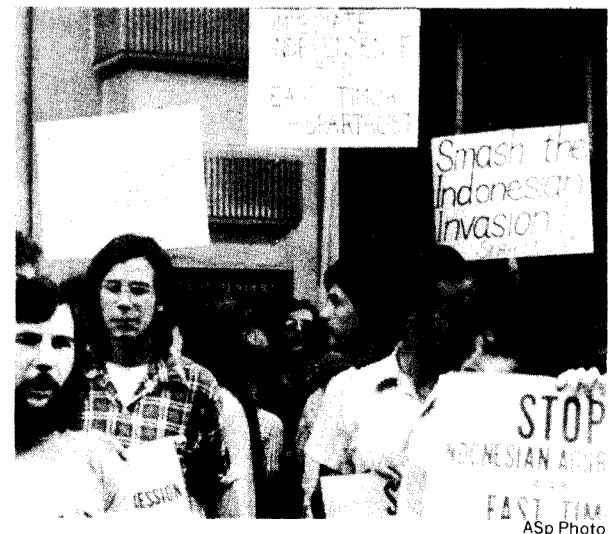
Outside Indonesian Consulate, Sydney, 7 December.

All Indonesian forces out of Timor! For an immediate, total trade-union ban on Indonesia! For a permanent ban on military aid and material to Suharto! For international working-class action to defend East Timorese independence! For a Trotskyist Party in Indonesia!