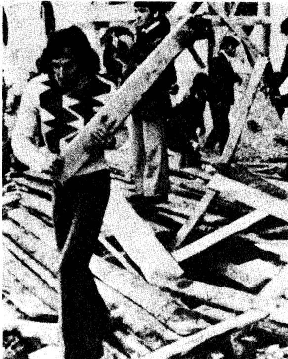
Striking building workers blockade Lisbon government

Confrontations with proletarian strongholds