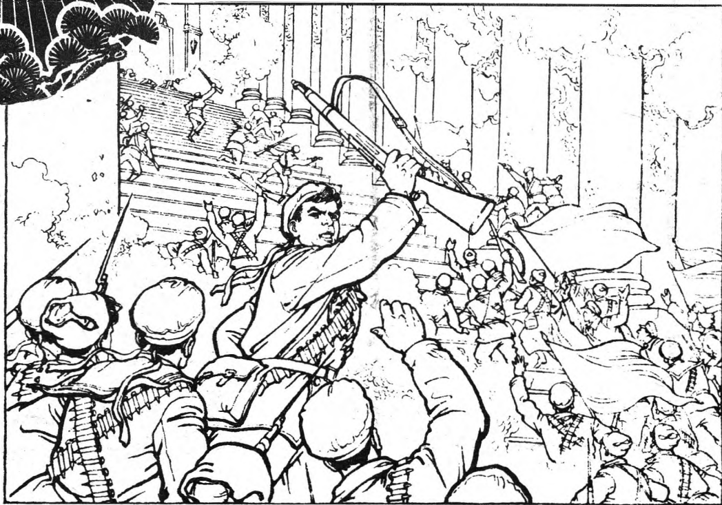
LED BY THE BOLSHEVIK PARTY, under the direct leadership of Lenin, the Russian proletariat carry out the first successful socialist revolution.