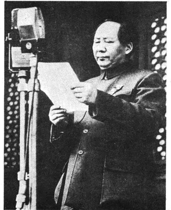
CHAIRMAN MAO PROCLAIMS the founding of Peoples Republic of China, October 1, 1949.

"The Bolsheviks wanted to create a new party, a Bolshevist party , which would serve as a model for all who wanted to have a real revolutionary Marxist party.... They worked for it stubbornly, persistently, in spite of everything.... Lenin's What is to be Done? was the ideological preparation for such a party. Lenin's One Step Forward, Two Steps Back was the organizational preparation for such a party. Lenin's Two Tactics was the political preparation for such a party. And Lenin's Materialism and Empirio-Criticism was the theoretical preparation for such a party.