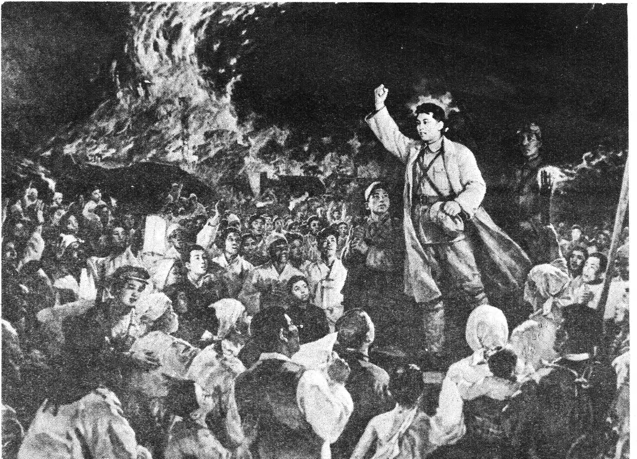
COMRADE KIM IL SUNG lit a torchlight in the night sky over Bocheonbo to illuminate the road the Korean people should follow

The U.S. capitalist press itself has admitted that there are units of "Phantom" jet tactical flying corps under the "missile command" and "air force defense commands" in South Korea. There are 1,000