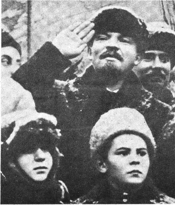
LENIN ON RED SQUARE on the second anniversary of the Great October Revolution, 1919.