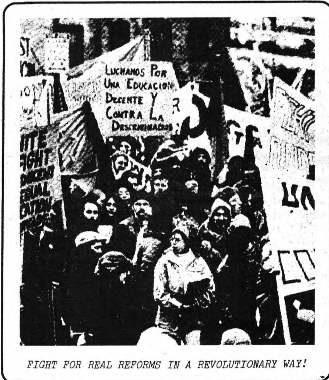
FIGHT FOR REAL REFORMS IN A REVOLUTIONARY WAY!

"The development of fascism assumes different forms in different countries, according to historical, social and economic conditions and to the national peculiarities and the international position of the given country' (Dimitrov). In this country, fascism would ride into power through the vehicle of racism. This is why the Boston busing issue represents more than simply racial strife." "George Dimitroff also wrote that 'in contradiction with German fascism, which came under anti-constitutional slogans, American fascism tries to portray itself as the custodian of the constitution and American democracy'" (WVJ, #3, p. 54.)