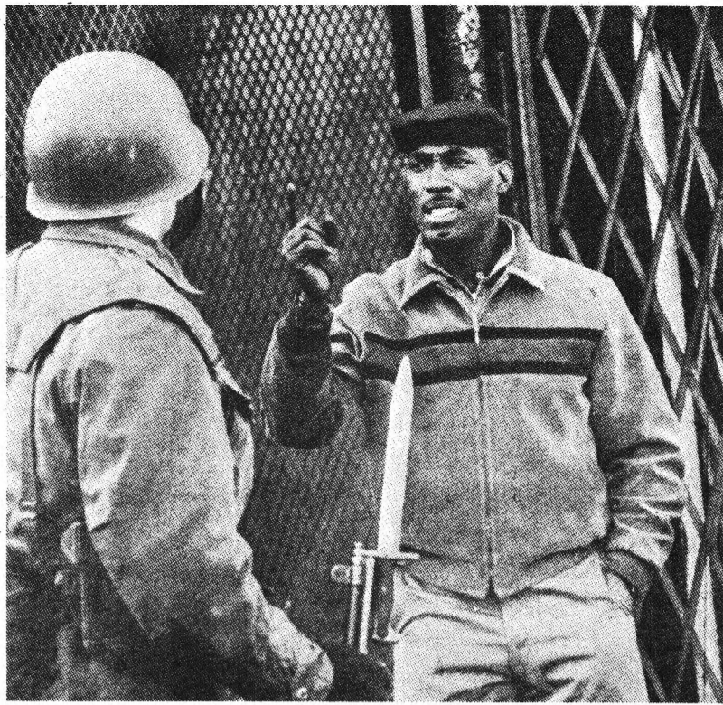
DEFEND THE AFRO-AMERICAN COMMUNITY'S RIGHT TO ARMED SELF-DEFENSE !

The forced busing plans continue as a testing ground of the bourgeoisie as it further streamlines and centralizes