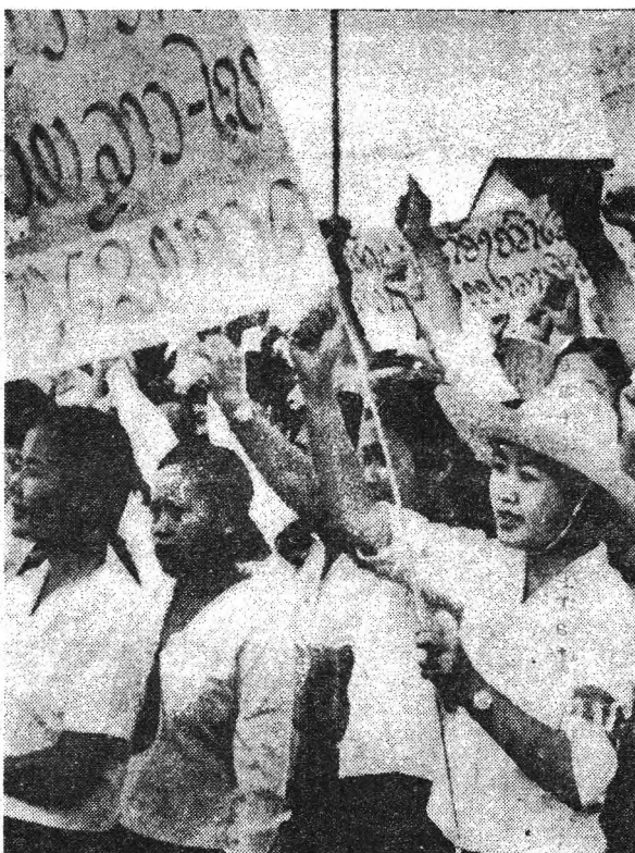
WITH THE DEFEAT OF US IMPERIALISM in Indochina, Soviet Social-Imperialists have become the main source of war. Both superpowers are the main enemies of the oppressed masses of the world. Here Laotian people denounce the US backed military coup in Thailand.

While the present Thai military junta is trying to suppress the people's revolutionary struggle by daily arresting people suspected of having communist affiliations, the heroic tradition of the Thai people's resistance is already reasserting itself, and once again proves that "reactionaries make trouble, fail, make trouble again until their doomsday,