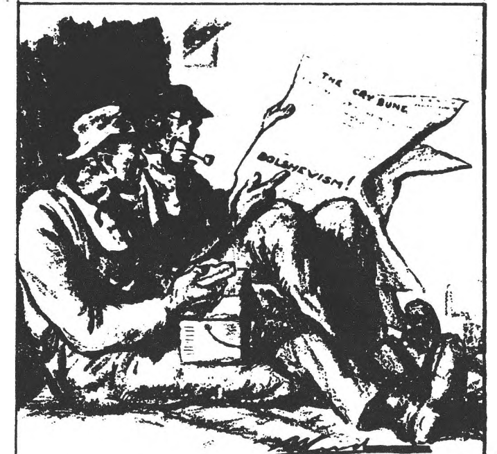
"I know what this Bolshevism means, Bill - it means us."

fused to load arms and munitions destined for Admiral Kolchak, who was leading a counter-revolution against the young Soviet republic. The workers beat up strikebreakers who tried to load the arms. In the 1919 Seattle general strike, mass workers' organizations appeared much like the Soviets (councils) of Workers, Peasants, and Soldiers that had seized power in Russia.