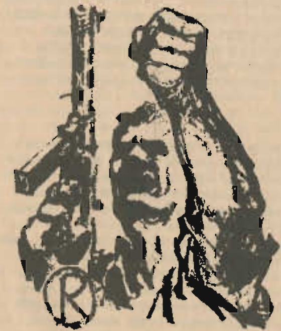
THE RESISTANCE WILL WIN!

A task of enormous transcendence for the defense of socialism and world revolution is the exposure of the leading gang in China headed by Teng Hsiao-ping, defending the immortal principles of Marxism-Lenin-