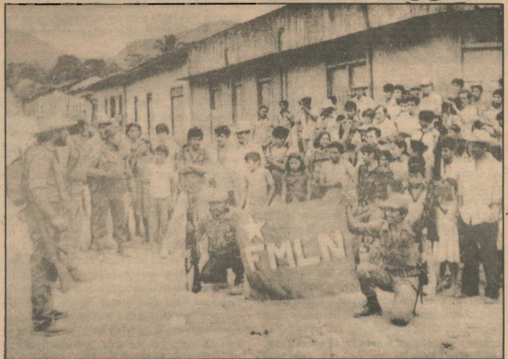
Salvadorian liberation fighters celebrate their triumph over the forces of the U.S.-backed fascist regime in the town of San Francisco Javier, January 26.

But this is a dead-end trap for the people. The struggle in El Salvador is a fight of the toiling masses against the ruthless exploitation by the handful of rich landowners and capitalists. It is a fight against the plunder of