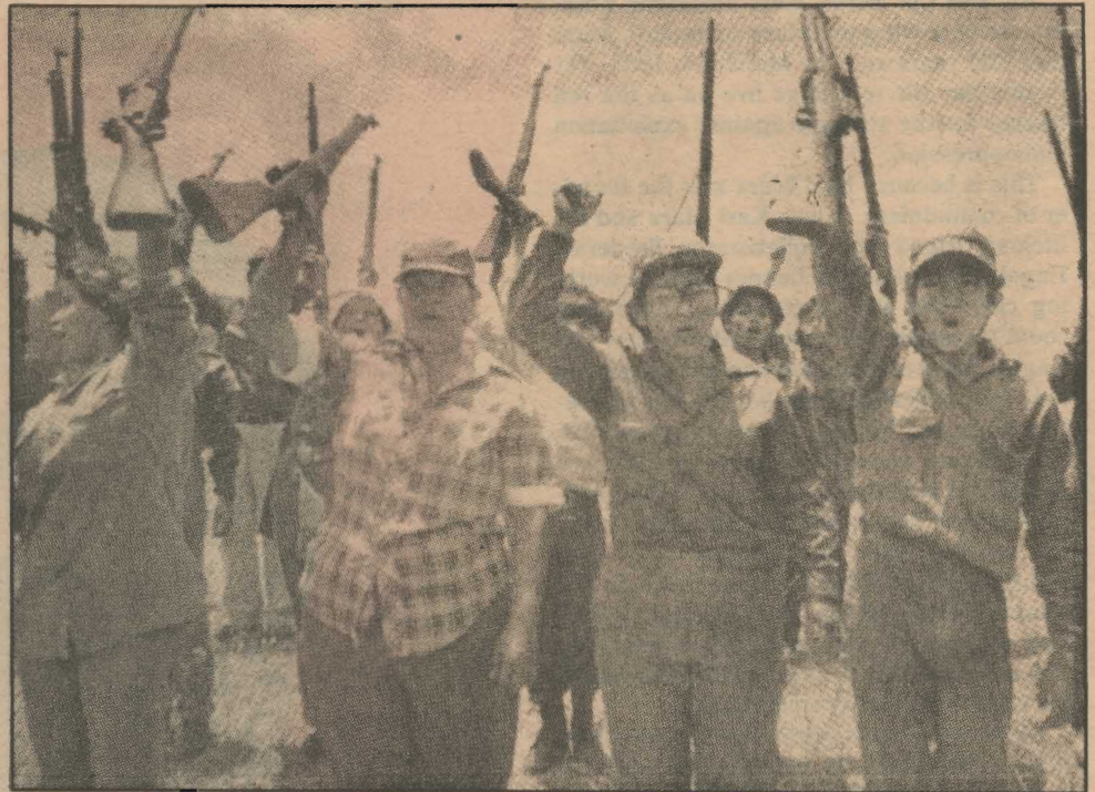
In Nicaragua, volunteers have rallied in their thousands to resist the invasion by the CIA-organized mercenaries and Somozistas.

However, today certain Democrats in Congress are wringing their hands that Reagan is allegedly violating the will of Congress on Nicaragua. Specifically they point to the Boland Amendment. This was passed last December and advertised by the liberals as an act that would supposedly stop CIA "covert actions" against Nicaragua. But this was simply another fraud from the Congressional talk shop. The Boland Amendment only says that no money should be spent for the specific purpose of overthrowing the Nicaraguan government. But since Reagan has all along used the most baldfaced lies to deny that this