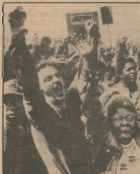
On March 15, over 2,000 angry workers from dozens of high-unemployment areas demonstrated in Washington, D.C. against Reagan's economic program of mass unemployment and hunger.

Together the Democrats and Republicans are tied firmly to the Reaganite bandwagon of unemployment and hunger. This is be-