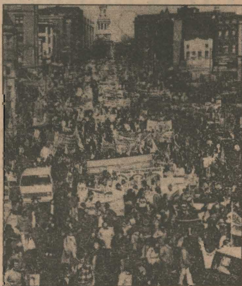
Tens of thousands march in Washington, D.C., March 27.

Central America. It shows once again that the U.S. has not changed one bit since the days it ravaged Viet Nam. It remains a monstrous imperialist superpower. Thus, when Reagan and Haig, the other politicians and generals, and the media czars speak of Central America, they speak of it in naked imperialist terms, as U.S. property, as its "backyard," its "vital interests," its "strategic interests," and so forth.