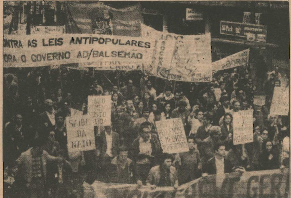
The vigorous strike movement of the Portuguese workers throughout the last year culminated in a huge nationwide general strike on February 12 against austerity measures and proposed repressive constitutional changes by the government. The Communist Party of Portugal (Reconstructed), the Marxist-Leninist vanguard of the workers, was very active in organizing this strike. Above, one of many demonstrations organized on March 6 to continue to press the workers' demands.

In every corner of the globe the Marxist-Leninists, the revolutionaries, the workers, the peasants, and all the oppressed are rising in struggle against the old world of capi-