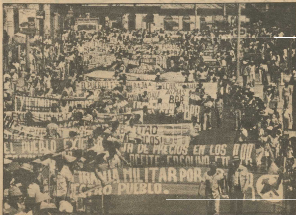
Scene from a powerful mass demonstration in San Salvador, January 22, 1980.

The military junta has responded to the people's liberation struggle with a policy of extermination, unleashing a reign of ferocious terror against the population. Countless thousands of the finest sons and daughters of the workers and peasants have been murdered in cold blood. Even 10 year old children are treated as suspected "terrorists" to be arrested, tortured and murdered. The government troops have resorted to wholesale massacres of the peasants, burning their homes and fields in Viet Nam-style "search and destroy" operations. The National Guard and the police are assisted in their bloody work by the right-wing paramilitary organizations such as ORDEN. These fascist gangs have been set up and armed by the wealthy families of the oligarchy (many of whom have already sought refuge in Miami) for the sole purpose of terroriz-