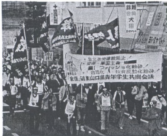
Japanese workers demonstrate against war on October 21, International Anti-War Day, at Iwakuni City in Yamaguchi Prefecture. They are holding up placards which read: "Oppose militarist restoration!", "Oppose aggressive war preparations..."

The School prospered throughout the twenties and became a