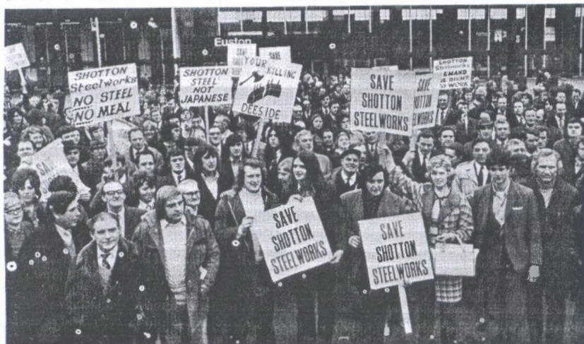
Steelmaking at Shotton is definitely to end if the British Steel Corporation has its destructive way. But the fight to save Shotton and its more than 6000 jobs is far from over. Our picture shows Shotton workers demonstrating in London in January, 1973.

What applies to steelworkers applies to so many other workers. In the motor industry, shipbuilding, textiles and electronics British workers are denied access to the home as well as foreign markets. The prospect if capitalism defeats us is too depressing to contemplate. We cannot adopt the stance of spectators at our funeral.