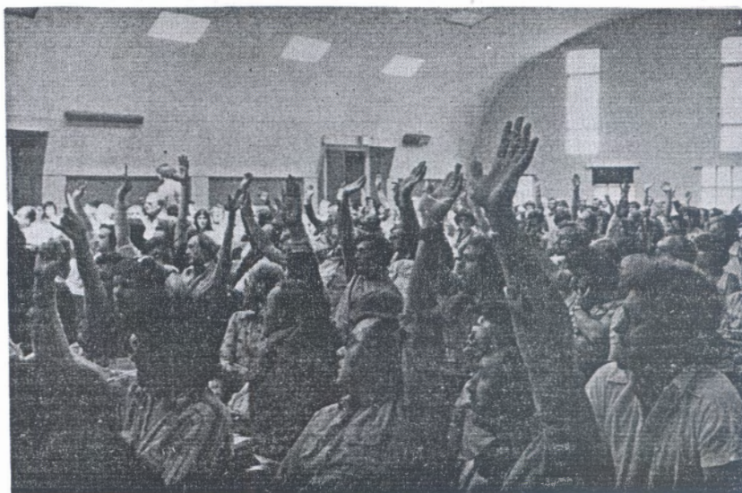
Delegates at the Annual Conference of the National Association of Teachers in Further and Higher Education vote in support of an interim claim for the merger of lecturing grades I and II. In support of the claim the National Executive has called for a campaign of action including one day strikes to go hand in hand with the negotiations.

and argued that free collective bargaining is incompatible with "modern economic management." Although the conference engaged in some sabre-rattling on the need to obtain a full ten per cent wage increase this year, NALGO showed that for the present, its seaboard is empty.