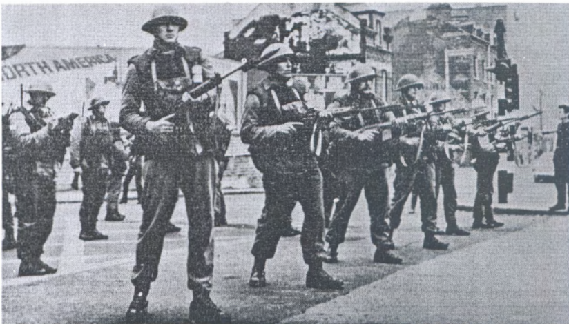
In THE WORKER of September 1969 the despatch of British troops to Ireland by the Labour Government was soundly condemned. "We must be absolutely clear about British Imperialism as operated by the Labour Government. We call for the smashing of the whole fascist apparatus of the Northern Ireland Government, but not in order for Northern Ireland to be brought under the direct control of Westminster. These British troops are simply the 1969 version of the Black and Tans. Out with them."