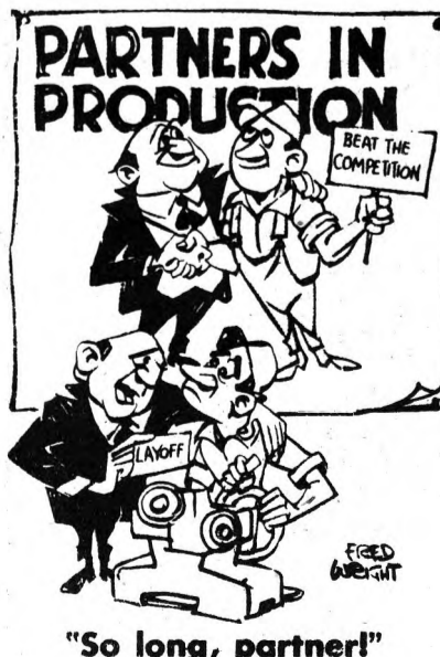
"So long, partner!"

The Communist Labor Party urges all the readers of the Western Worker to help sustain our party's press by subscribing now.