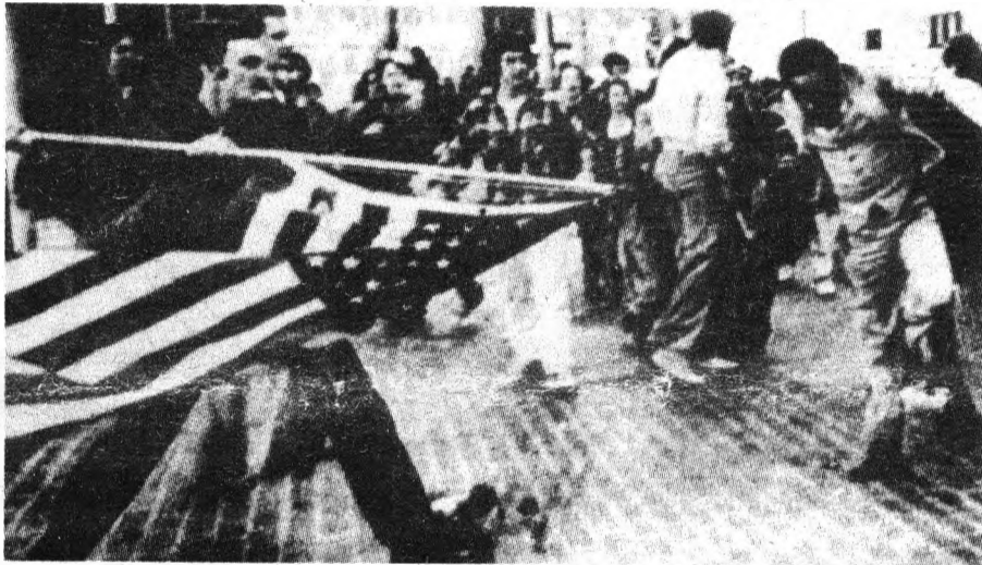
THUGS ATTACK NEGRO LAWYER IN FRONT OF BOSTON'S CITY HALL