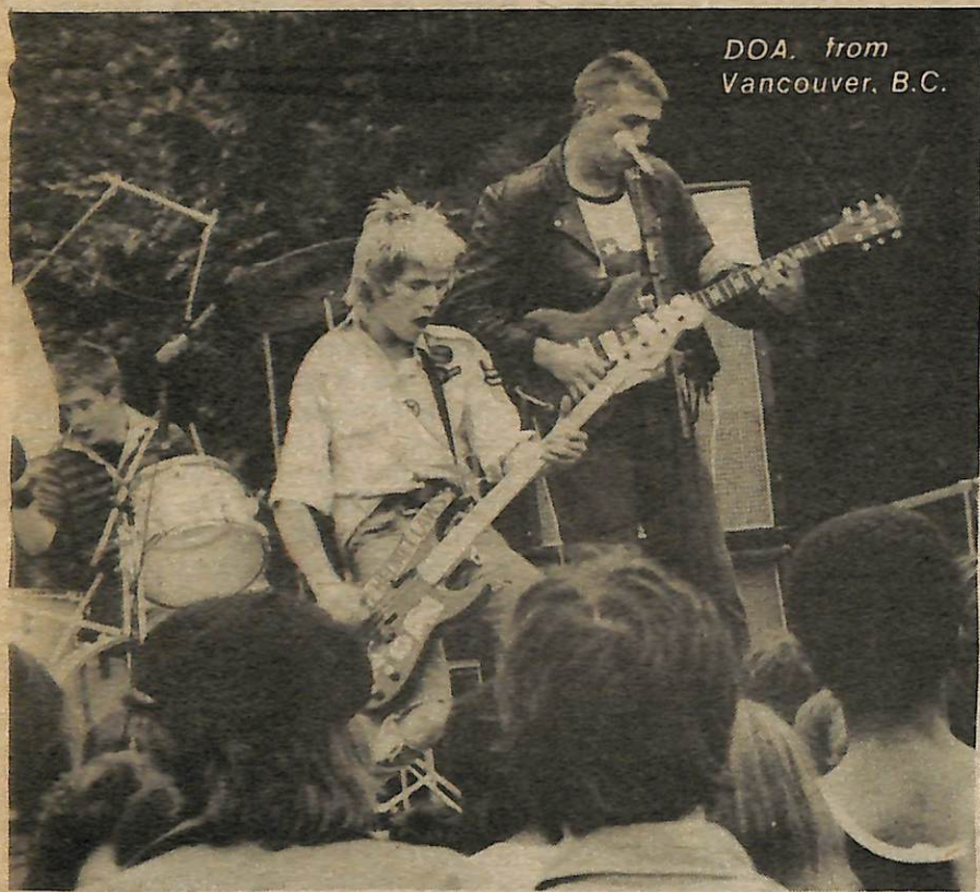
D.O.A. from Vancouver, B.C.