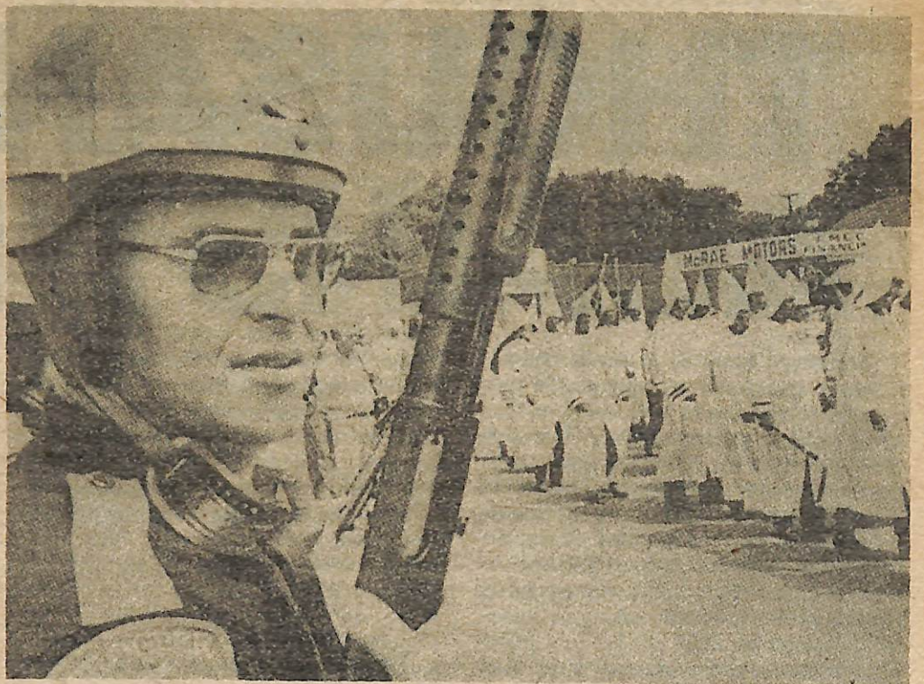
Alabama state troopers guard march route for Klan.

The SCLC's advice on what to do should the pigs or the KKK attack? Roll up into a ball, the men protecting women and children so only their rear