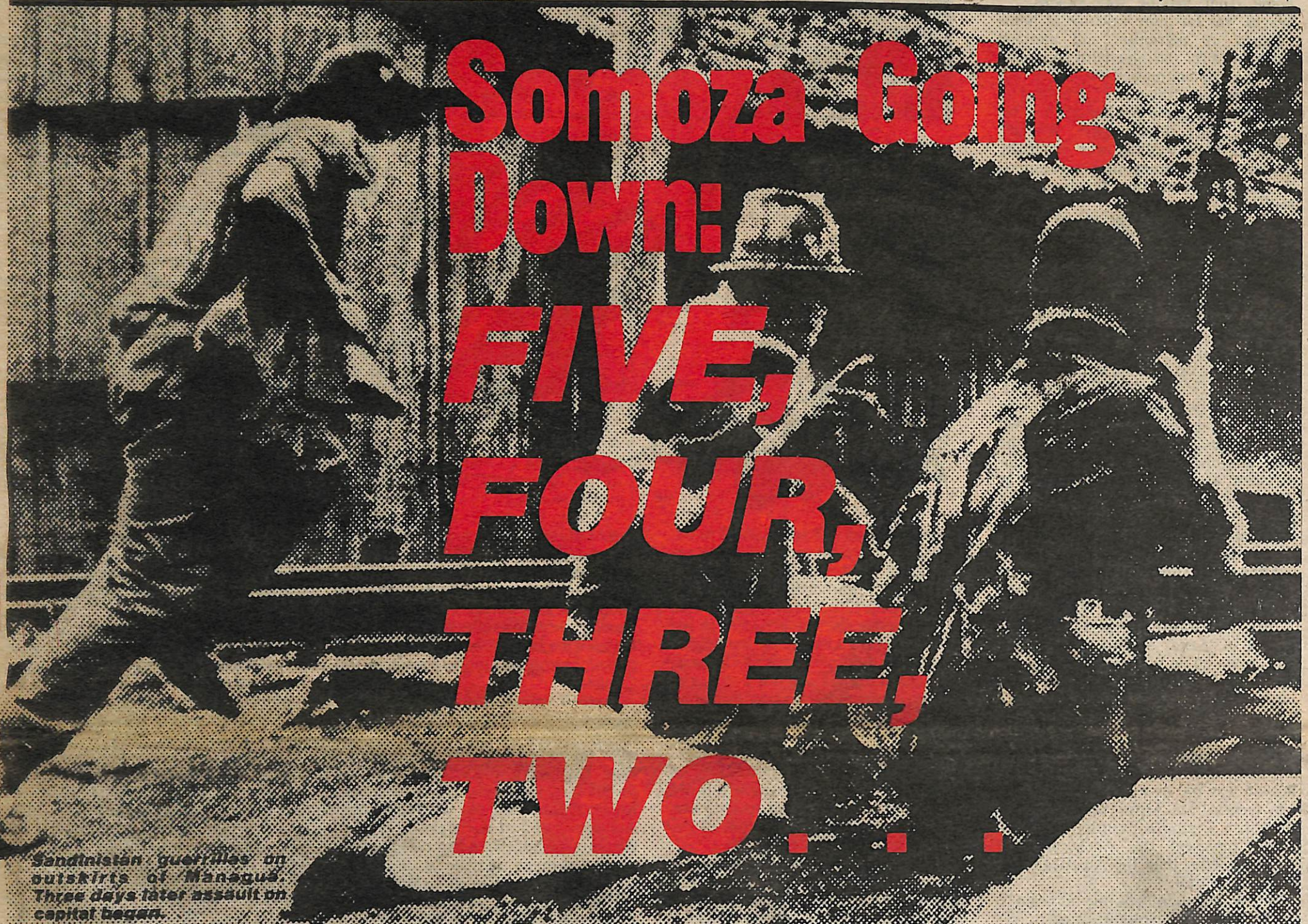
Sandinista guerrillas on outskirts of Managua. Three days later assault on capital began.

Somoza Going Down: FIVE, FOUR, THREE, TWO . . .