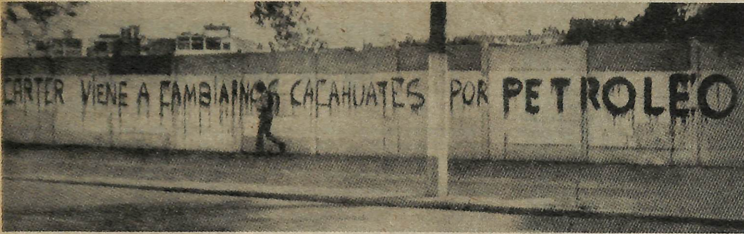
"Carter is coming to exchange oil for peanuts." This sign greeted Jimmy Carter as he stepped into Mexico City last February.

Ever since the born-again hyena Jimmy Carter visited Mexico City in February, there has been a constant stream of politicians, businessmen, bankers, senators, governors, mayors and other assorted bloodsuckers flocking to meet with Mexican President Lopez Portillo. Trade commissions admire "Mexico's developing economy"; and law enforcement agencies on both sides of the border have started to coordinate their programs. One big newspaper columnist declared, "The U.S. is finally giving Mexico the attention and respect she deserves."