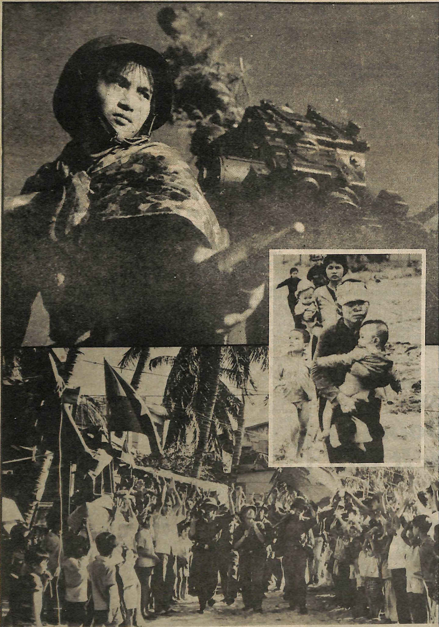
Above: Woman liberation fighter loads artillery piece. Below: NLF troops receive warm welcome as they march into Cam Ranh.

At the end of 1975, Vietnam and the Soviet Union concluded an economic agreement which provided for Soviet participation in future economic planning of Vietnam. A five year plan for economic development was announced in 1976 and it has been estimated that the Vietnamese envisioned upwards of 60% of this plan to be financed by foreign countries. The principal