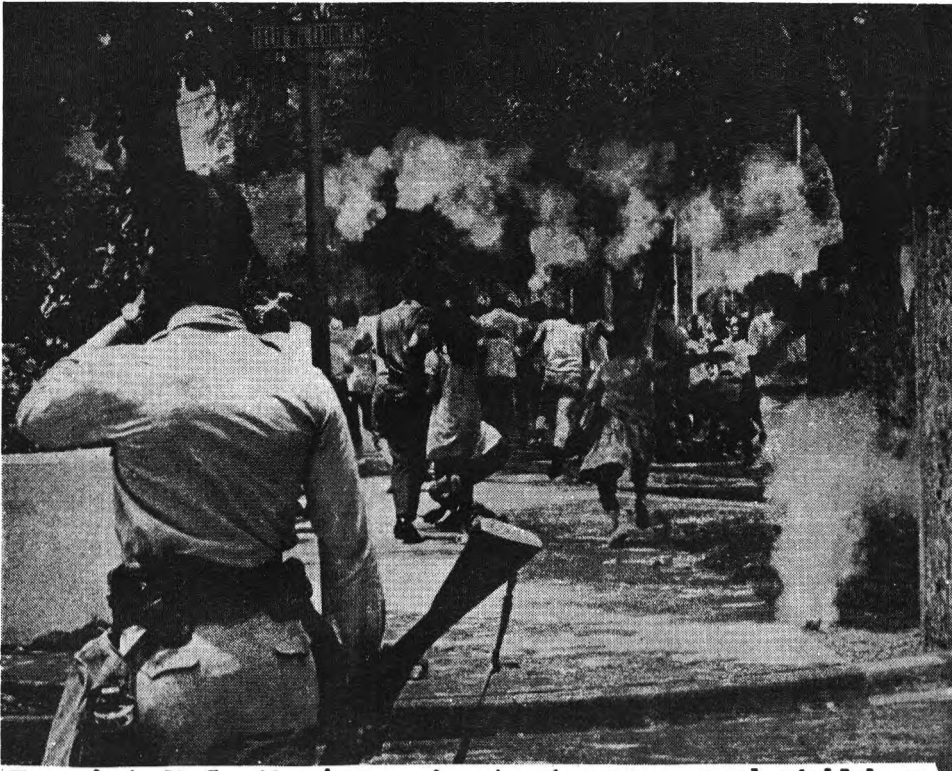
Fascist U.S. Marines shoot at women and children in the Dominican Republic, 1965.