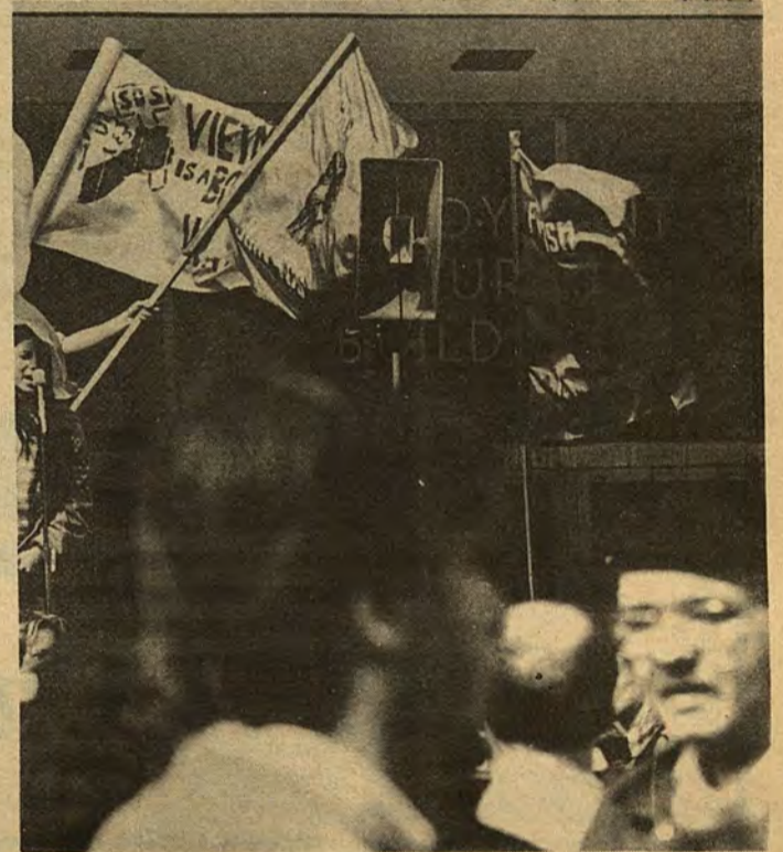
"Vietnam's a Bosses' War, No Layoffs Anymore"