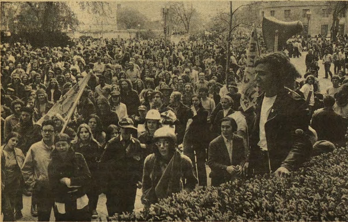
Not a liberal politician in sight

As the liberal politicians and Union hacks droned on, thousands streamed away from the National Peace Action Coalition rally at the Capitol building. NPAC's cop-marshalls, fearing their rotten politics would be exposed, tried to direct students away from the SDS demonstration—saying that it was a cop trap. But thousands walked through their puny "defense" lines.