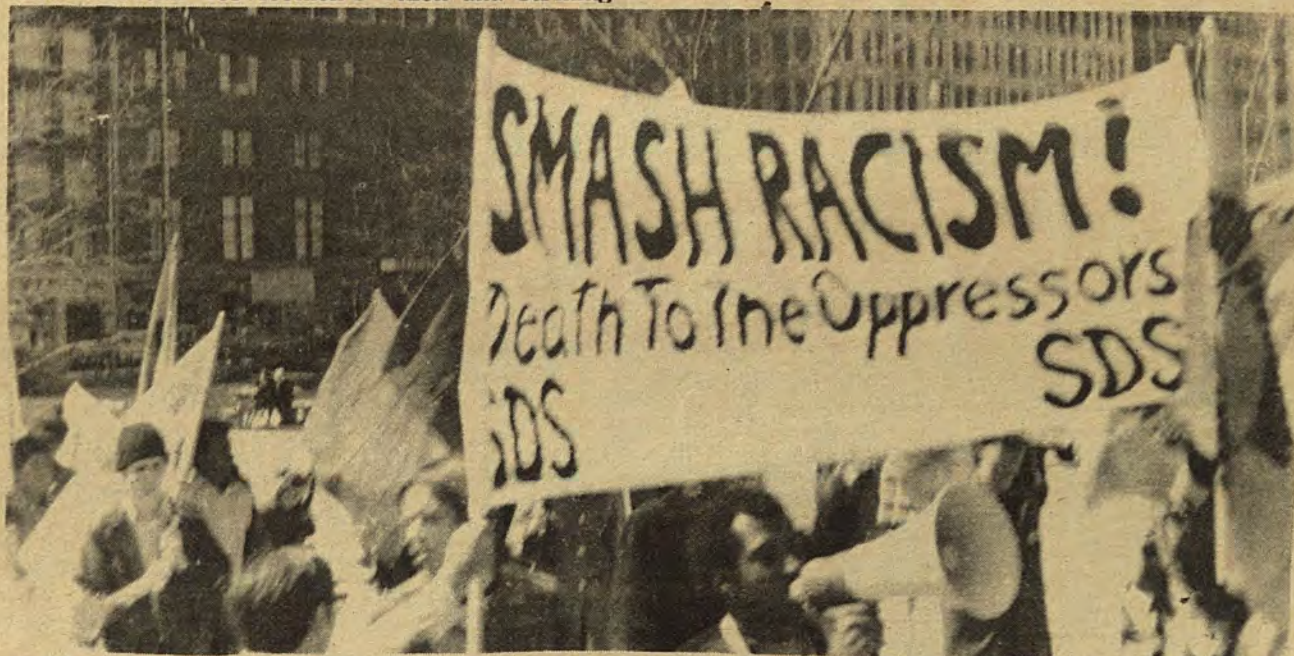
SDS joins in Progressive Labor Party led May Day march for international working class solidarity and Socialism.

(Editorial note: The same day that there was a sit-in against Marine recruiters at the Urbana Campus, about a thousand students marched to a campus auditorium where a South Vietnamese official was speaking. The students chanted the speaker down whereupon he left.)