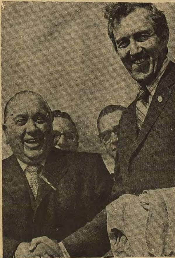
Dove Sen. Muskie, endorser of the April 24 march has no quarrel with well-known Chicago pig.

THE APRIL 24 "MARCH ON WASHINGTON" AND THE MAY 1 "MAY DAY" ACTIONS GOT TREMENDOUS AMOUNTS OF PUBLICITY IN THE BOSSES' NEWSPAPERS AND MAGAZINES. The men who run this country are scared to death of the kind of militant upsurge which took place on hundreds of campuses last spring. They would much rather see students lining up behind members of the Democratic Party, and they love to see the anger over their imperialist war being channeled into such pacifist, anti-working-class actions as blocking traffic. They would rather have movie-star types such as Rennie Davis and Abbie Hoffman leading the movement than have militant workers and students who have involved themselves in everyday struggles of the people.