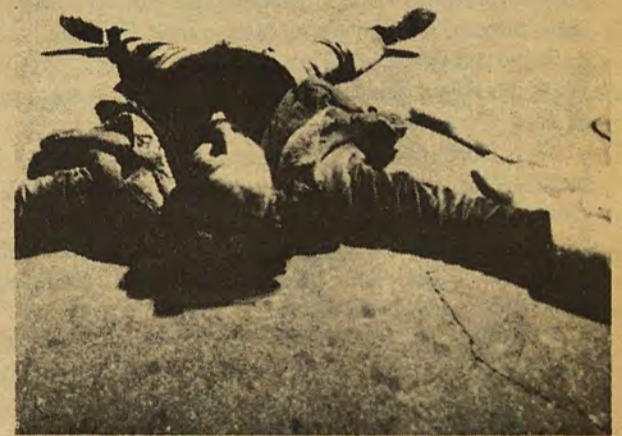
Passive May Day actions can't stop government.