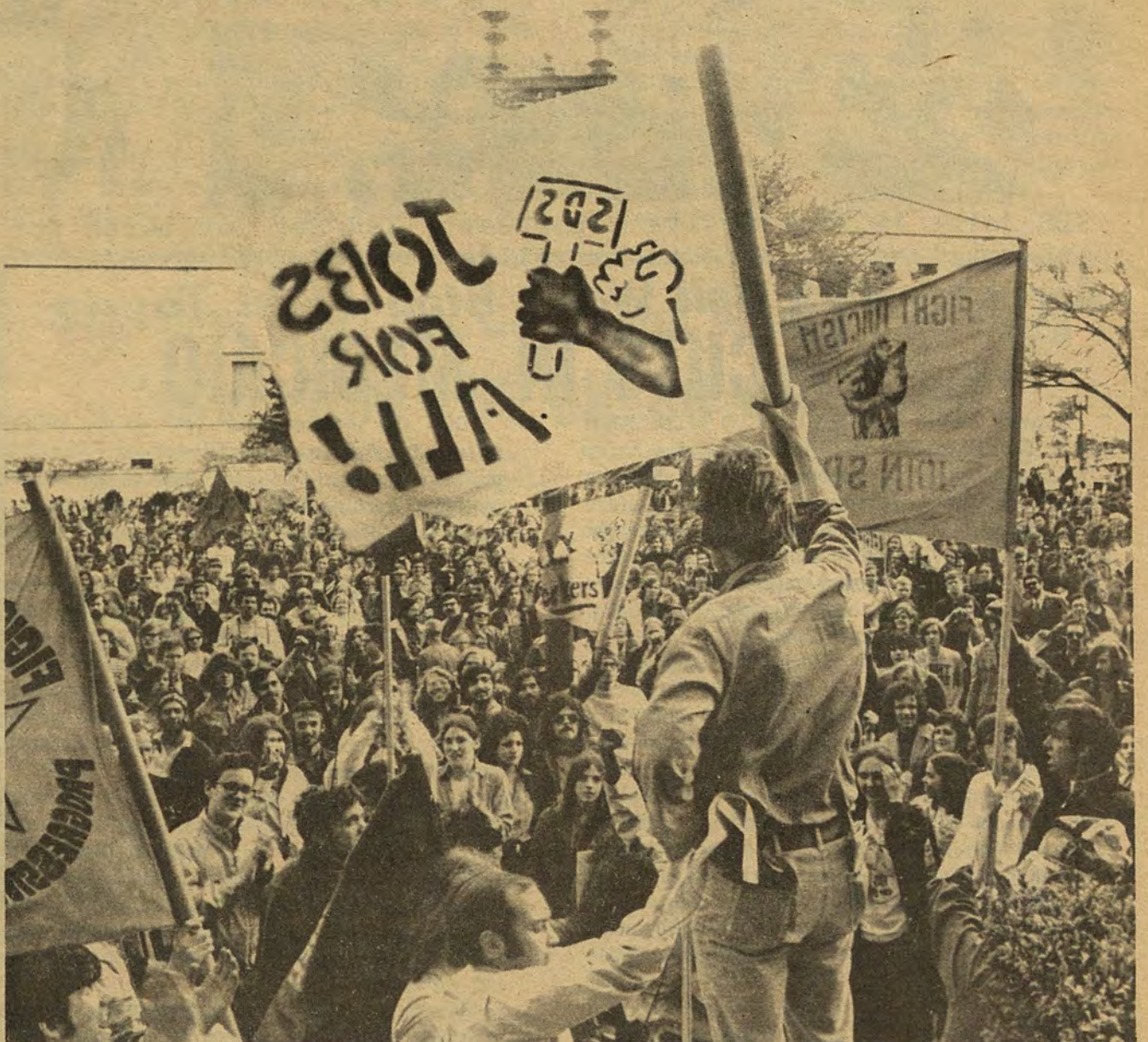
Thousands rejected liberal politicians and the racist, sellout leadership of SMC-NPAC at SDS breakaway demonstration in Washington April 24.

(see p.4 for articles on April 24 and May 1)