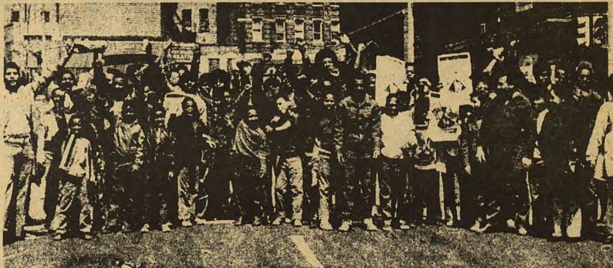
Black and Latin rebels in Brooklyn, New York, fighting against welfare cutbacks smash Roszak's idea that working people are all bought off and support the system.

Divide and conquer is the method of bourgeois rule and Roszak sure knows how to divide. The