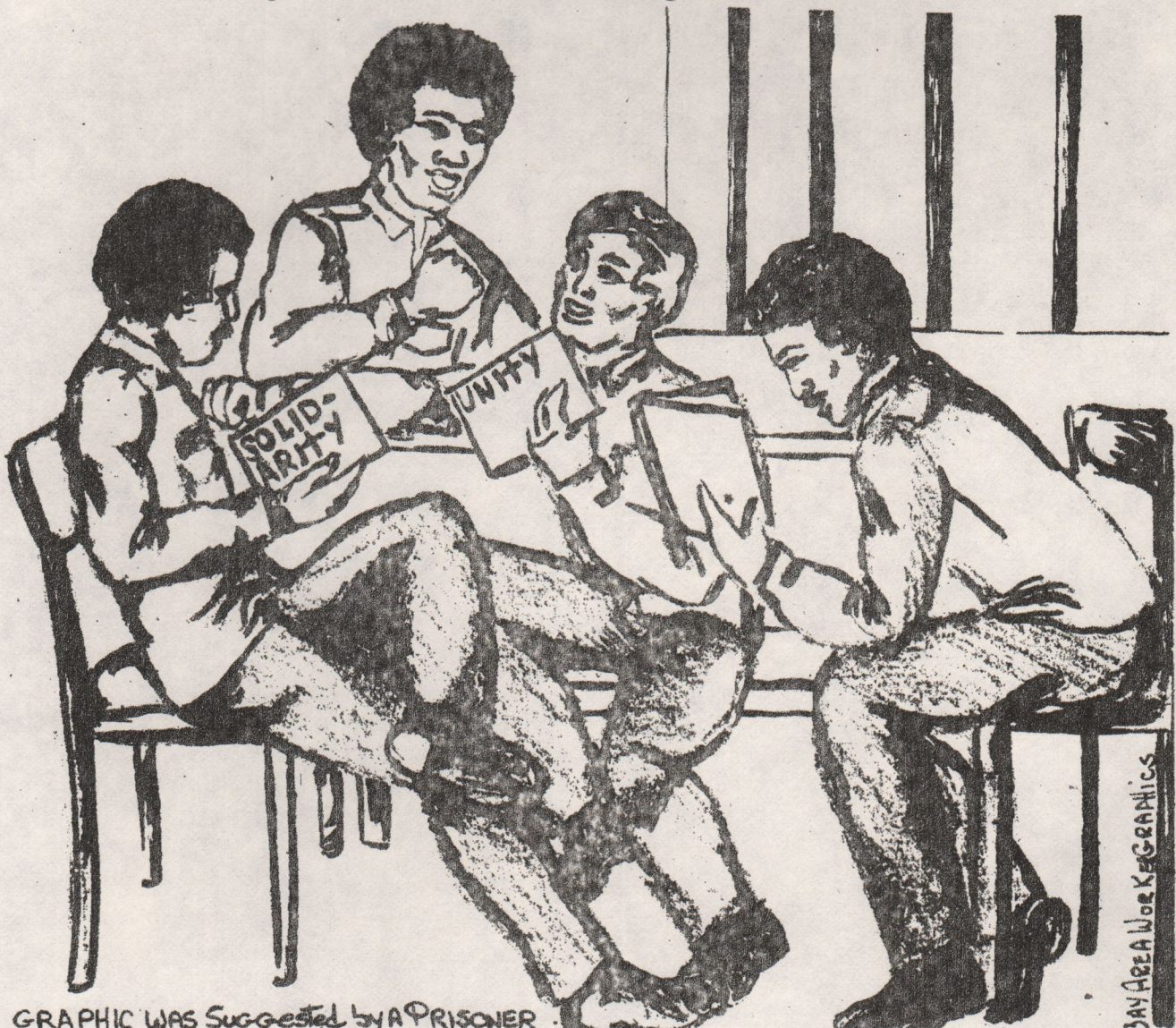
GRAPHIC WAS SUGGESTED BY A PRISONER.

The 6-person jury found the defendants--the guards and the superintendent and assistant superintendent--liable only for compensatory, not for punitive damages. The exact amounts will be determined in future hearings; the guards, not the state of Indiana, are responsible for whatever damages are awarded.