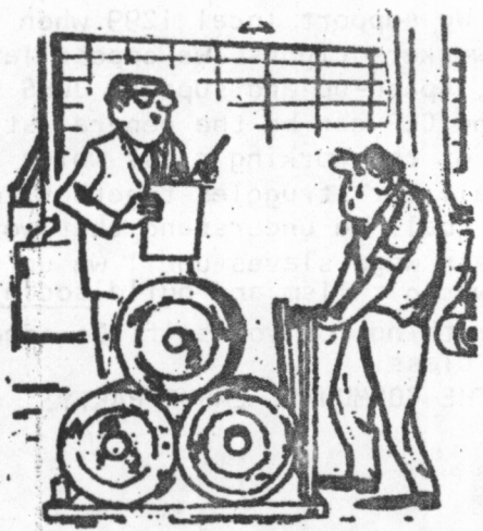
"You've been overworking yourself lately, Burrows. Keep it up!"

The list of examples could go on and on. But what stands out is that workers always pay the price for the economic crisis in Capitalism. The cycle continues with workers worrying about losing jobs, not having money, or having it and not wanting to spent it. We can't buy back the products we produce! At the same time the owners want their continued high profits, forcing fewer of us to work harder and raising their prices as inflation continues to soar. More working people are forced further into depression.