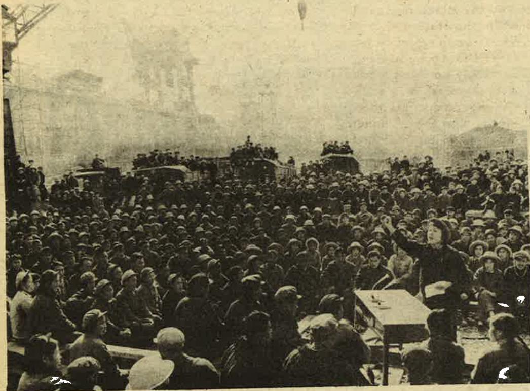
The Chinese working masses, having won great victory in the Great Proletarian Cultural Revolution, are persisting in continuing the revolution under the dictatorship of the proletariat. Here a woman fighter at the Liu-chiahsia Hydroelectric Station in Kiangsu province participates vigorously in the movement to criticize Lin Piao and Confucius in order to combat the revisionists' attempts to restore capitalism.