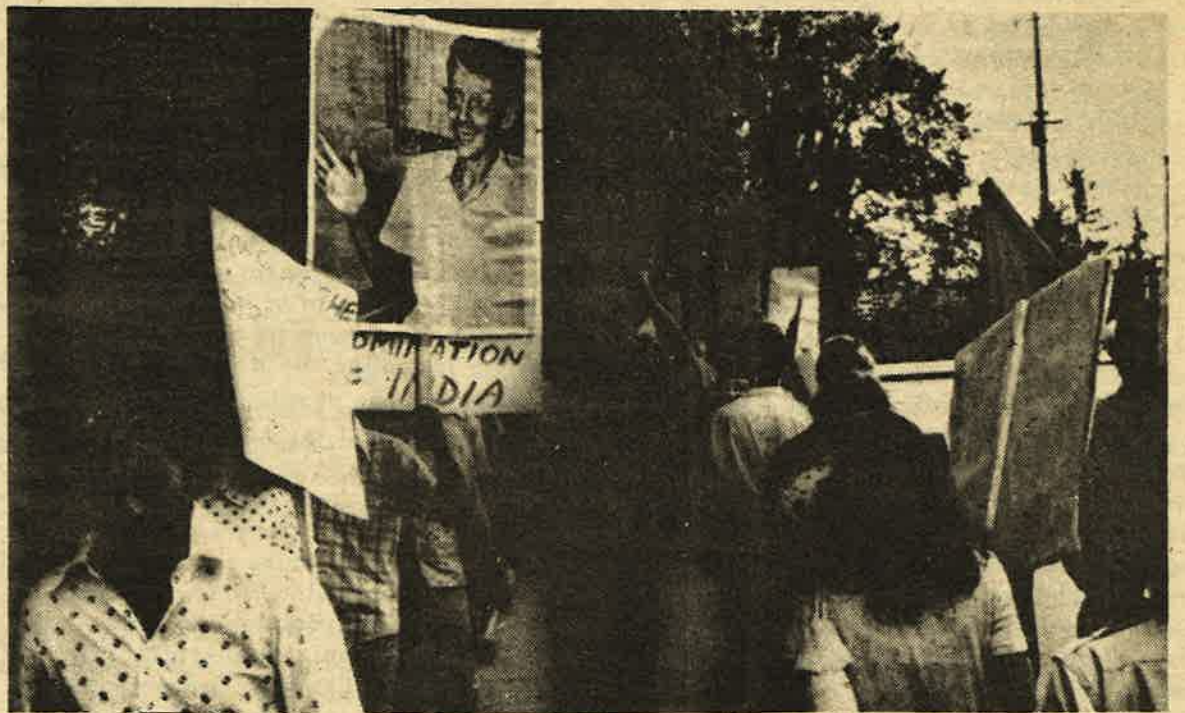
Picture shows a section of the Ottawa picket at Soviet Embassy, showing a portrait of Comrade Charu Mazumdar, beloved leader of the Indian revolution and Chairman of the Communist Party of India (Marxist-Leninist) until his martyrdom at the hands of the Indian reactionaries in July 1972.

August 15, the first day of the campaign, was the sham "independence" day of the Indian reactionary ruling classes, the day when the big Indian landlords and capitalists celebrate their sham "independence" from British colonialism in 1947 in order to hide their sell-out of the land and labor of India to the U.S. imperialists and the Soviet social-imperialists. During the 28 years since "independence" the imperialist powers have perfidiously displayed India as the "world's largest democracy" while actually crushing the Indian people under the fascist rule of a handful of neo-colonial lackeys, the Gandhi's, Nehru's, etc. During this time, the U.S. imperialists have claimed to be the greatest benefactors of the Indian people through so-called "aid"