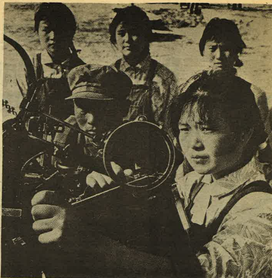
Preparing against the increasing threat of world war by the superpowers, the Chinese People's Liberation Army trains a militawoman of Nanking in anti-aircraft fire.