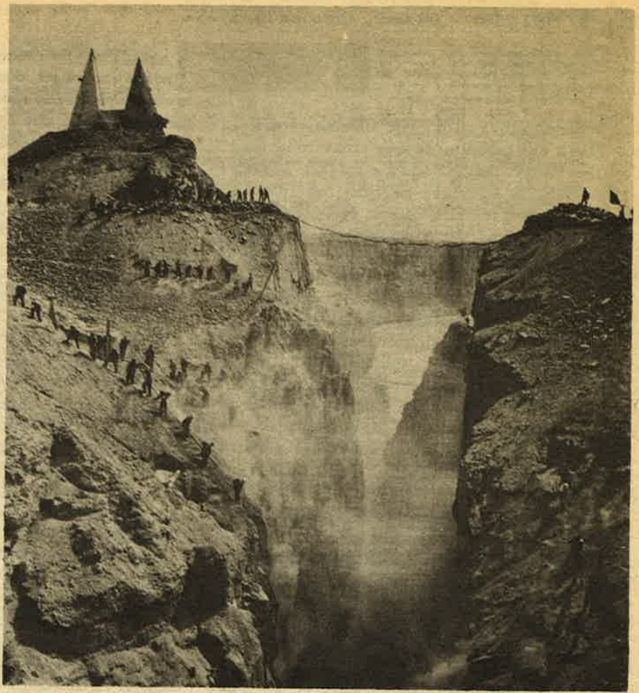
A view of the site where workers are building a hydro-power station on the Karmo River.