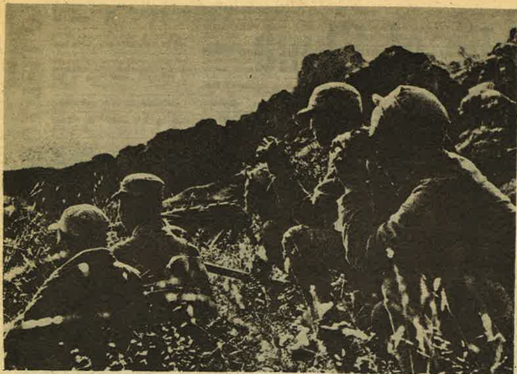
Chinese revolutionary armymen, carrying out a protracted people's war against imperialism, feudalism and bureaucrat-capitalism under the leadership of the Communist Party of China and Chairman Mao, maintain high vigilance on Langya Mountain during the Anti-Japanese War.