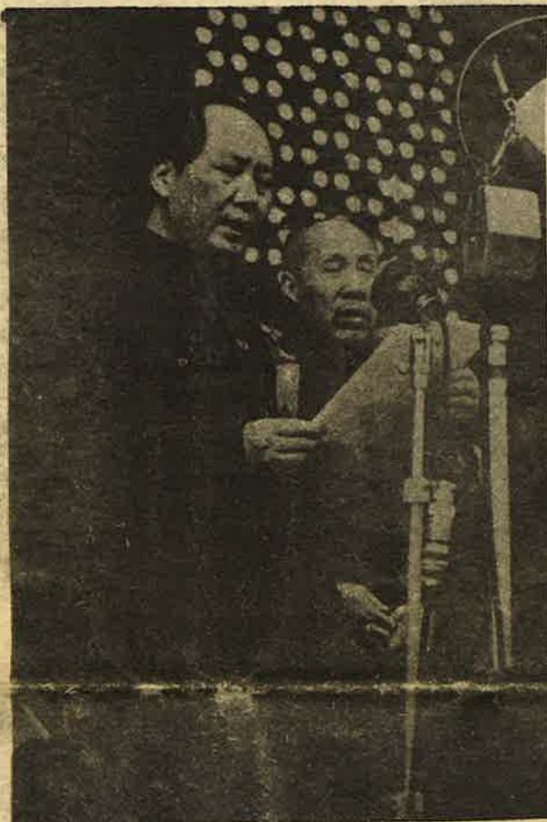
COMRADE MAO TSETUNG, CHAIRMAN OF THE CENTRAL COMMITTEE OF THE COMMUNIST PARTY OF CHINA, READS THE DECLARATION OF THE FOUNDING OF THE PEOPLE'S REPUBLIC OF CHINA AT TIEN AN MIEN SQUARE OCTOBER 1st, 1949, FOLLOWING THE EARTH-SHAKING VICTORY OF THE CHINESE PEOPLE'S PROTRACTED REVOLUTIONARY WAR AGAINST IMPERIALISM, FEUDALISM AND BUREAUCRAT-CAPITALISM.

Today China has become the bastion of world revolution, a bright red beacon of socialism beckoning the world's people forward in the struggle against all reaction. Under the leadership of Chairman Mao and the Party, the Chinese people are continuing the revolution under the dictatorship of the proletariat thus safeguarding socialism in China and working to root out the vestiges of capitalism in order to advance to communism. They are the vanguard marching forward on the common path of the working class and oppressed people of the whole world, the path charted out by Marx, En-