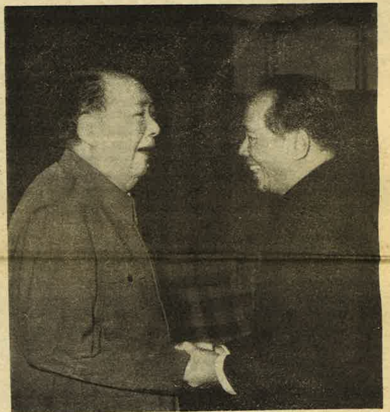
Chairman Mao warmly shakes hands with Samdech Norodom Sihanouk, Head of State of Cambodia and Chairman of the National United Front of Cambodia (top), and Comrade Le Duan, First Secretary of the Central Committee of the Viet Nam Workers Party, heartily congratulating them on the great historic victories of the Indo-Chinese peoples' national liberation wars against U.S. imperialism and its running dogs and for national salvation. Practicing proletarian internationalism, the Chinese people always faithfully support the revolutionary struggles of the oppressed nations and peoples of the world.