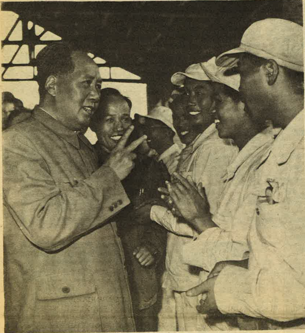
Chairman Mao, the great leader of the Chinese and world's people, cordially chatting with steel workers in Anhwei Province during inspection of their factory in October 1959. Summing up the experience of the world revolution, Chairman Mao has pointed out: "OF ALL THINGS IN THE WORLD, PEOPLE ARE THE MOST PRECIOUS. UNDER THE LEADERSHIP OF THE COMMUNIST PARTY, AS LONG AS THERE ARE PEOPLE, EVERY KIND OF MIRACLE CAN BE PERFORMED."