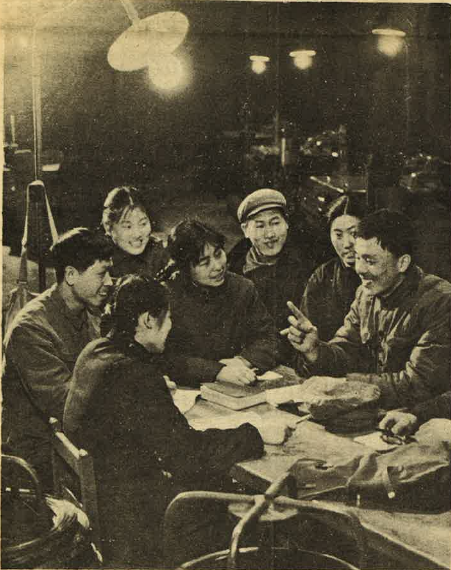
Workers study the works of Marx, Engels, Lenin, Stalin and Chairman Mao in an after-hours study group in the wire-drawing shop at the Talién Steel Mill, one of 300 such groups in the mill. Only by grasping Marxism-Leninism-Mao Tsetung Thought thoroughly can the working class tell genuine Marxism from sham Marxism, continue to make revolution and keep China on the socialist path by exercising all-around dictatorship over the bourgeoisie.