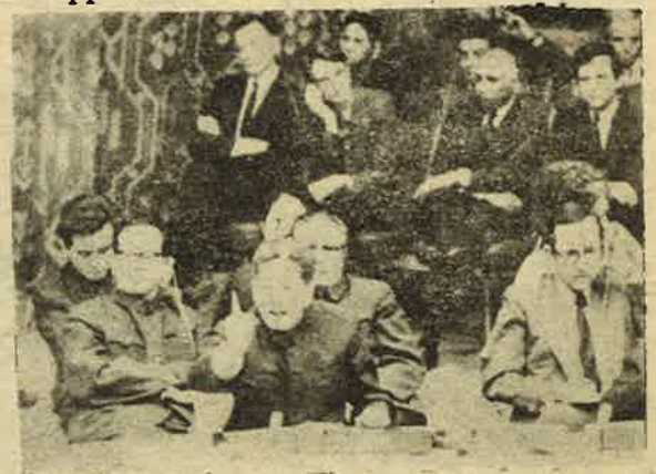
Comrade Chiao Kuan-hua, Chairman of the Chinese Delegation to the United Nations, at the Security Council denouncing the power politics of the two superpowers, U.S. imperialism and Soviet social-imperialism, who colluded to suppress the victorious Arab people in the October 1973 War against the Israeli zionist aggressors.