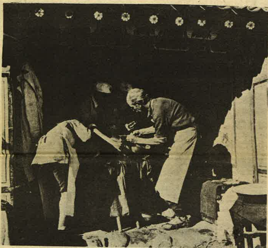
Comrade Norman Bethune, a doctor from Canada, caring for the soldiers of the Chinese Eighth Route Army during the Anti-Japanese War in 1939. Working tirelessly without thought of self, Comrade Bethune, a member of the Communist Party of Canada, heroically sacrificed his life serving the Chinese people and the world revolution.