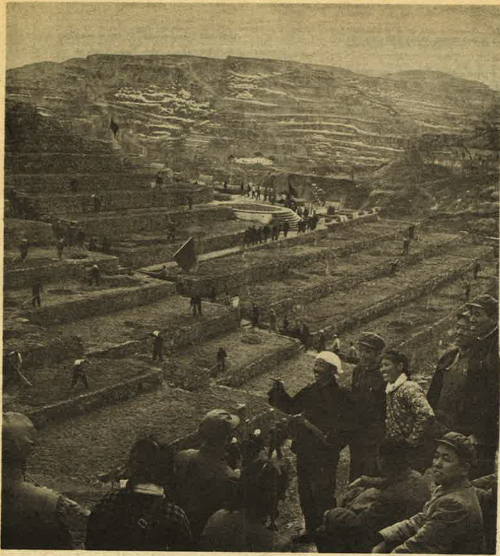
With political power in their hands, the workers and peasants have transformed the face of China. Here a fertile cropland has been built on a rocky mountain slope by the 170,000 people of Hsiangyuan County in their mass movement to "LEARN FROM TACHAI", the national pace-setter in socialist agriculture.