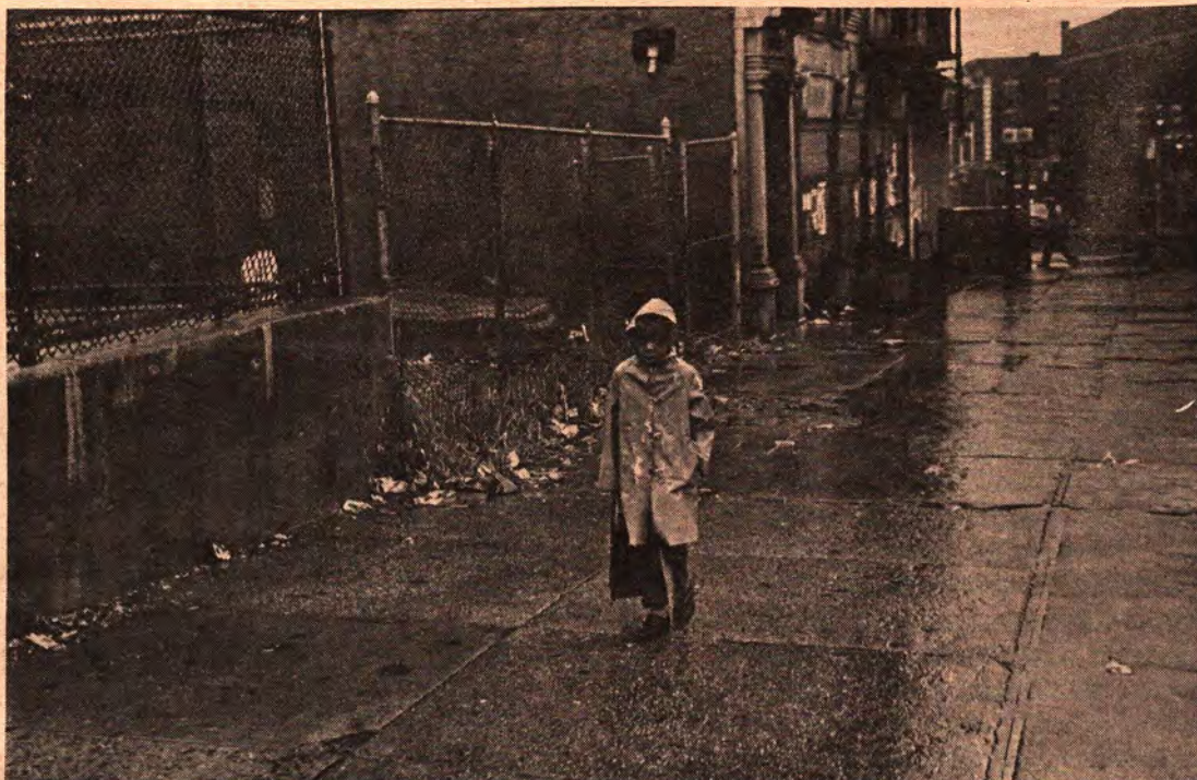
Oceanhill-Brownsville New York City, November 1968

Nor can it be seen isolated from national oppression. The rotten conditions of the Black people living in New York is directly tied to the subjugation of the Black nation on the territory of Afro-Americans--the Black Belt South. Similarly, the conditions of the Puerto Rican national minority is tied directly to the fact that the US imperialists hold in subjugation and domination, the island of Puerto Rico.