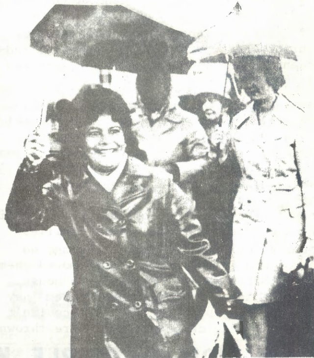
Victorious Trico workers returning to work after winning their 21-week strike for equal pay.

The workers didn't just have to fight the bosses. The 'Equal Pay Tribunal' ruled that there was a 'material difference' in conditions between men and women workers. A placard on the picket line showed the workers' reaction: