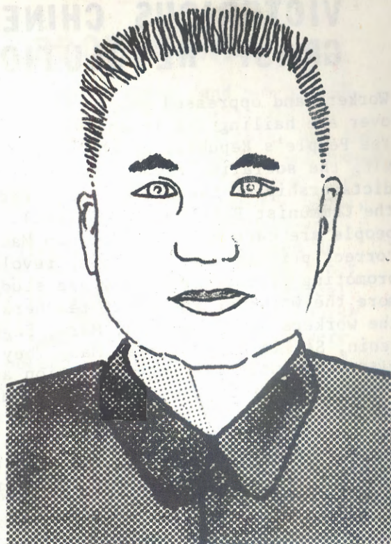
Chairman Hua Kuo-feng, warmly acclaimed new leader of the Chinese Communist Party.

The Party has decided to publish more of the works by their great leader Chairman Mao. They are initiating and leading a mass campaign across China to deepen the study of his works. They have elected a new leader, Chairman Hua Kuo-feng, to succeed and carry on the work of Mao. And the workers and other labouring people are