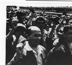
With their copies of Quotations from Chairman Mao Tse Tung in their hands, foreign friends attending the Peking mass rally in support of the struggle of the world's people against U.S. imperialism joyously greet Chairman Mao.

CONCLUSION: In printing Chairman Mao's statement, the May Issues of the Workers Advocate mistakenly omitted the sentence: "FOR THE MASS PEOPLE WHO SUPPORT THE REVOLUTIONARY STRUGGLE OF THE AMERICAN PEOPLE."