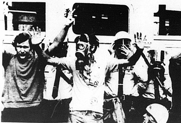
Trained by Trotskyites, these marshalls protect the police from demonstrators during Washington Mobilization in May.