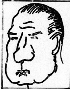
SPIRO T. AGNEW

Running right through this policy like a white thread is the role of Spiro Agnew. His job has been to slander the angry people, blame