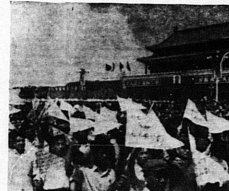
1,500,000 armymen and civilians held a massive demonstration in Peking on May 21, firmly supporting the great leader Chairman Mao's solemn statement in support of the world's struggle against U.S. imperialism. During the demonstration they indignantly denounced U.S. imperialism for its crime of waging the war of aggression in Indo-China.

In Europe, the leading newspapers of the People's Republic of Albania, beacon of proletarianism in Europe, immediately published editorials hailing the solemn statement and their part in carrying the anti-imperialist struggle through to the end. In France, Chairman Mao's solemn statement was read to a mass and got a warm welcome. In Ireland, the Irish Communist Movement (Marxist-Leninist) and the statement with great revolutionary feeling, revolutionary youth and students received it in Britain, various progressive workers, students and revolutionaries from Asia, Africa and groups of Greek workers hailed the solemn