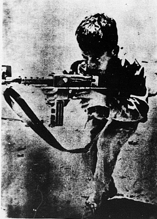
NSINHUA RADIOPHOTO, Peking, June 3, 1970 -- With the steady development of the people's armed struggle of Palestine young guerrilla fighters are growing up rapidly in the course of struggle. Photo: A Palestinian young guerrilla in military training.

Under the fire of mass democratic struggle, all the attempts of these fascist lackeys to intimidate the people will come to no good end!