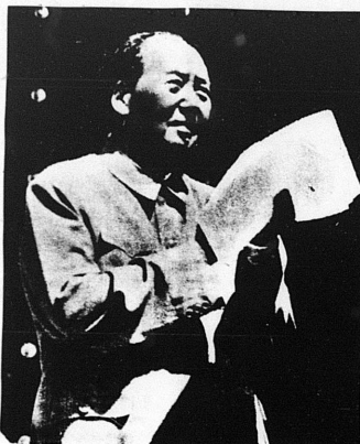
Chairman Mao, the great leader of the Chinese people, on the rostrum of the mass rally held here on May 21 in support of the world's struggle against U.S. imperialism.