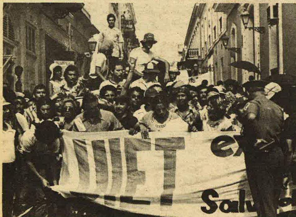
The Independent Union of Telephone Workers (UIET) in Puerto Rico waged a 102 day strike last spring and summer. The Telephone Company has unsuccessfully tried to destroy this militant union.

"LONG LIVE THE REPUBLIC. DEATH TO THE ASSASSINS!"