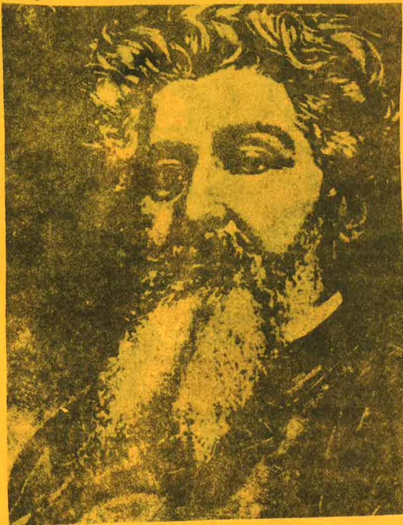
RAMON EMETERIO BETANCES

The struggle against exploitation and Spanish colonialism continued to develop. On September 23, 1868 the Puerto Rican people, led by the members of the secret societies mentioned before staged the first armed uprising in the country for national independence. After hard struggles the Puerto Rican patriots succeeded in routing the Spanish army to the mountain town of Lares and they proclaimed the Republic of Puerto Rico. Immediately after this, the armed forces of the Republic were to take the town of San Sebastian and the rest of the island with the aim of liberating our country from the Spanish colonial yoke. But, after a bloody struggle the Spanish army succeeded by force of numbers in dominating the armed insurrection. Two negative factors that affected this result were: the lack of big extensions of forests such as the Sierra Maestra or the Sierra Cristal in Cuba where our revolutionaries could escape to prepare a counterattack and the fact that a ship and arms that were