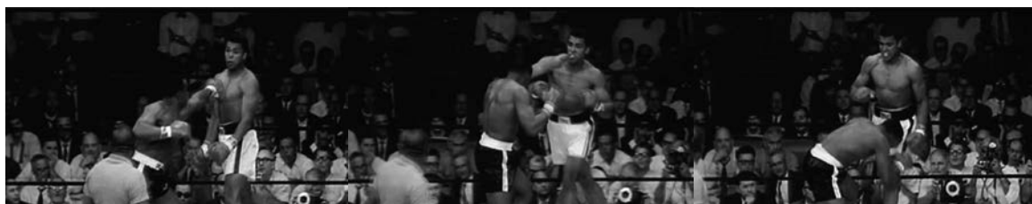
Figures 3–5. Muhammad Ali momentarily rears back to avoid Sonny Liston’s jab and then counterstrikes, knocking Liston to the canvas during their rematch for the world championship. Lewiston, Maine, May 1965.

ing abdomen over six rounds before Liston failed to answer the bell for the seventh round. One year later, after changing his name to Muhammad Ali, he would display a similar kind of elusive, graceful movement when he defended his title against Liston, knocking him to the canvas with what seemed to be a phantom counter punch to a Liston jab that Ali simply sidestepped (figs. 3, 4, 5).