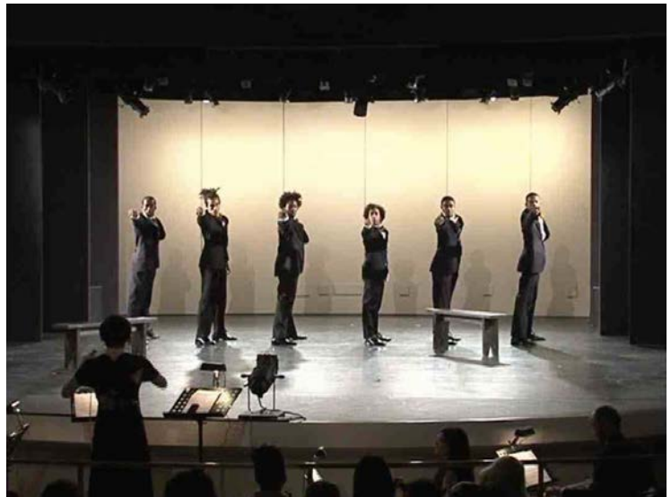
Figure 12. The ensemble has transitioned from paramilitary fatigues into suits in the style of the Nation of Islam in Sweet Science Suite: A Scientific Soul Session Honoring Muhammad Ali. The Peter B. Lewis Theater, Guggenheim Museum, NY, 13 November 2011.