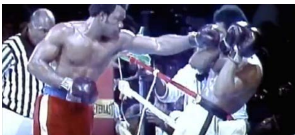
Figure 6. George Foreman hits Ali with a left jab as Ali leans on the ropes during the fight for the world championship. Kinshasa, Zaire, 30 October 1974.

By throwing a series of right-hand leads at the beginning of the bout, 32-year-old Ali confused and enraged the younger, stronger 24-year-old Foreman. Ali convinced Foreman that he was going to dance, as he had often done in the past, encouraging the crowd in Zaire to cheer “Ali, bomaye” (Ali, kill him). However, because of Ali’s long absence from the ring, and subsequent decline in athletic ability, he could not beat Foreman by trading blows. Instead, Ali retreated to the ropes, leaning against them allowing his body to absorb Foreman’s power until the fifth round of the fight. By the seventh round, Foreman had