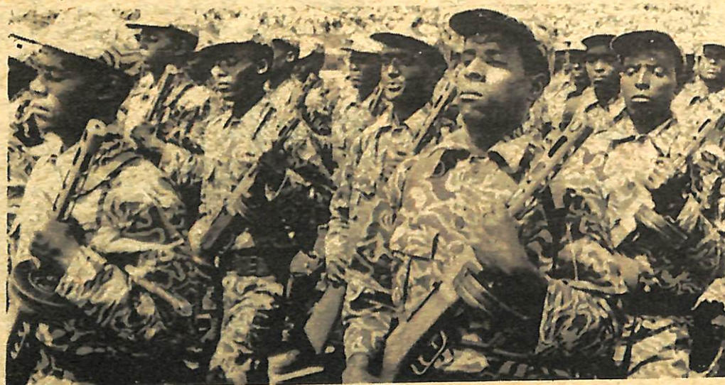
Soldiers of the Ethiopian People's Revolutionary Army - who are fighting to free their country from all foreign domination and their Ethiopian puppets

And that is why the RSB is still convinced as we said at the 1977 convention, "We are the minority to become the majority. We are the first of many more. This young communist league will enable us to forge a whole other future for the youth to take. A life of standing with the oppressed against the oppressor. A life of serving the people today and contributing to liberate mankind entirely." ■