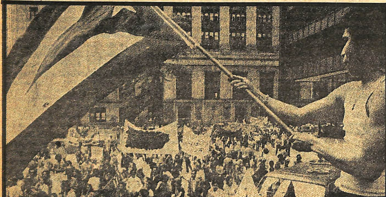
The fight against police repression in Humboldt Park - this Avakian called "embarrassing".

The Avakianites have chosen to trail, to gesticulate, to criticize, and most importantly to stand in the way of the struggle.