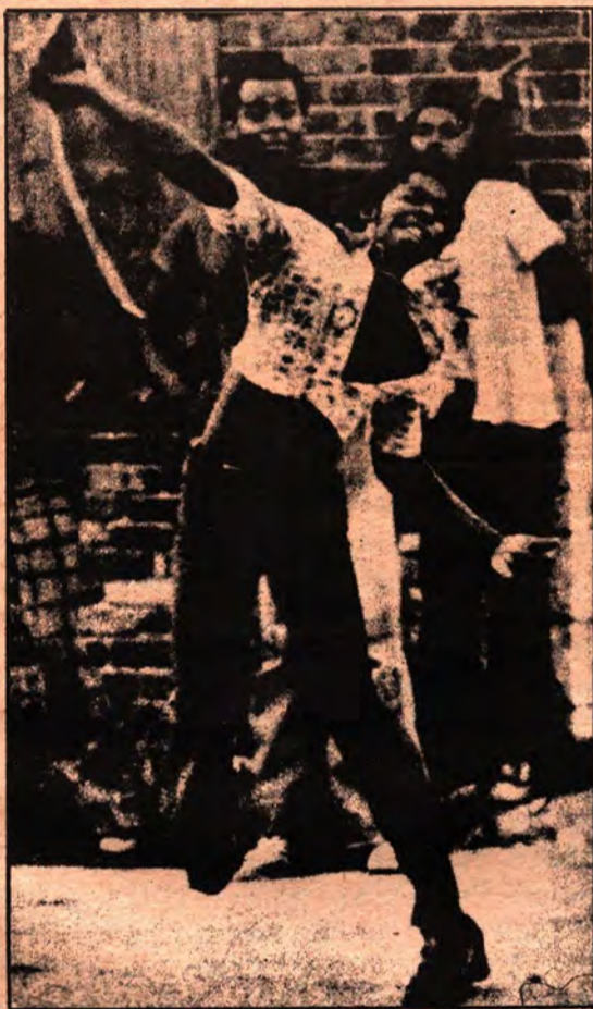
THE CAPITALIST CLASS WILL PAY FOR EVERY YOUNG LIFE TAKEN FROM THE RANKS OF THE REVOLUTIONARY MASSES.

We stand by the right of the proletariat to bear arms, to fight back against the bourgeoisie who tries to kill us everyday either by starvation, or out and out murder.