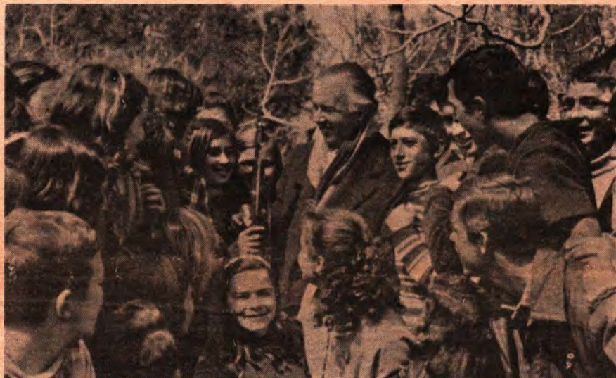
Comrade Enver Hoxha among the students of the "Ali Demi" secondary school of general education.

We in the superpowers, U.S. Imperialism and Soviet Social Imperialism, have a great duty to complete. We stand on proletarian internationalism to smash the bourgeois state here, building the U.S. Bolshevik Party to lead the Proletariat who leads all the oppressed masses in making proletarian revolution. The conditions