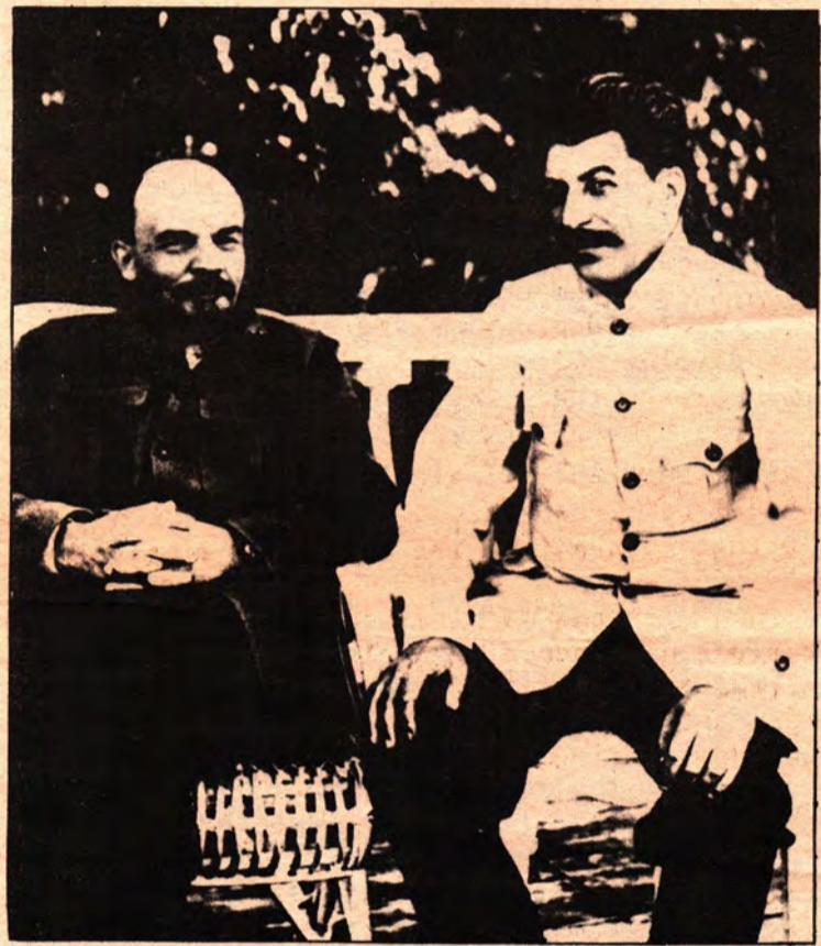
COMRADES LENIN AND STALIN TWO OF THE GREAT TEACHERS AND LEADERS OF THE INTERNATIONAL PROLETARIAT.

"But the Party cannot be only an advanced detachment. It must at the same time be a detachment of the class , part of the class, closely bound up with it by all the fibers of its being. The distinction between the advanced detachment and the rest of the working class, between Party members and non-Party people, cannot disappear until classes disappear; it will exist as long as the ranks of the proletariat continue to be replenished with former members of other classes, as long as the working class as a whole is not in a position to rise to the level of the advanced detachment. But the Party would cease to be a party if this distinction developed into a gap, if the Party turned in on itself and became divorced from the non-Party masses. The Party cannot lead the class if it is not connected with the non-Party masses, if there is no bond between the Party and the non-Party masses, if these masses do not accept its leadership, if the Party enjoys no moral and political credit among the masses." (Selected Writings - J.V. Stalin, pg. 121)