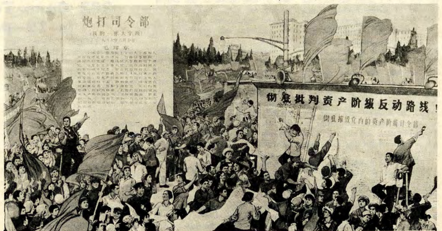
"Unleash the Masses, Bombard the Headquarters!" proclaims this picture from China, which shows the power of the masses unleashed during the Cultural Revolution through mass line.