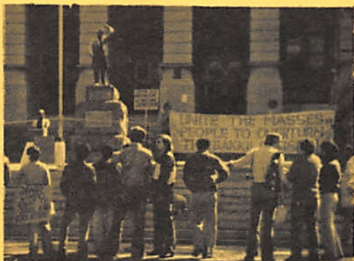
Atlanta Committee Against the Bakke Decision rally at Georgia state capitol on October 15, 1977.

Earlier in the month, the Black American Law Students Association organized nationwide demonstrations against the Bakke