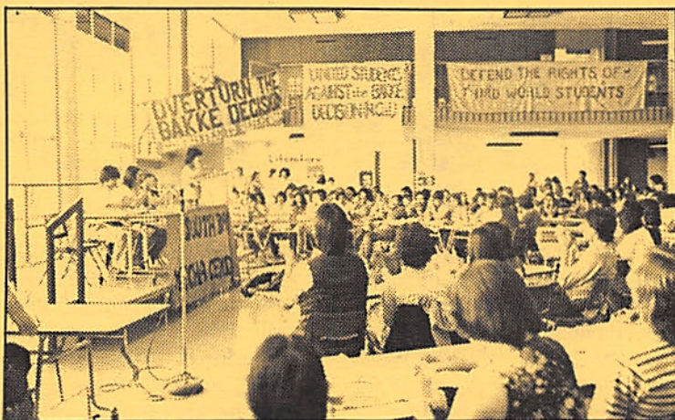
Over 300 individuals and groups from throughout California united to form the ABDC in San Jose on June 26, 1977.

The ABDC has its roots in the grass roots organizing activity that has taken place on campuses, communities, and workplaces in California throughout the year.