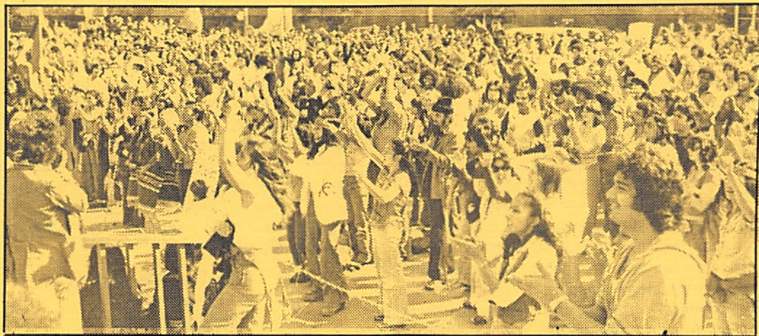
4,000 people demand "Smash the Bakke Decision" and "End National Oppression" at the San Francisco Federal Building on October 15, 1977.

all walks of life, uniting together to bring forth their demands. Each had come to San Francisco with a clear determination to smash the racist Bakke decision and build the struggle against each and every instance of national oppression.