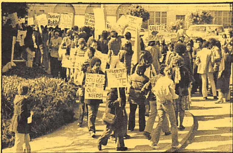
Militant chants of "Colluding with the Courts to Attack our rights, UC Regents we plan to fight" rang throughout the picket line sponsored by USABD on May 20, 1977.

is just a continuation of their reactionary stand."