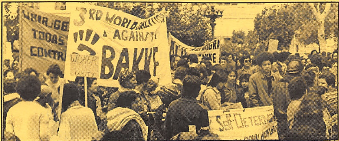
2,000 students, workers, community and revolutionary groups joined the statewide MEChA's in protesting the Bakke Decision in Los Angeles on May 7, 1977.

And since the Bakke decision also threatens affirmative action and other related programs for women, we must link it to the struggle for women's equality , including demands such as against the forced sterilization of Third World women, for equal hiring and promotions for women, for pregnancy and other benefits for women workers, and day care for working and Third World women.