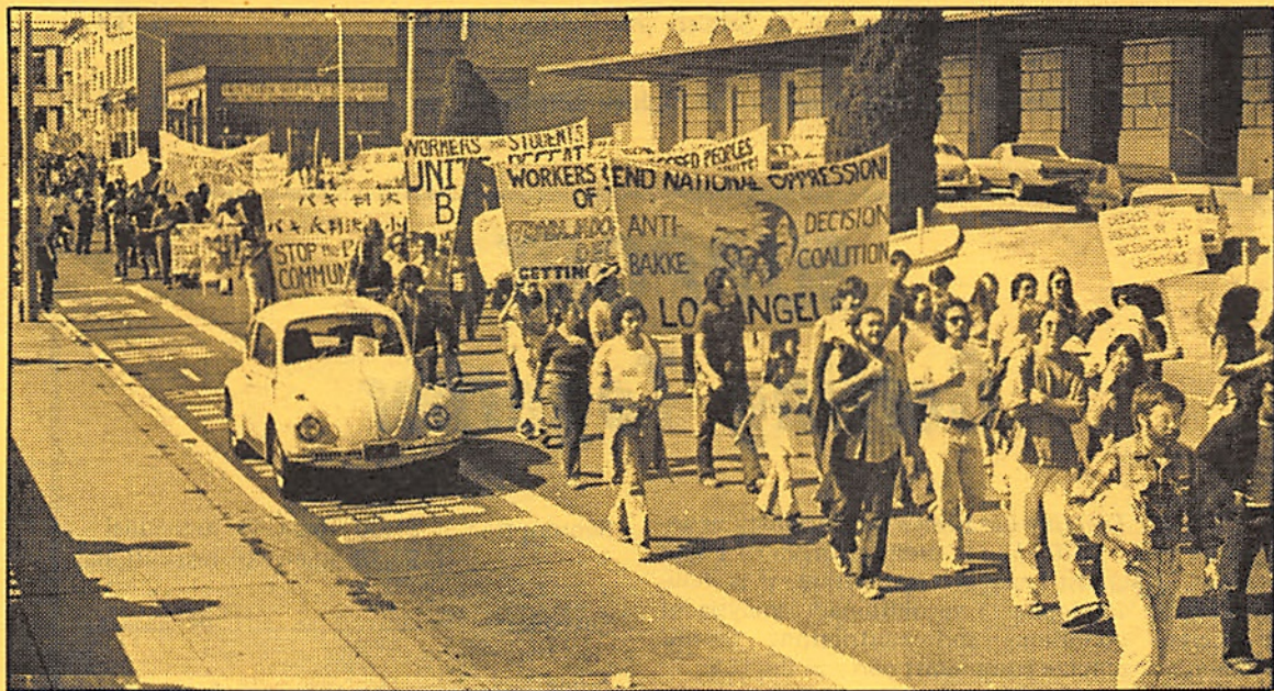
October 15, 1977 march sponsored by the ABDC stretched for 20 blocks through the streets of San Francisco with contingents from all parts of California.

SMASH THE BAKKE DECISION! DOWN WITH IMPERIALISM! END NATIONAL OPPRESSION!