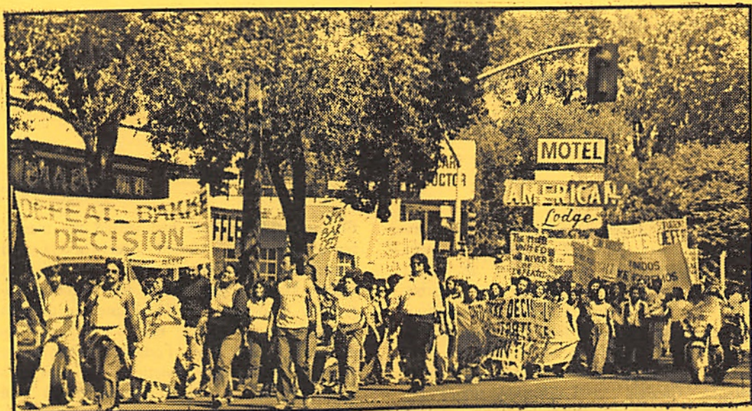
Militant march by the ABDC and MEChA's through the Black, Chicano and Asian communities of Sacramento on Sept. 17, 1977.

The marchers leafletted the communities, held rallies, organized presentations, and did extensive outreach along the march route, which extended through Fremont, Niles, Livermore, Stockton, Lodi and Sacramento.